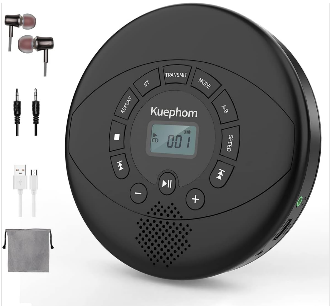
Figure 1: Kuephom Portable Bluetooth CD Walkman and its accessories, including earbuds, audio cable, charging cable, and pouch.