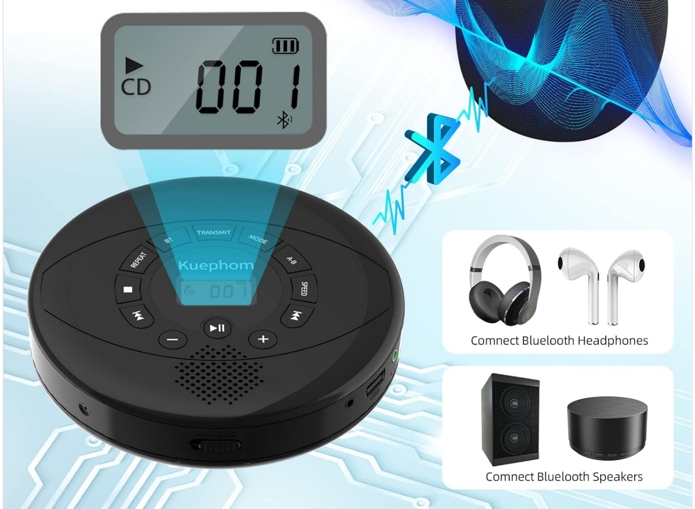
Figure 5: The portable CD player actively transmitting audio via Bluetooth to both headphones and a separate Bluetooth speaker, illustrating its wireless output capability.

It can sync with bluetooth earbuds or speakers