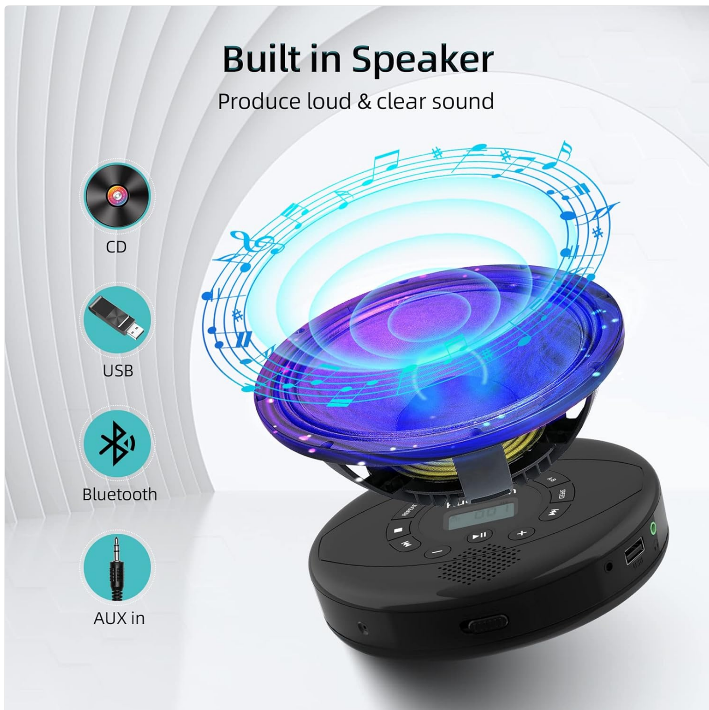
Figure 6: Illustration of the built-in speaker and the various audio input options supported by the device, including CD, USB, Bluetooth, and AUX in.