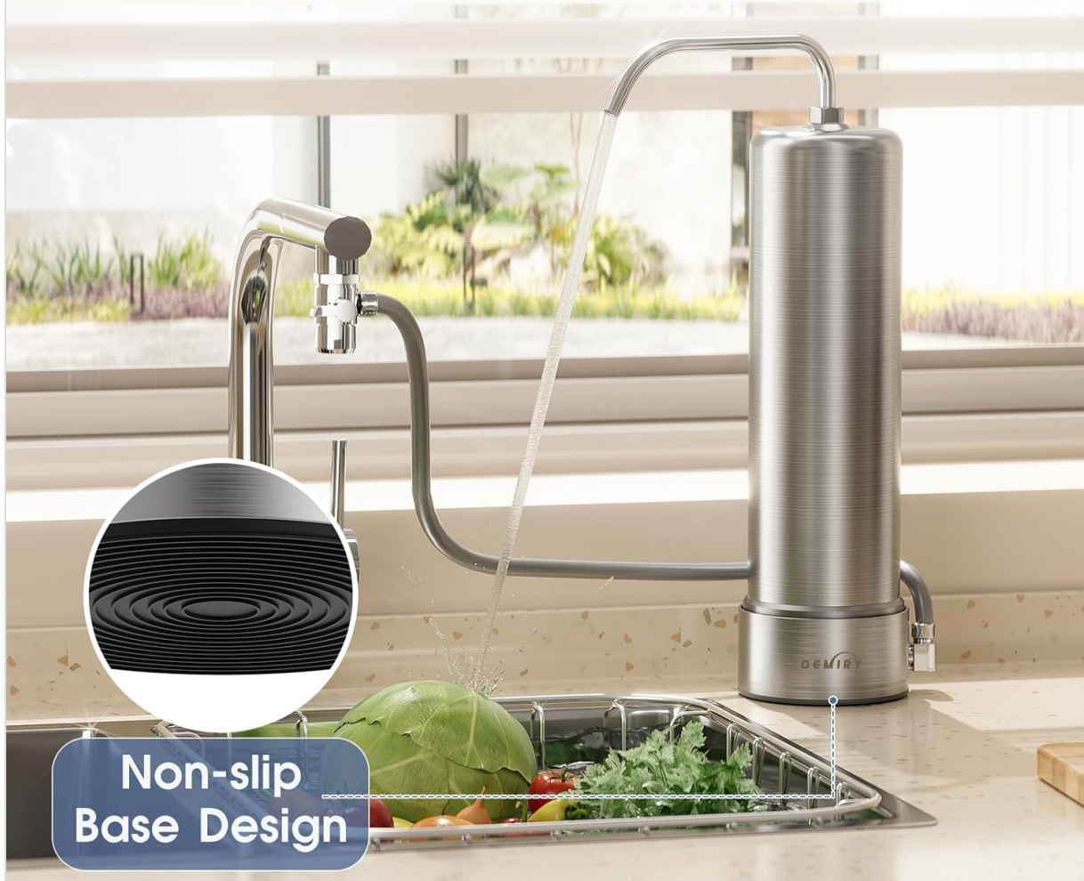
Image: The OEMIRY OM-CF01 system demonstrating the quick switch functionality between tap water and filtered water flow.