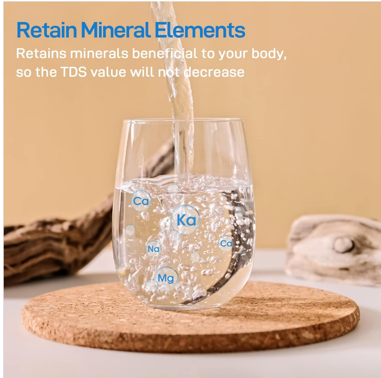
Image: Diagram illustrating that the filter retains beneficial minerals like Calcium (Ca), Magnesium (Mg), Sodium (Na), and Potassium (K), which means the TDS value will not decrease.

It is important to note that this filtration system is designed to retain beneficial minerals in the water. Consequently, it will not significantly reduce the Total Dissolved Solids (TDS) value. If your objective is to physically remove TDS, consider using an OEMIRY Reverse Osmosis (RO) system, such as model OM-ROF03 or B0DNDV2JKF.