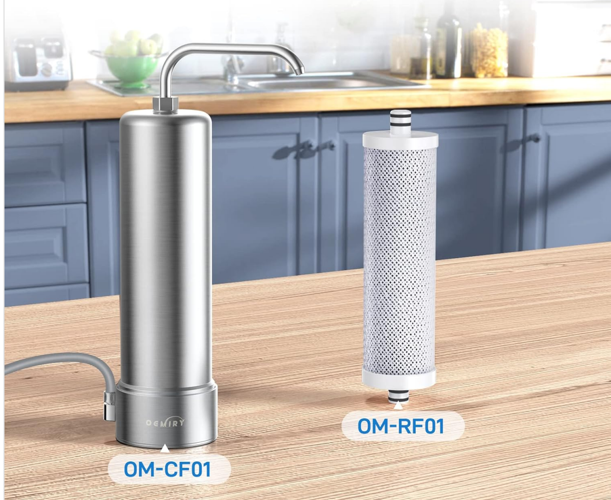
Image: OEMIRY OM-CF01 Countertop Water Filter System with Replacement Filter