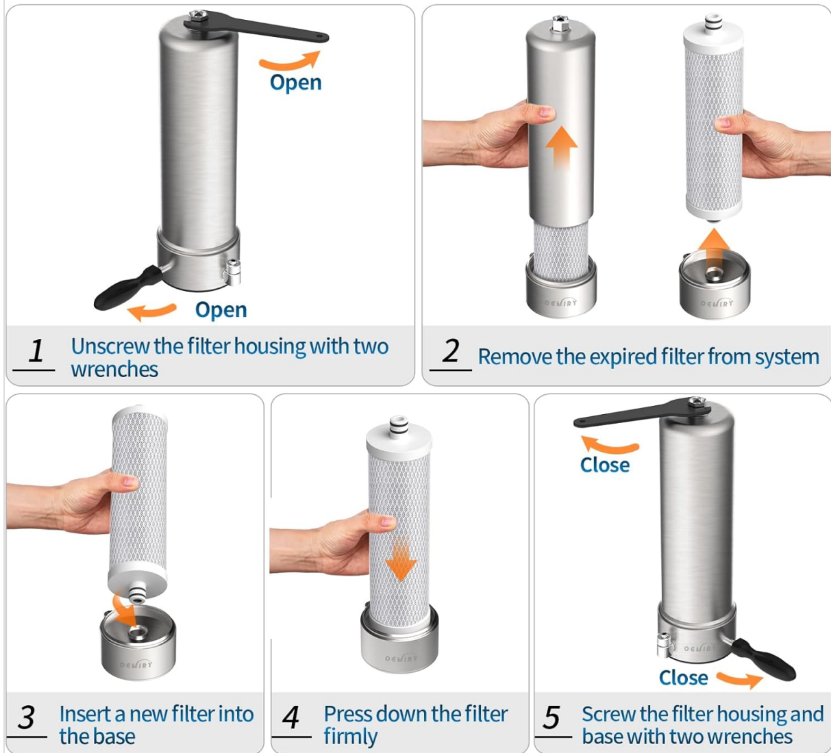
Image: Visual guide for filter replacement, showing the process from unscrewing the housing to inserting a new filter.