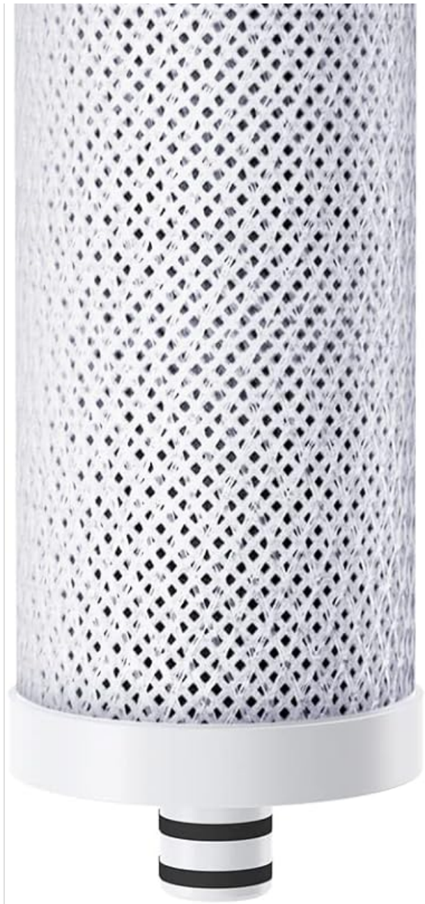
Image: OEMIRY OM-CF01 Replacement Filter

The filter is constructed with 304 food-grade stainless steel, ensuring durability and safety. It is also BPA-free and features a fingerprint-resistant brushed appearance.