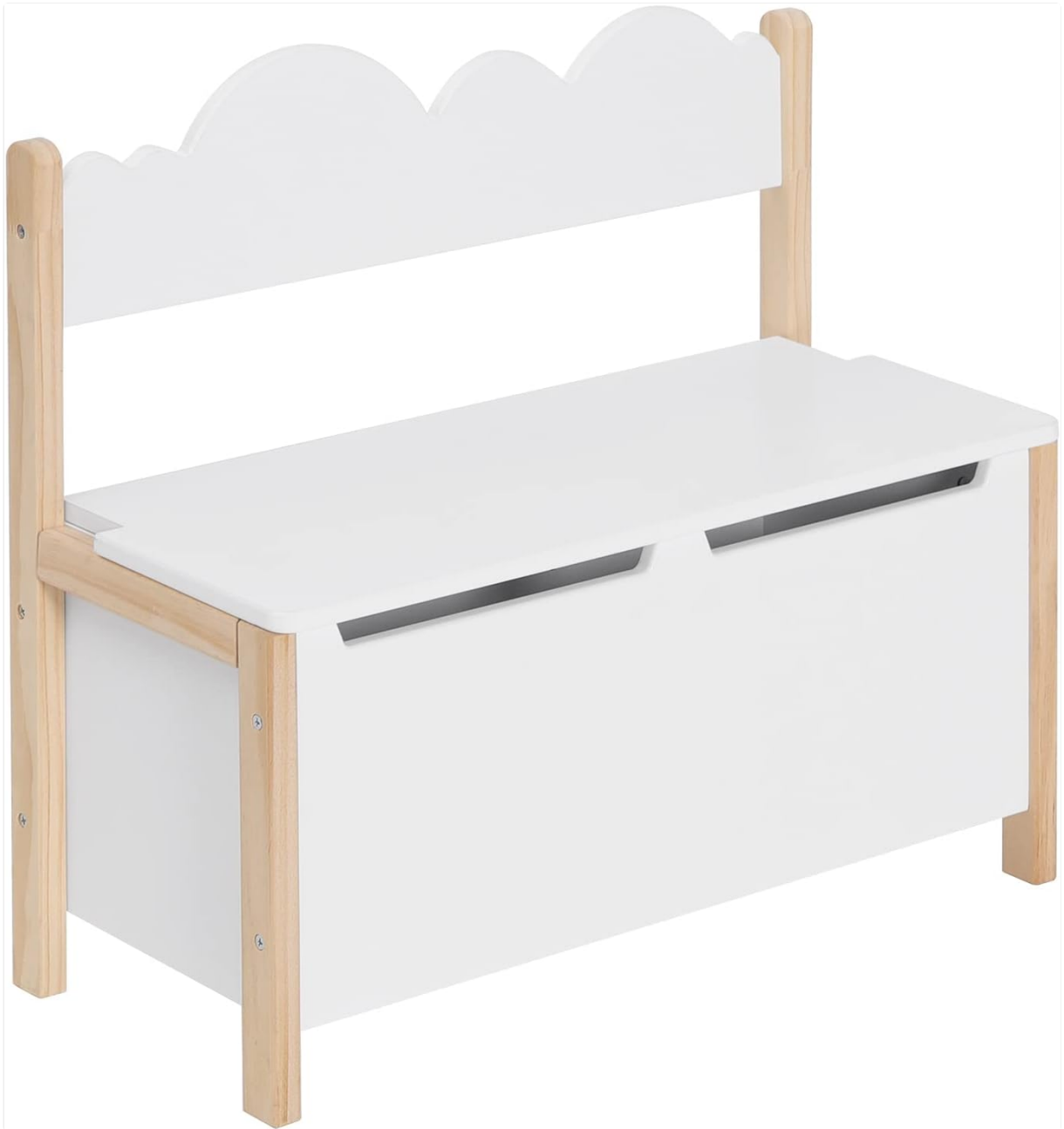
Image: The WOLTU Children's Bench with Storage in its closed position, showcasing its design.