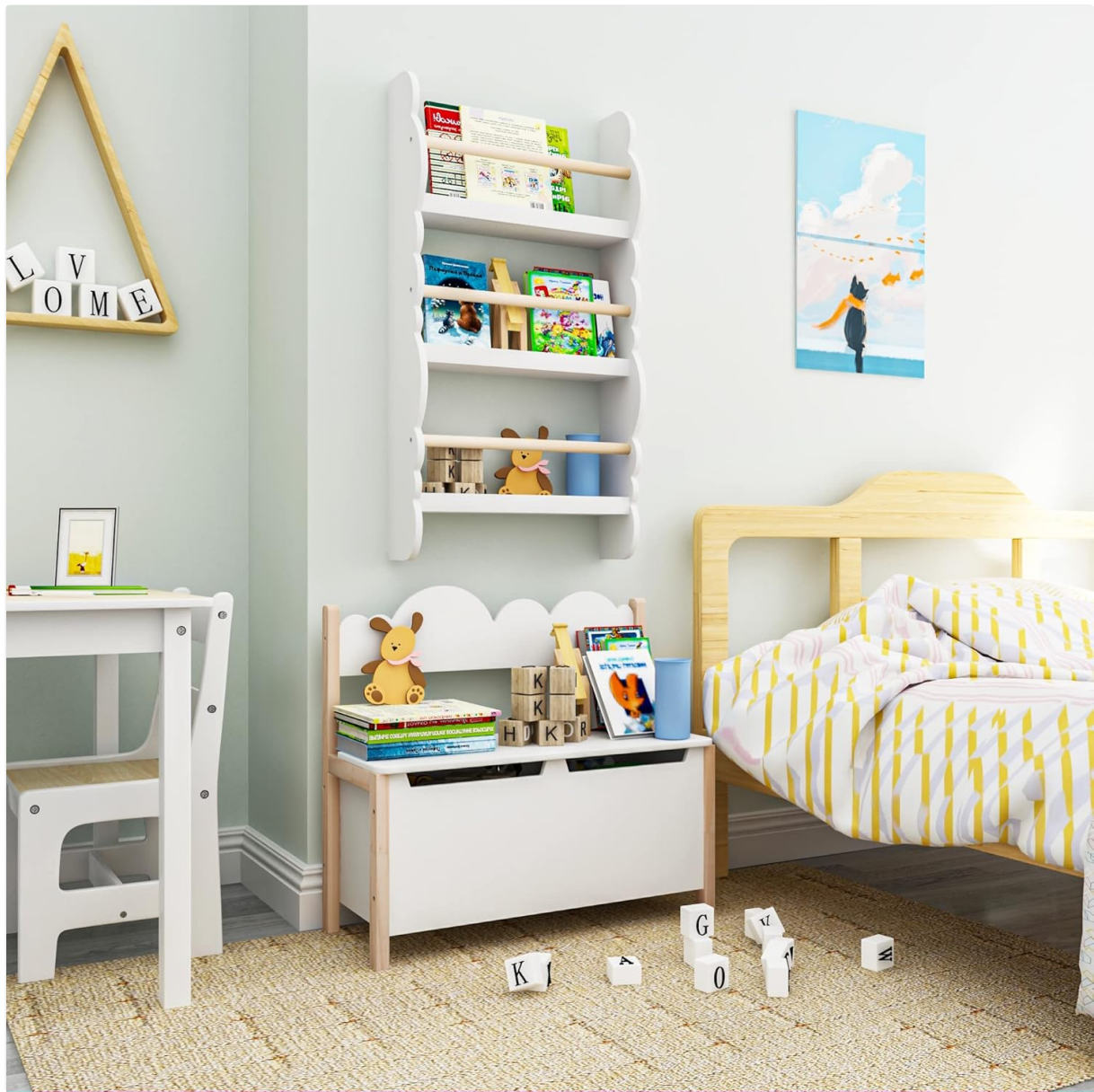
Image: The WOLTU Children's Bench placed in a child's bedroom, demonstrating its integration into a living space.