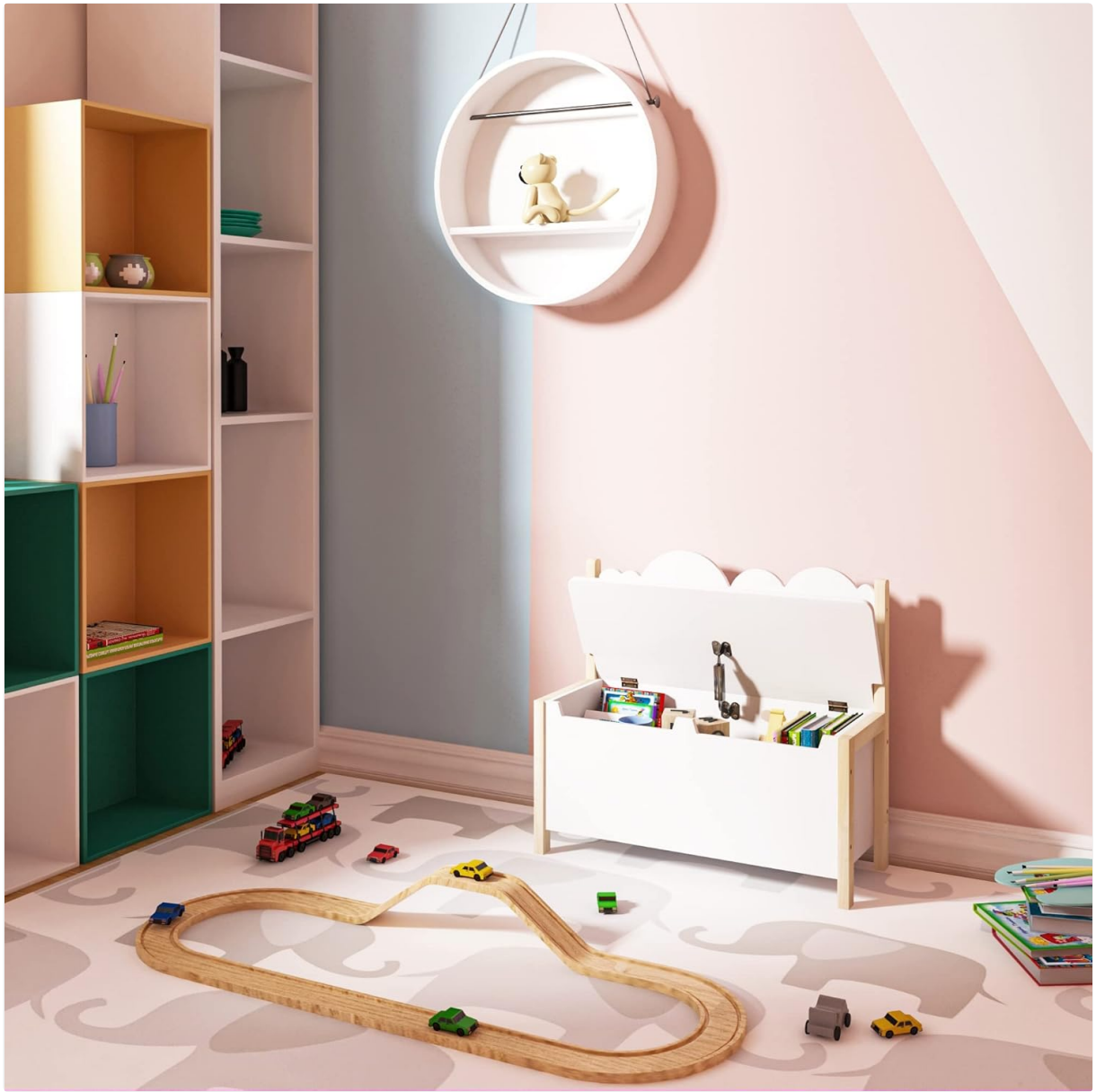
Image: The WOLTU Children's Bench with its lid open, revealing the storage space, situated in a child's playroom.