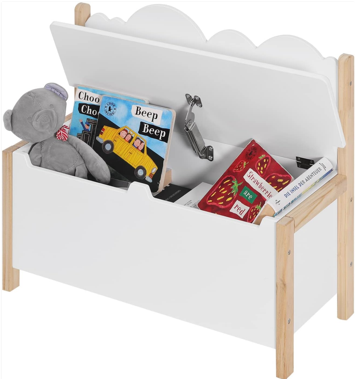
Image: The WOLTU Children's Bench with its lid open, showing various toys and books stored inside.