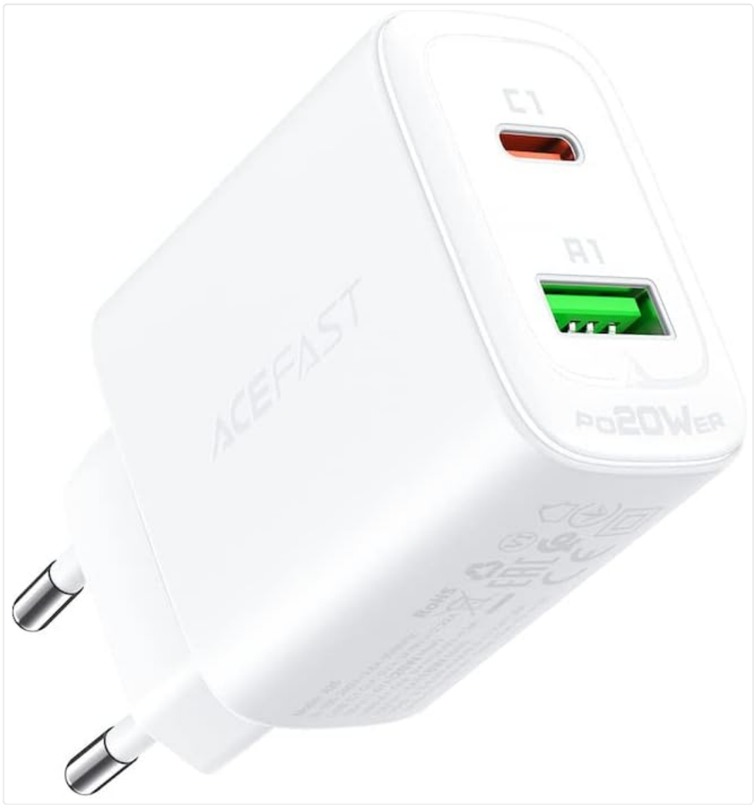
Figure 1: ACEFAST A25 Dual Port Fast Charger, front view showing USB-C and USB-A ports.