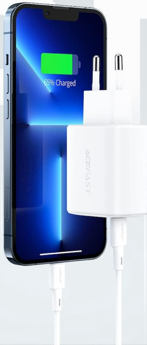
Figure 2: ACEFAST A25 charger providing PD20W fast charge to an iPhone, illustrating quick charging capability.