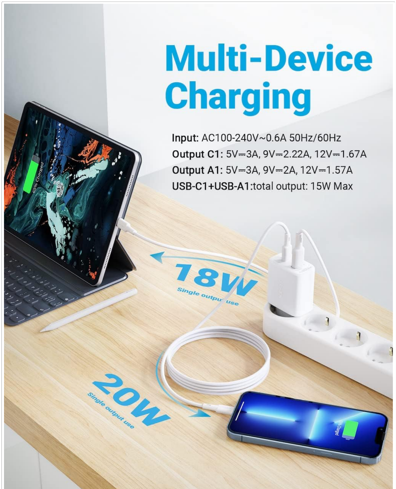
Figure 4: Visual guide displaying various compatible devices including iPhone, iPad, Samsung Galaxy, and AirPods, highlighting multi-device charging.