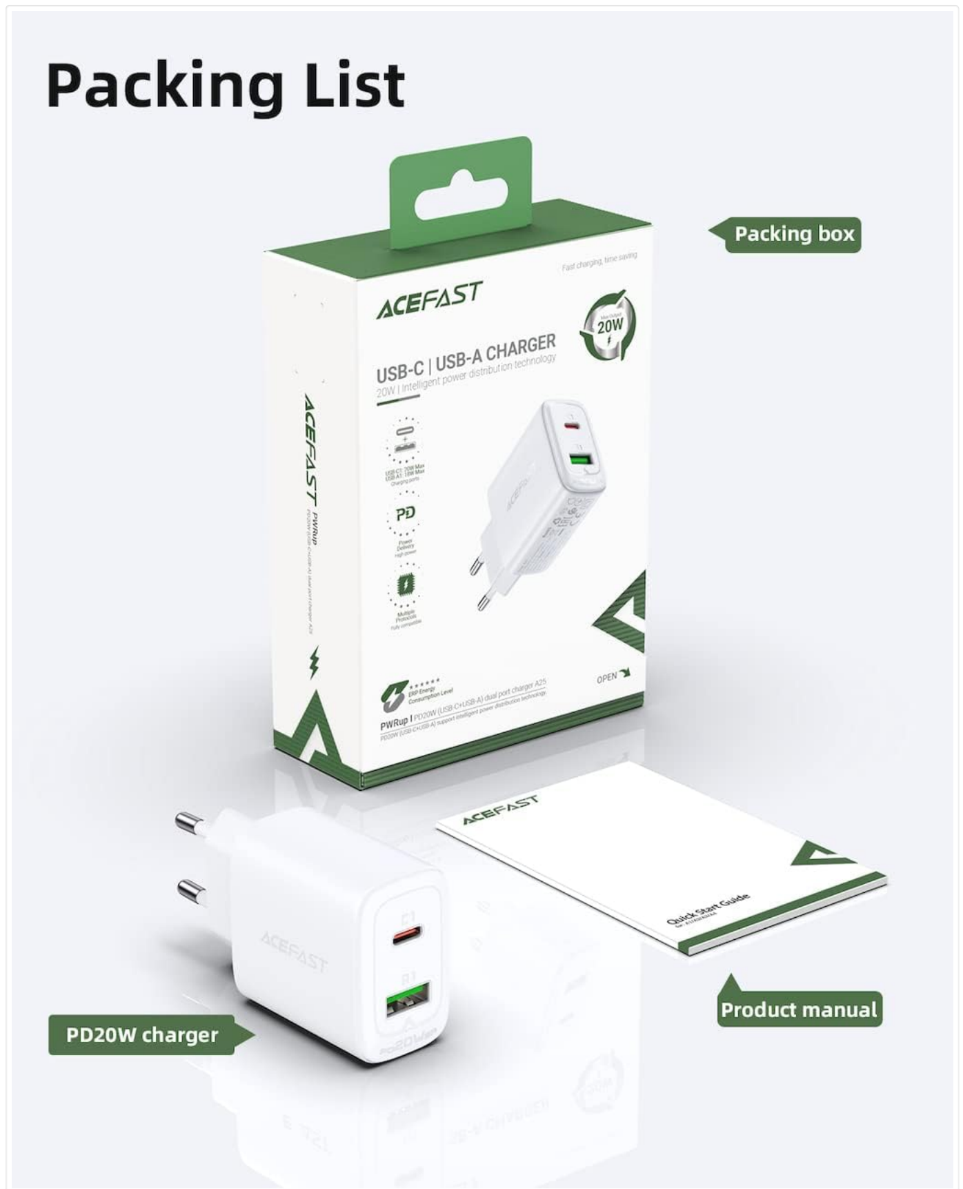
Figure 5: Image showing the ACEFAST A25 charger, its packaging box, and the included quick start guide/product manual, detailing package contents.