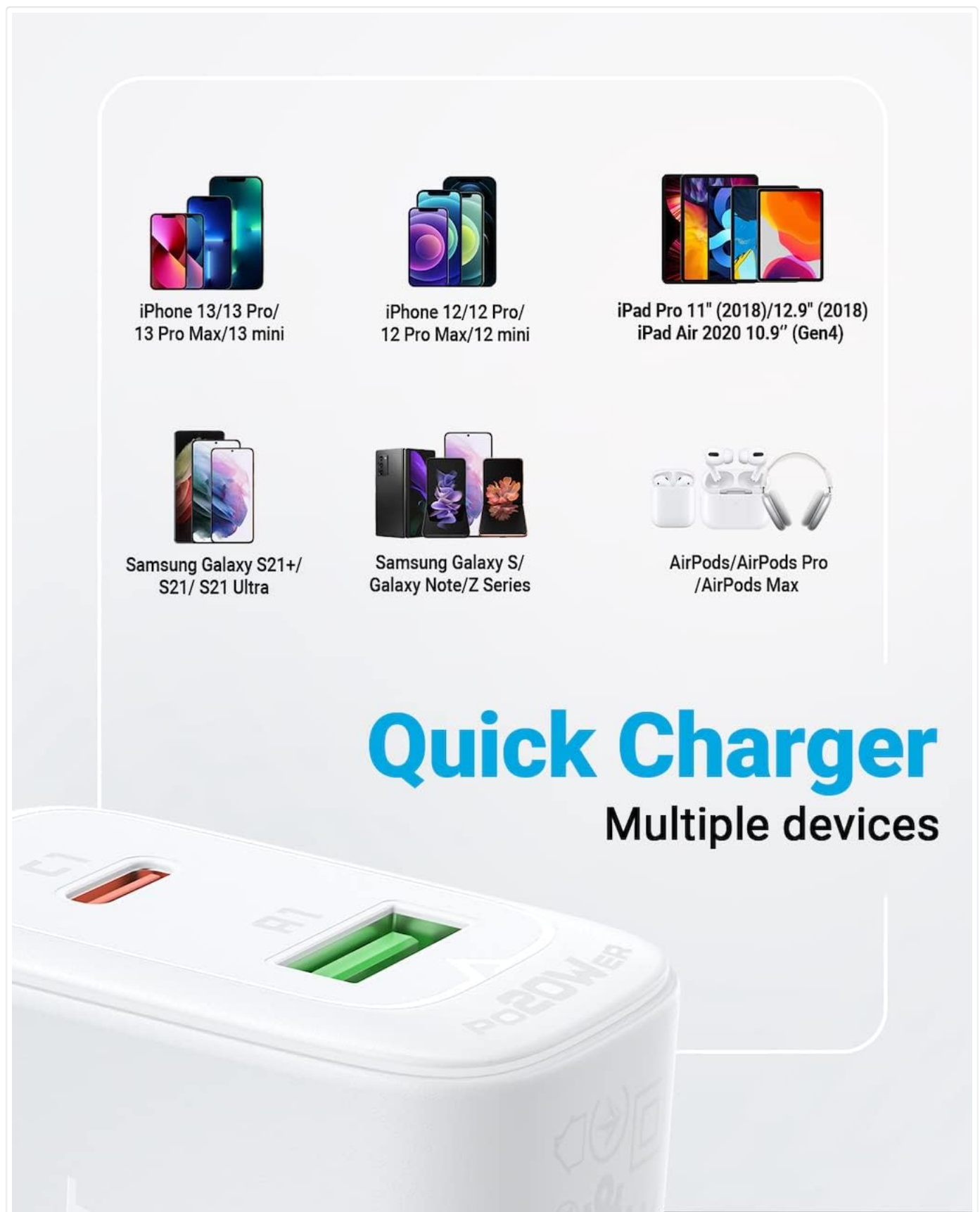
Figure 3: The ACEFAST A25 charger simultaneously charging an iPad and an iPhone, demonstrating its dual-port functionality and power distribution.