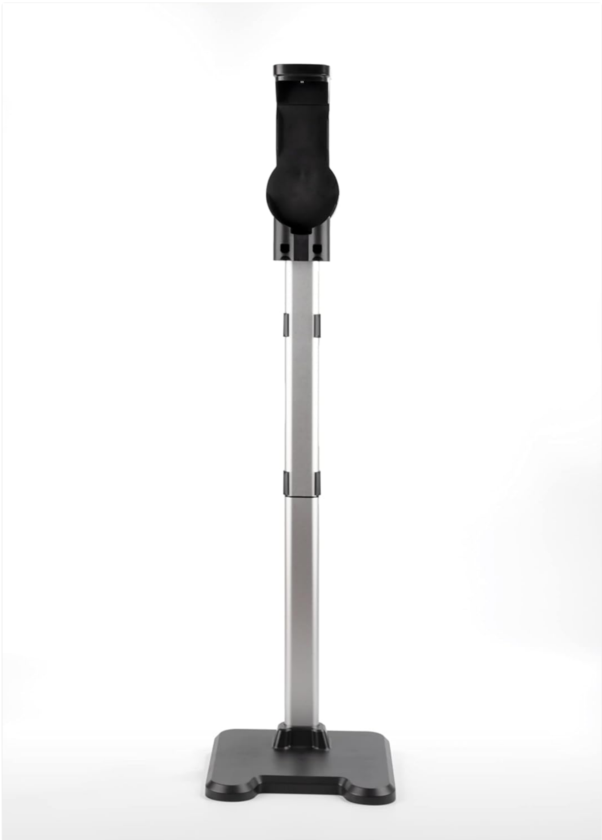
Image: Components of the Elicto ES-800 Vacuum Stand, showing the base, pole, and docking bracket.