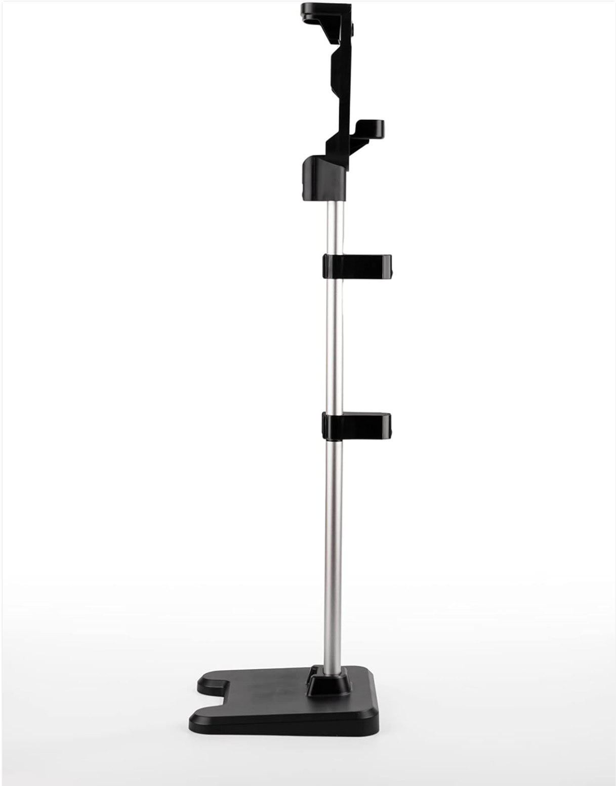
Image: Side view of the assembled Elicto ES-800 Vacuum Stand, ready for use.