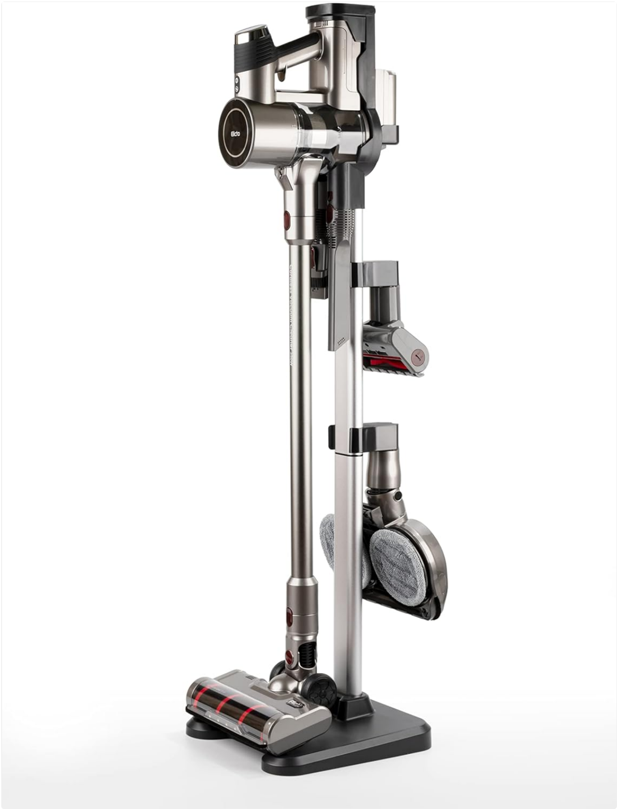
Image: The Elicto ES-800 Cordless Vacuum with its various attachments, neatly organized on the Elicto ES-800 Vacuum Stand.