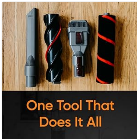
Image: The Elicto ES-800 Vacuum Stand with various vacuum accessories neatly stored on its holders.