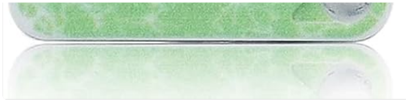
Figure 1: Front view of the MP3 Player, showing the control buttons and screen.