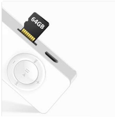
Figure 4: Correct insertion of a MicroSD card.