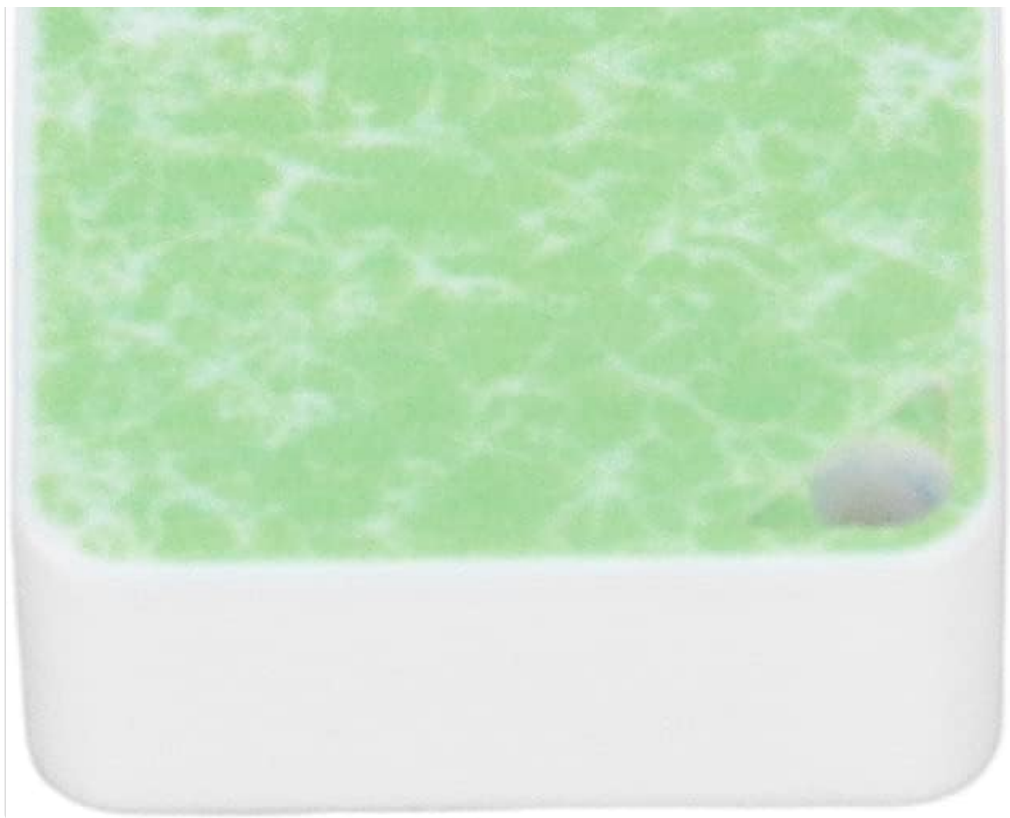
Figure 3: Back view of the MP3 Player, showing the built-in speaker and clip.