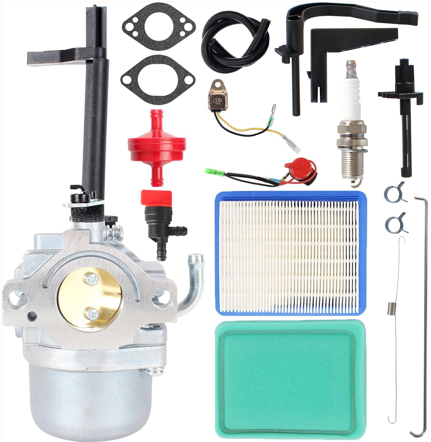
Image: Complete Pro Chaser Carburetor kit, showing the carburetor unit, two gaskets, a fuel filter, a spark plug, a fuel hose, two clamps, an insulator, a safety switch (low oil alert), a shut-off valve, an air filter, and an accessory kit.