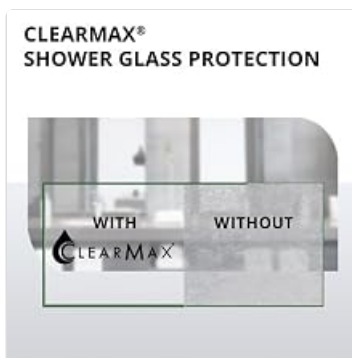
Image 6.1: ClearMax shower glass protection helps reduce water spots and makes cleaning easier.