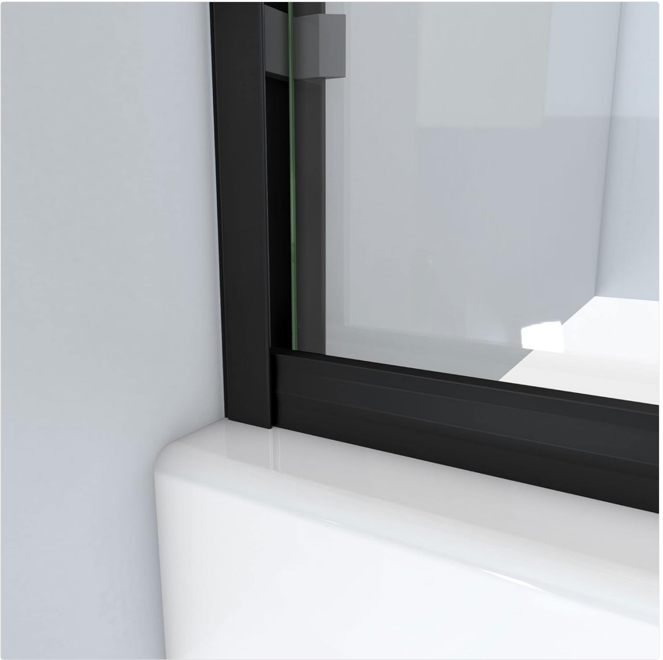
Image 4.2: The bottom track with aluminum water guards for out-of-plumb adjustment.