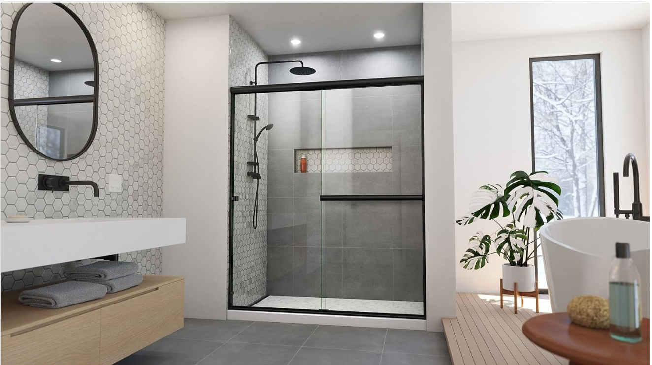
Image 1.1: The DreamLine Alliance Pro BGX shower door in a contemporary bathroom setting.

This manual provides detailed instructions for the installation, operation, and maintenance of your DreamLine Alliance Pro BGX Semi-Frameless Bypass Shower Door. Please read all instructions carefully before beginning installation and retain this manual for future reference. Proper installation and care will ensure the longevity and optimal performance of your shower door.