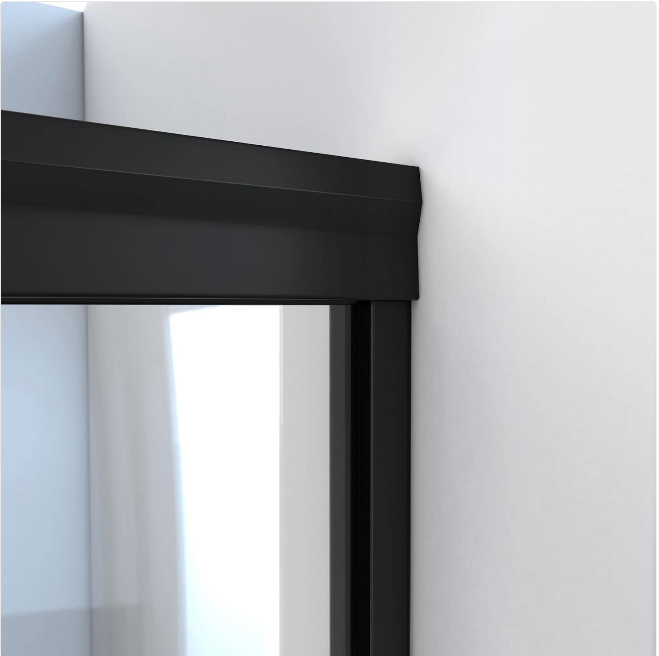
Image 4.1: Detail of the super sleek headrail, a key design feature.