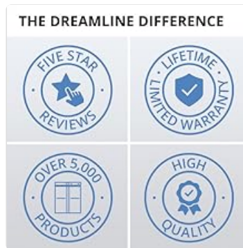
Image 9.1: The DreamLine Difference highlights product quality and support.

DreamLine products are backed by a manufacturer's warranty. For specific warranty details, registration, or to obtain technical support, please refer to the warranty card included with your product or visit the official DreamLine website. For any inquiries or assistance, contact DreamLine customer service.