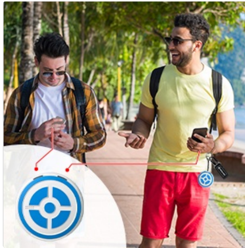
Image 2.1: Visual guide for connecting the DuoMon 2ID to the Pokémon Go application via Bluetooth.