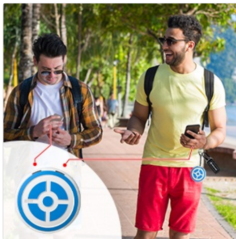
Image 6.1: If connection issues occur, clear existing Bluetooth pairings and reconnect the DuoMon 2ID.