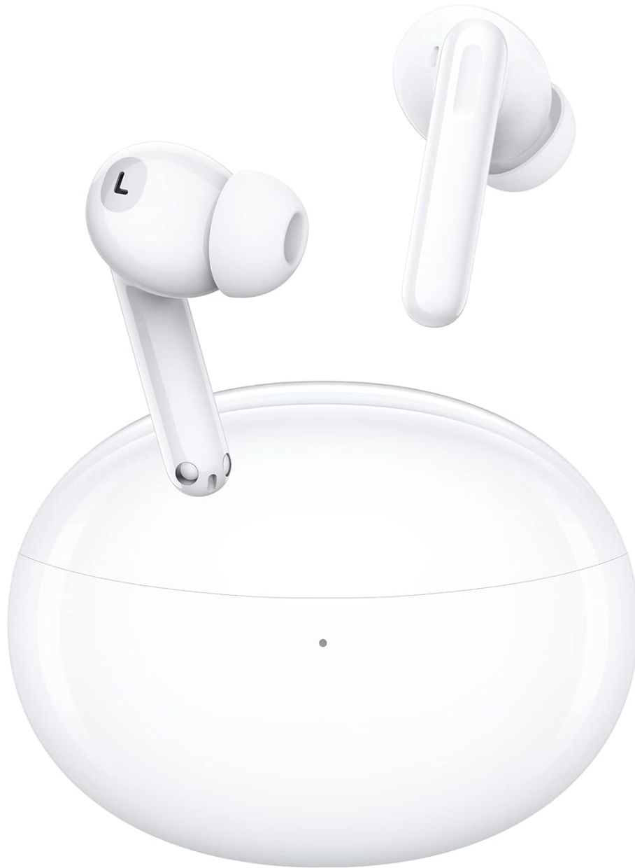
The OPPO Enco Air 2 Pro earbuds and their charging case.