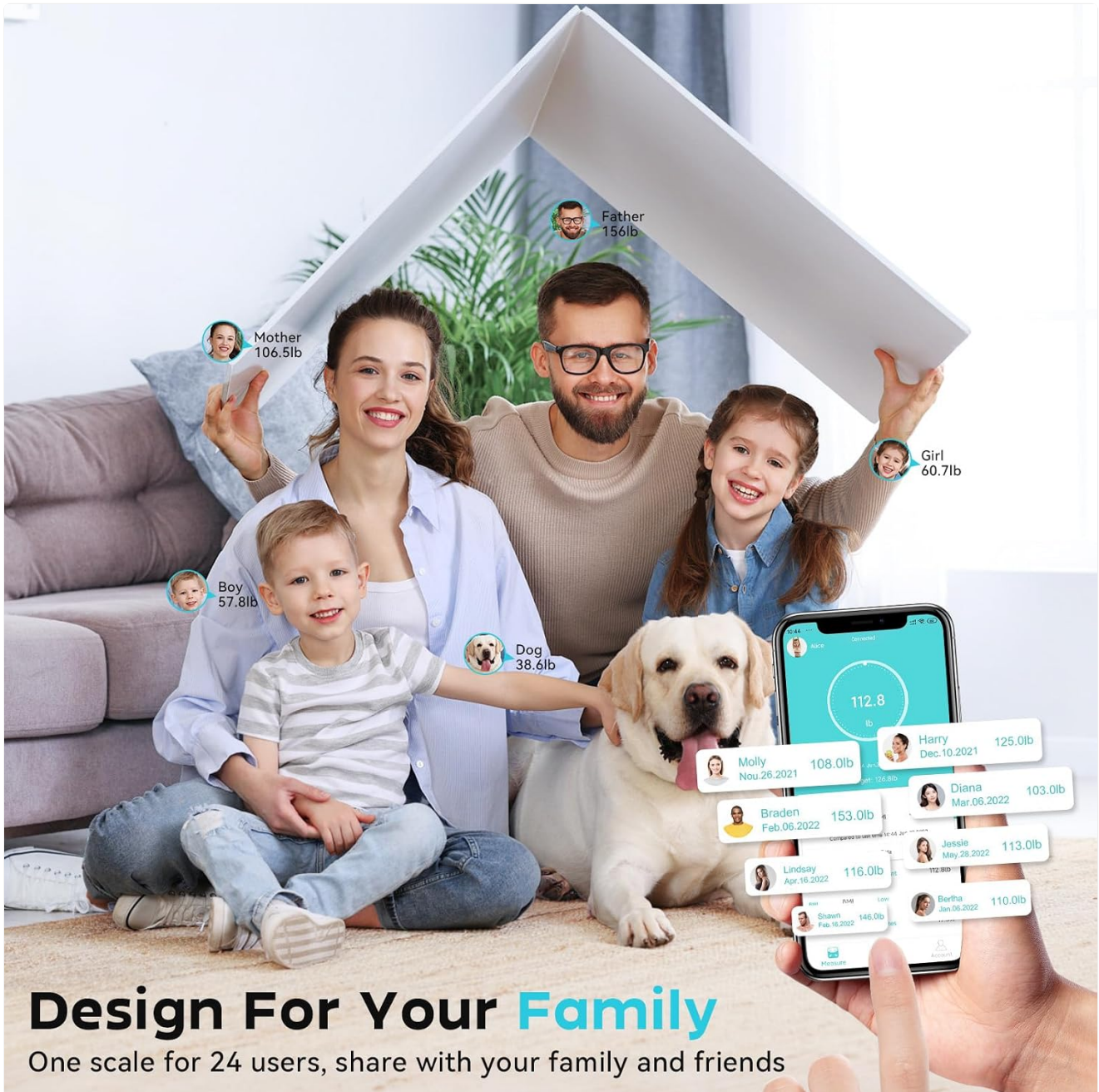
Image: The 'Fitdays' app supporting multiple user profiles for family and friends.