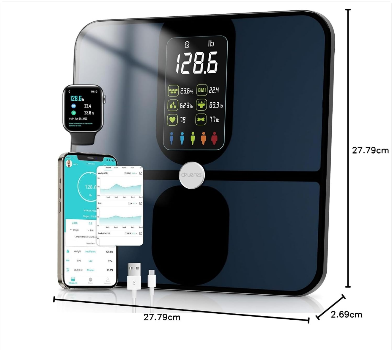
Image: Diagram illustrating the physical dimensions of the CHWARES CH310B scale.