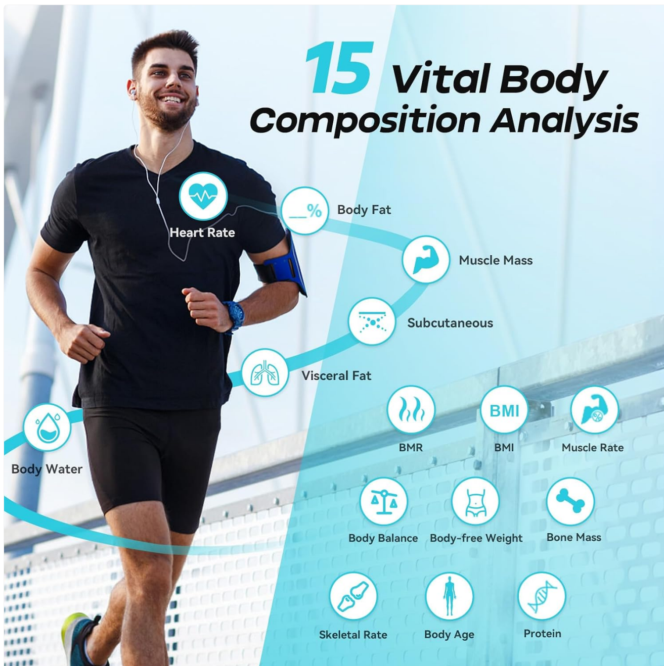
Image: An infographic detailing the 15 body composition metrics measured by the scale.