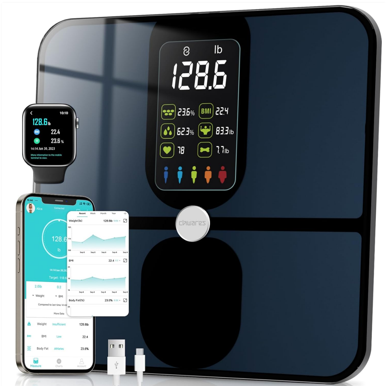
Image: The CHWARES CH310B Smart Digital Bathroom Scale displaying various body metrics, alongside a smartwatch and smartphone showing the connected app.