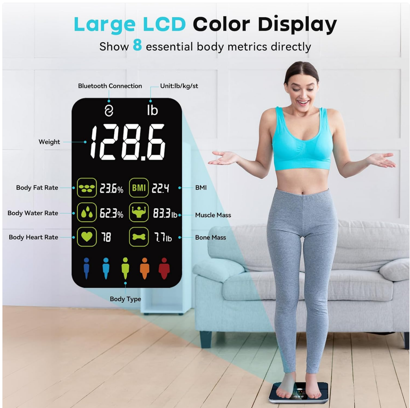
Image: The scale's large LCD color display indicating various body metrics and a person demonstrating its use.

The CHWARES CH310B scale features a large LCD display and high-precision sensors for comprehensive body analysis. It measures 15 vital body composition metrics.