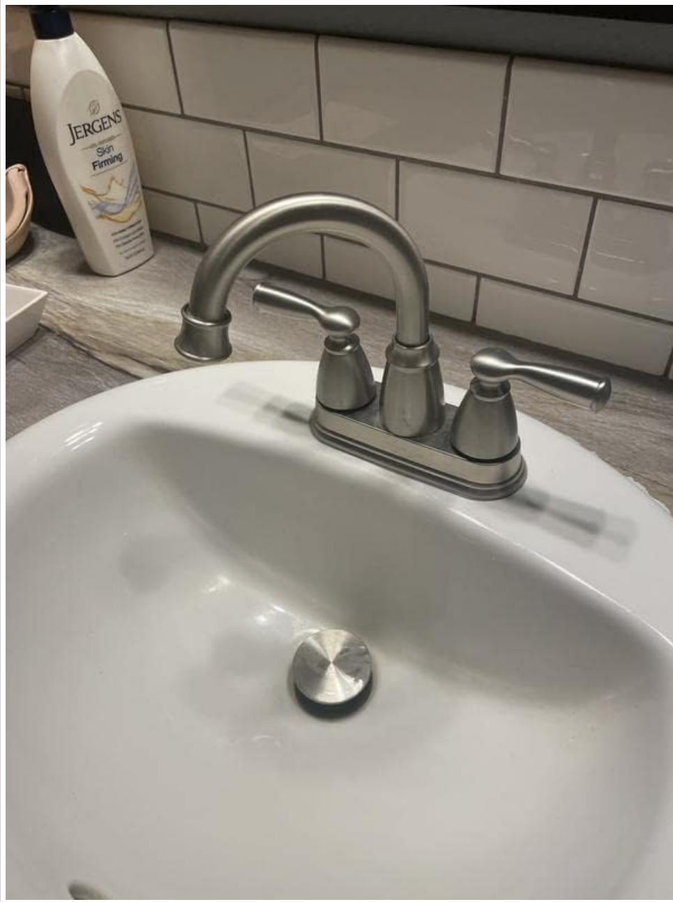
Image 3: A detailed view of the faucet's two handles and high arc spout, illustrating the user interface for water control.