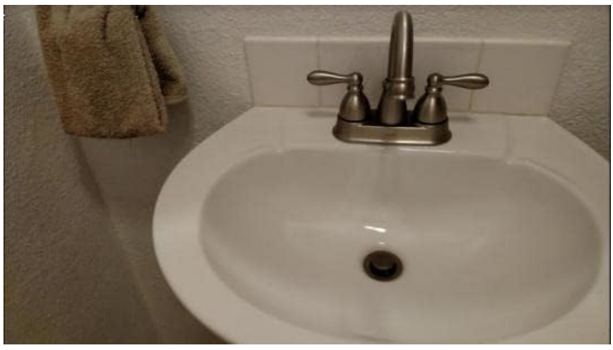
Image 4: The faucet in a bathroom setting, highlighting how regular cleaning helps maintain its appearance against various backsplashes.