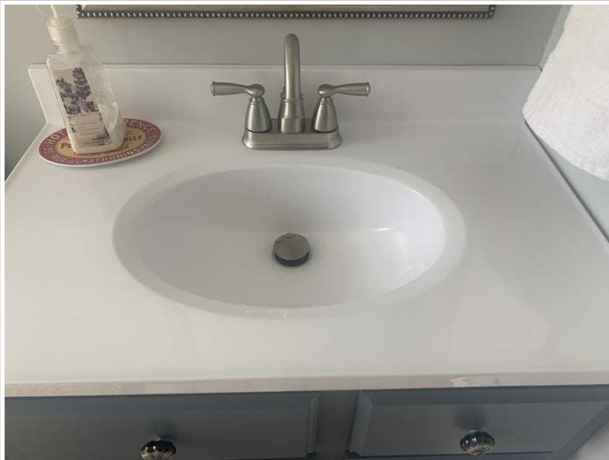
Image 2: The Moen Banbury faucet seamlessly integrated into a modern bathroom vanity setup, demonstrating its deck mount installation.