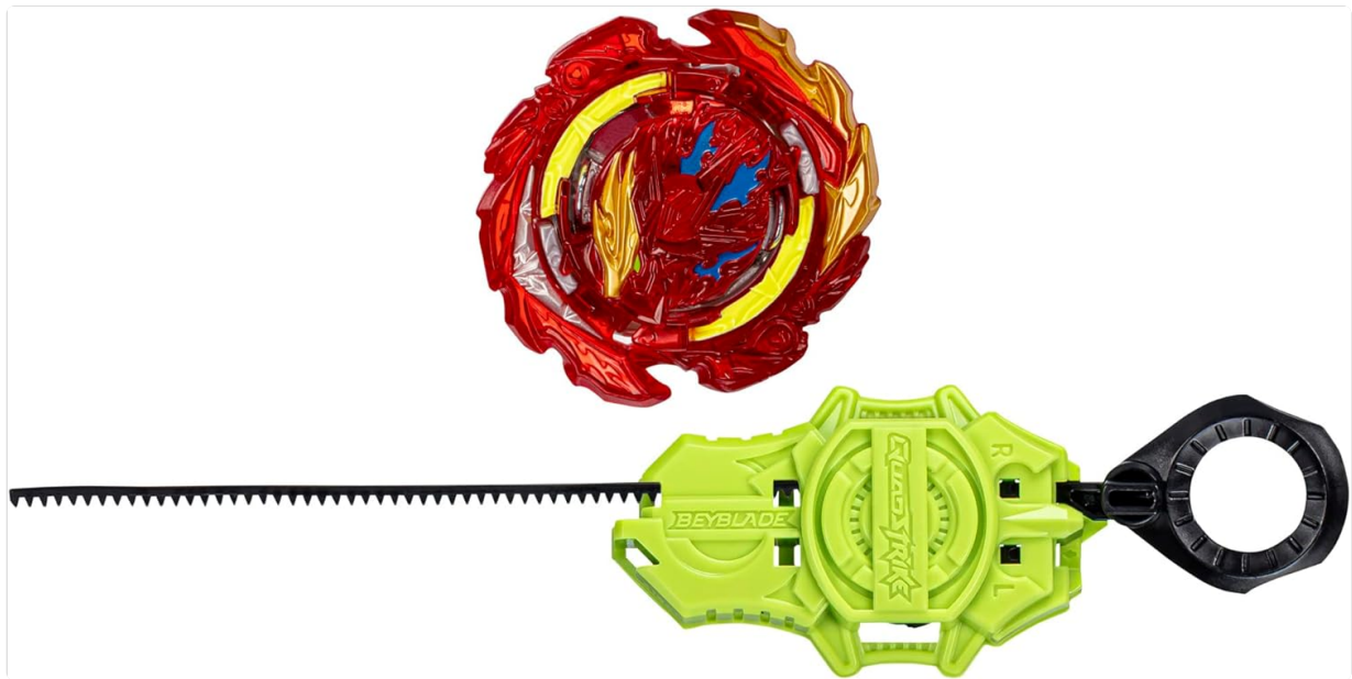
Image: The Stellar Hyperion H8 spinning top (red and gold) and the green QuadStrike launcher, ready for assembly.