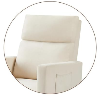
High Back Support