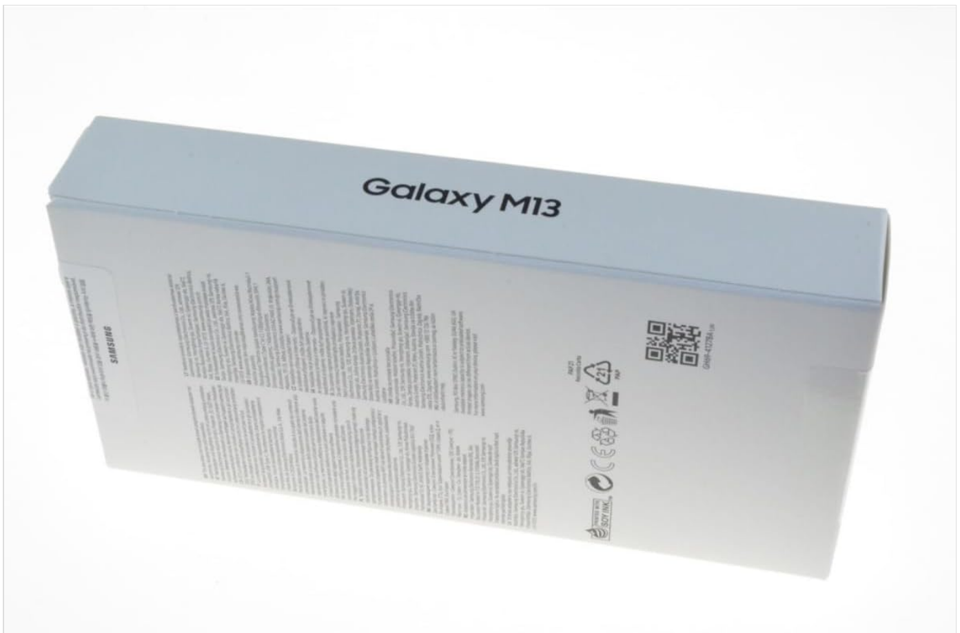
Image: Back view of the Samsung Galaxy M13 retail box, displaying product information and barcodes.