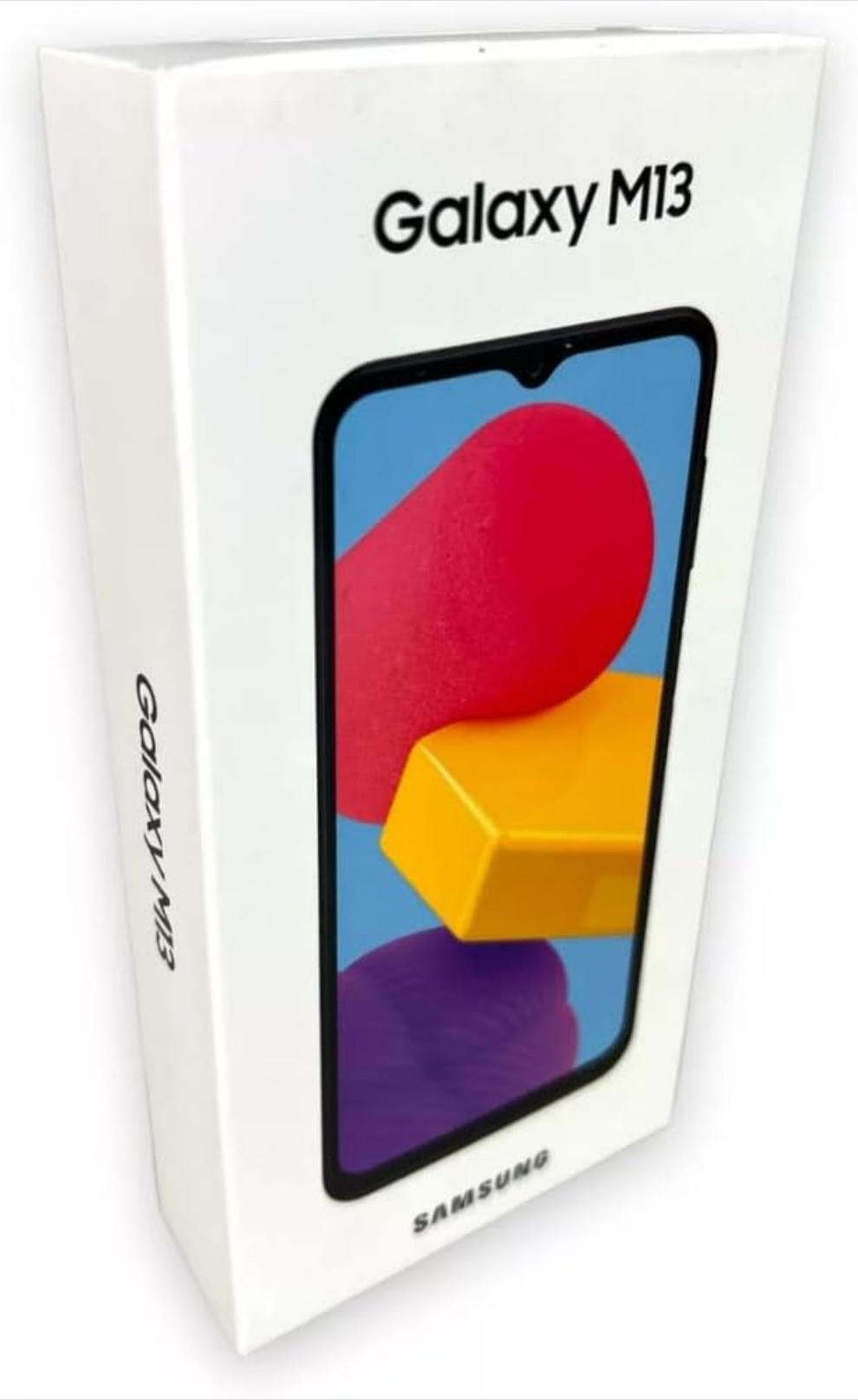
Image: Front view of the Samsung Galaxy M13 retail box, showing the phone's display.