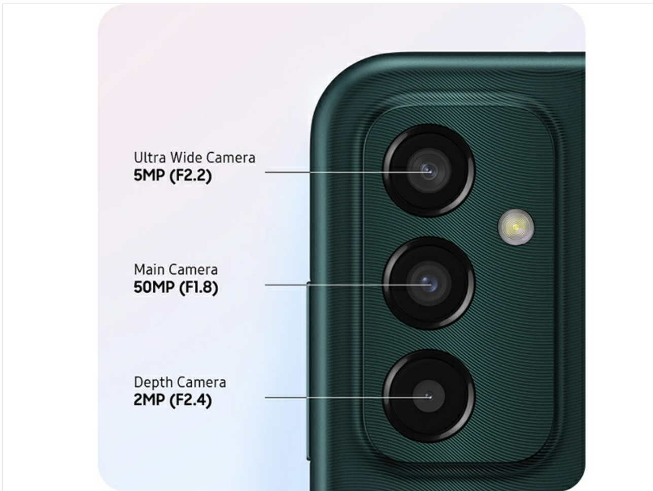
Image: Close-up view of the Samsung Galaxy M13's triple camera system on the rear, detailing the lenses.