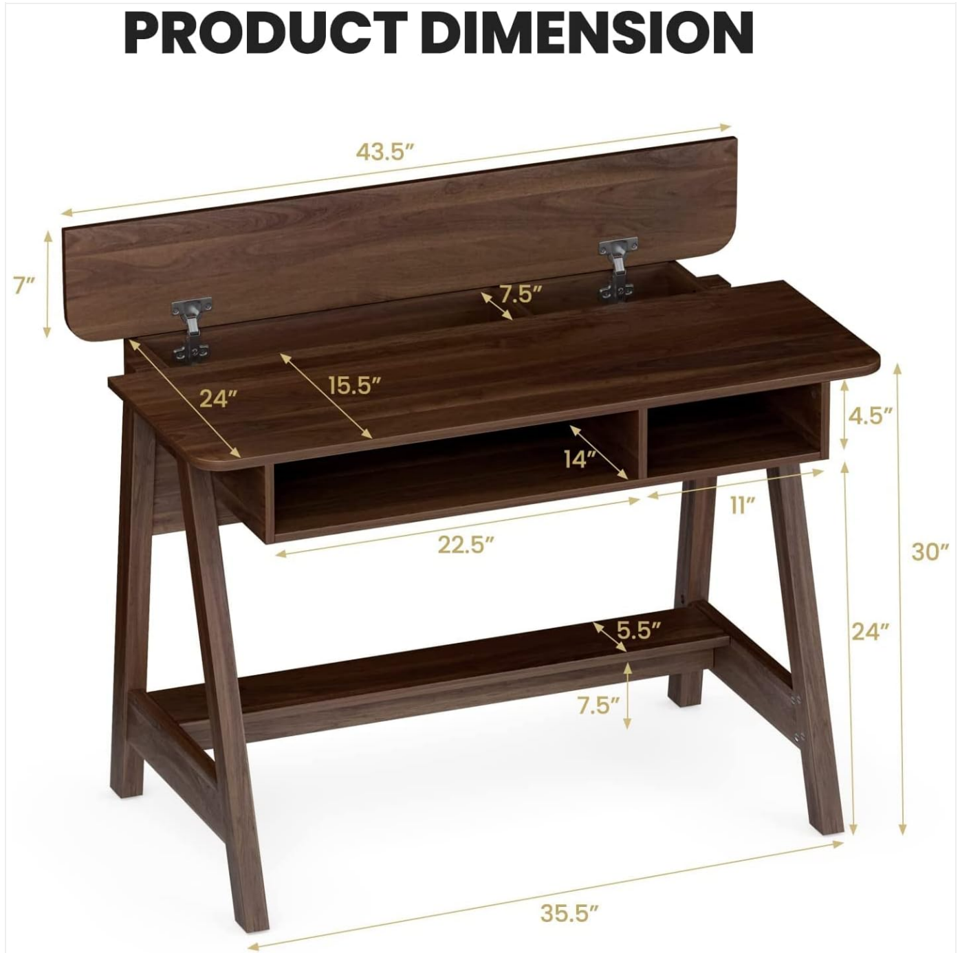
Figure 2.1: Product dimensions, useful for planning your space before assembly.