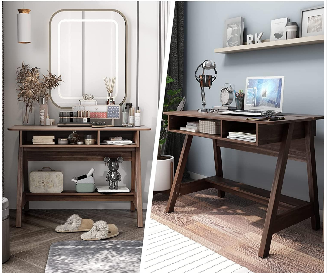
Figure 3.1: The desk's versatility as both a vanity table and a writing desk.

Can be used as writing desk and vanity table as required