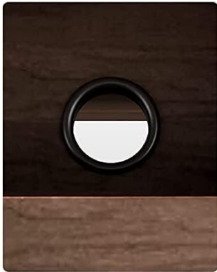
Cable Management Hole