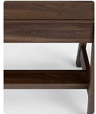
Sturdy Horizontal Bar