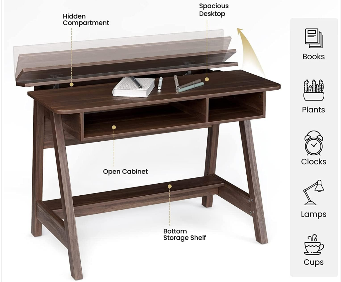
Figure 3.2: Overview of the desk's large storage capacity and various compartments.

Keep all supplies neat and well-organized