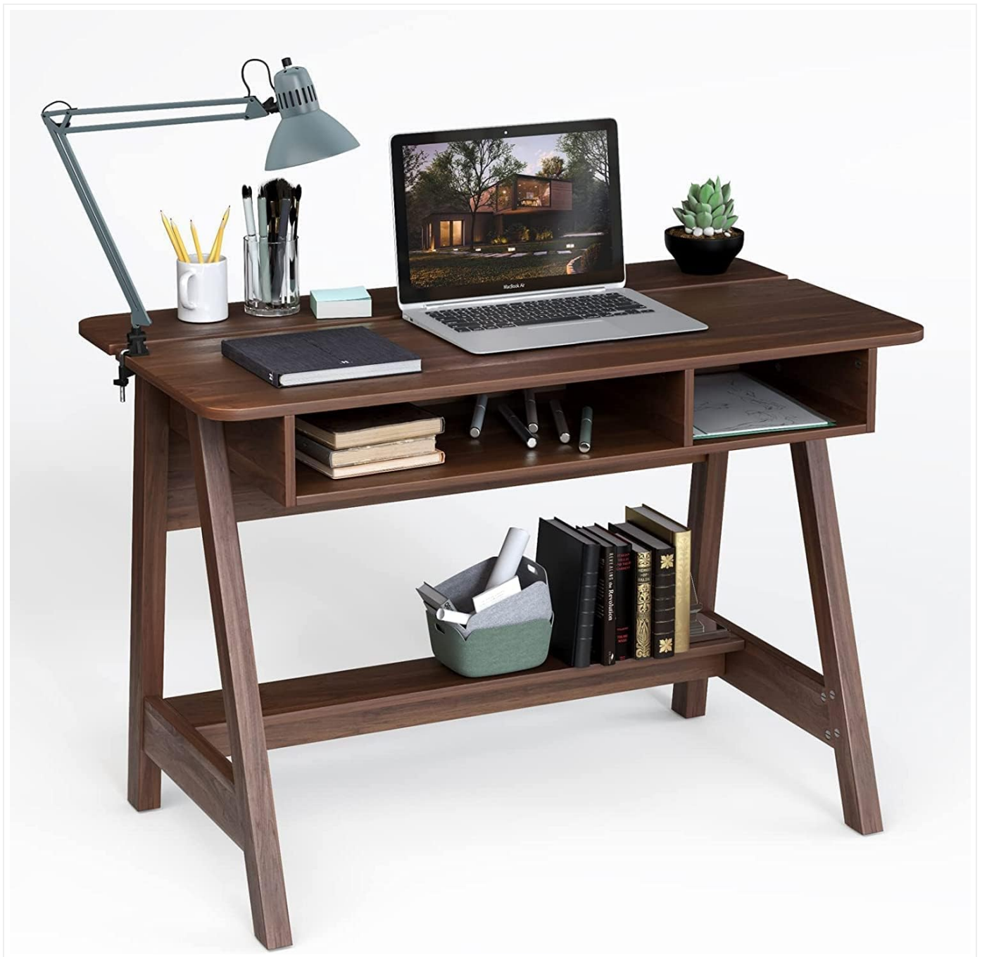
Figure 1.1: The Generic 43.5 Inch Laptop Home Office Desk, showcasing its design and functionality in a typical setup.