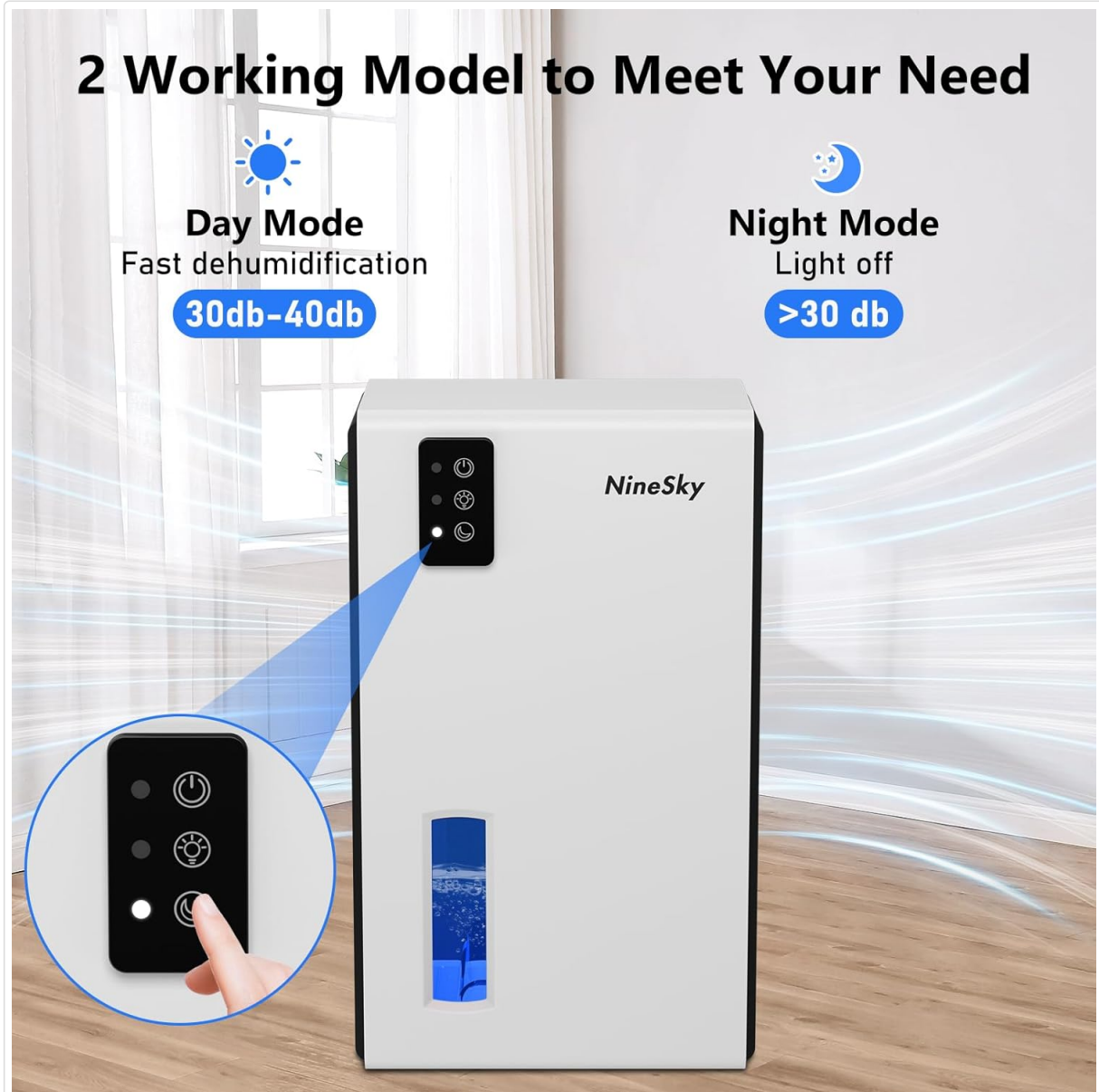
Figure 5.1: The control panel of the NineSky Dehumidifier, illustrating the two working modes: Day Mode for fast dehumidification (30-40dB) and Night Mode for quiet operation with lights off (<30dB).

The NineSky Dehumidifier offers two distinct working modes: