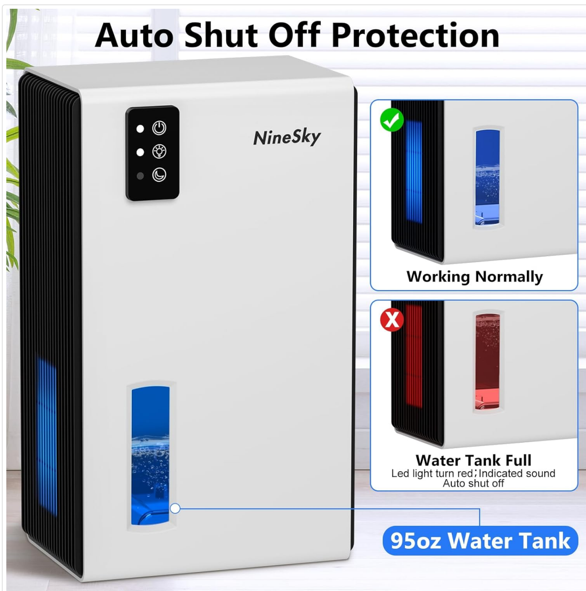
Figure 5.3: A visual representation of the auto shut-off protection. One image shows the dehumidifier working normally with a blue light in the water tank, while the other shows the tank full, indicated by a red light and automatic shutdown.