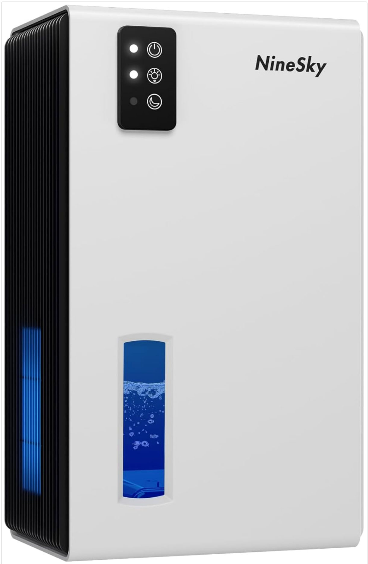
Figure 3.1: Front view of the NineSky Dehumidifier CT2, showcasing the minimalist control panel at the top and the transparent water tank window at the bottom, allowing visual monitoring of water levels.