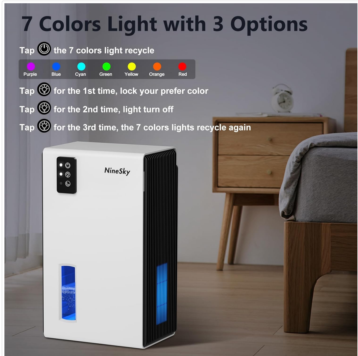
Figure 5.2: A close-up of the NineSky Dehumidifier's control panel, detailing the operation of the 7-color LED light feature. It shows how to cycle through colors, select a static color, or turn the light off.

The unit features a 7-color LED night light. Use the Light Button ( ) to control it: