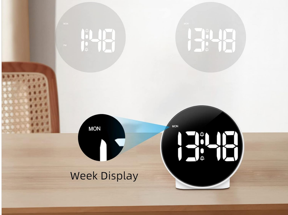
Image: The clock displaying time in 12-hour format (1:48 PM) and 24-hour format (13:48).

Week And Time Display On The Same Screen