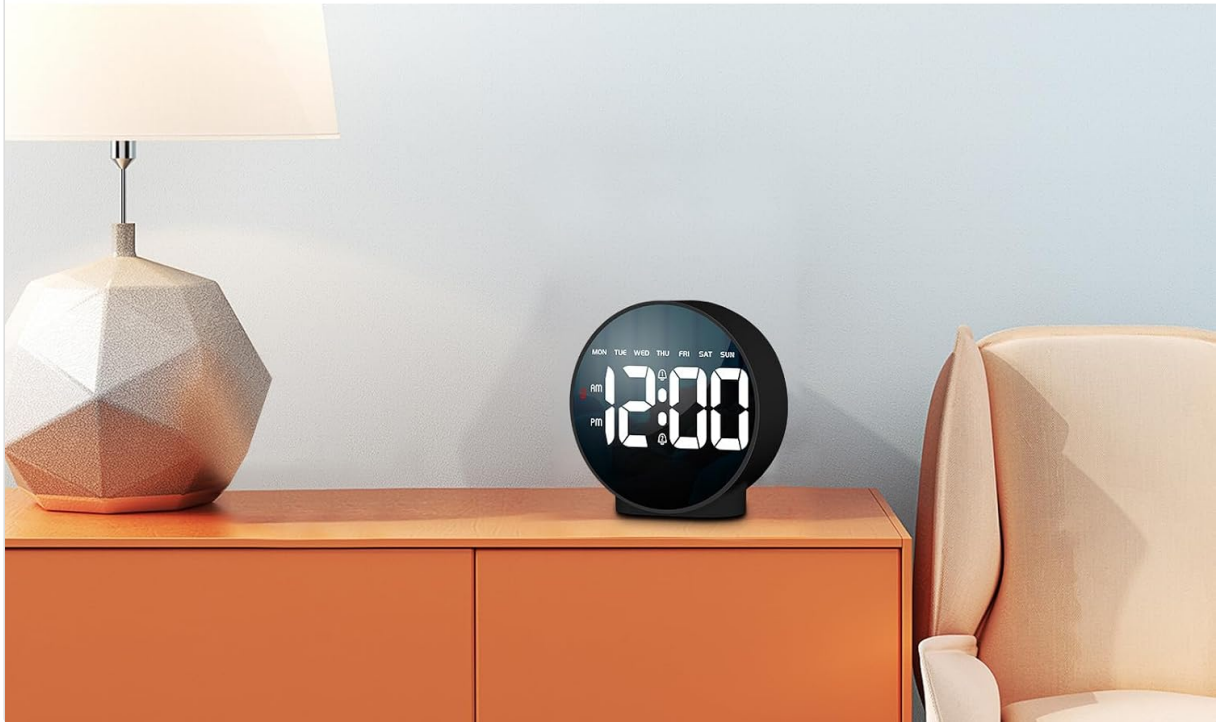
Image: Overview of the clock's multifunction capabilities, including 12/24H, Dual Alarm, LED Display, Week Display, Adjustable Brightness, 5 Minute Snooze, Alarm Date Setting, Corded Electric, and Battery Memory.