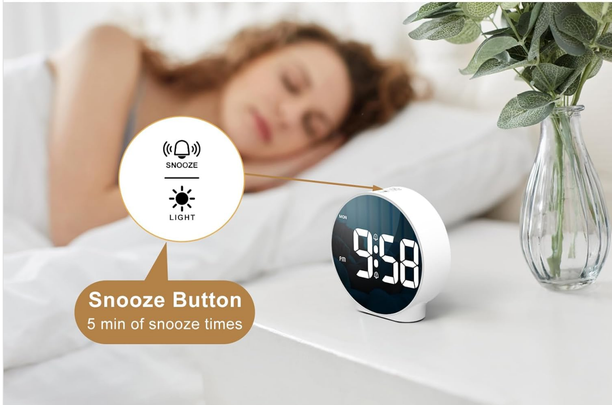
Image: The clock showing different brightness levels and an illustration of pressing the snooze button for a 5-minute snooze.