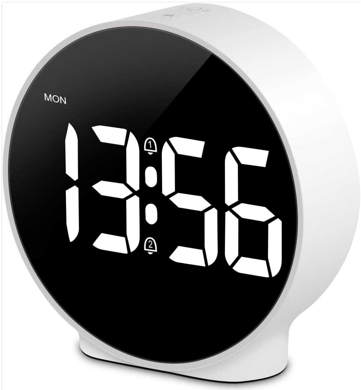
Image: Front view of the Deeyaple F-8816 Digital LED Alarm Clock, displaying the time and day of the week.