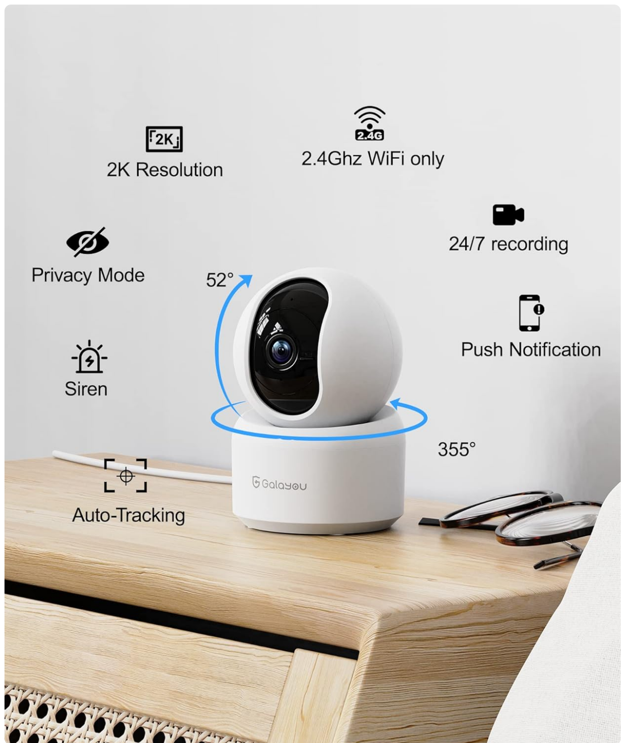
Figure 2: Camera placement and power connection for initial setup.