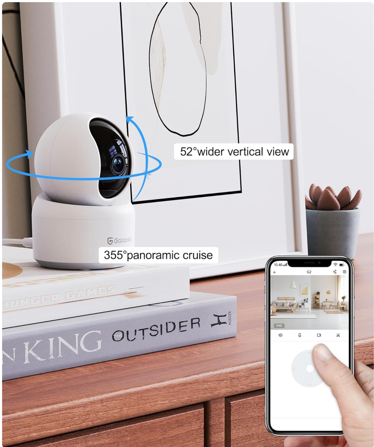
Figure 4: Remote pan and tilt control via the mobile app.