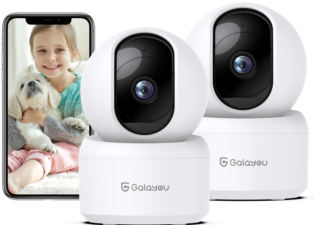
Figure 1: GALAYOU G2 Indoor Security Camera (2-Pack) and mobile app interface.

The GALAYOU Indoor Security Camera G2 provides advanced home monitoring with its 2K Super HD resolution and 360-degree coverage. Designed for indoor use, it offers comprehensive surveillance for babies, pets, elders, or general home security.