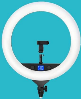
Ringleuchte inkl. Diffusor