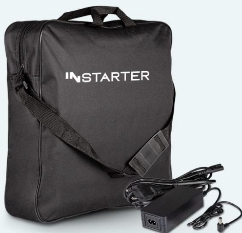
Tragetasche & Netzteil