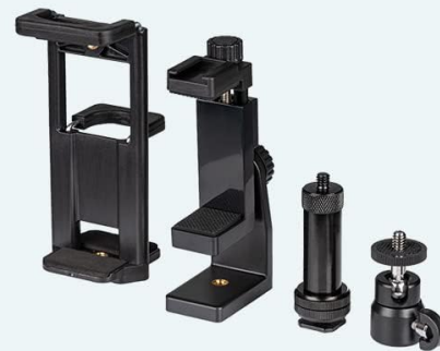
Smartphone- & Tablethalter, Kugelkopf