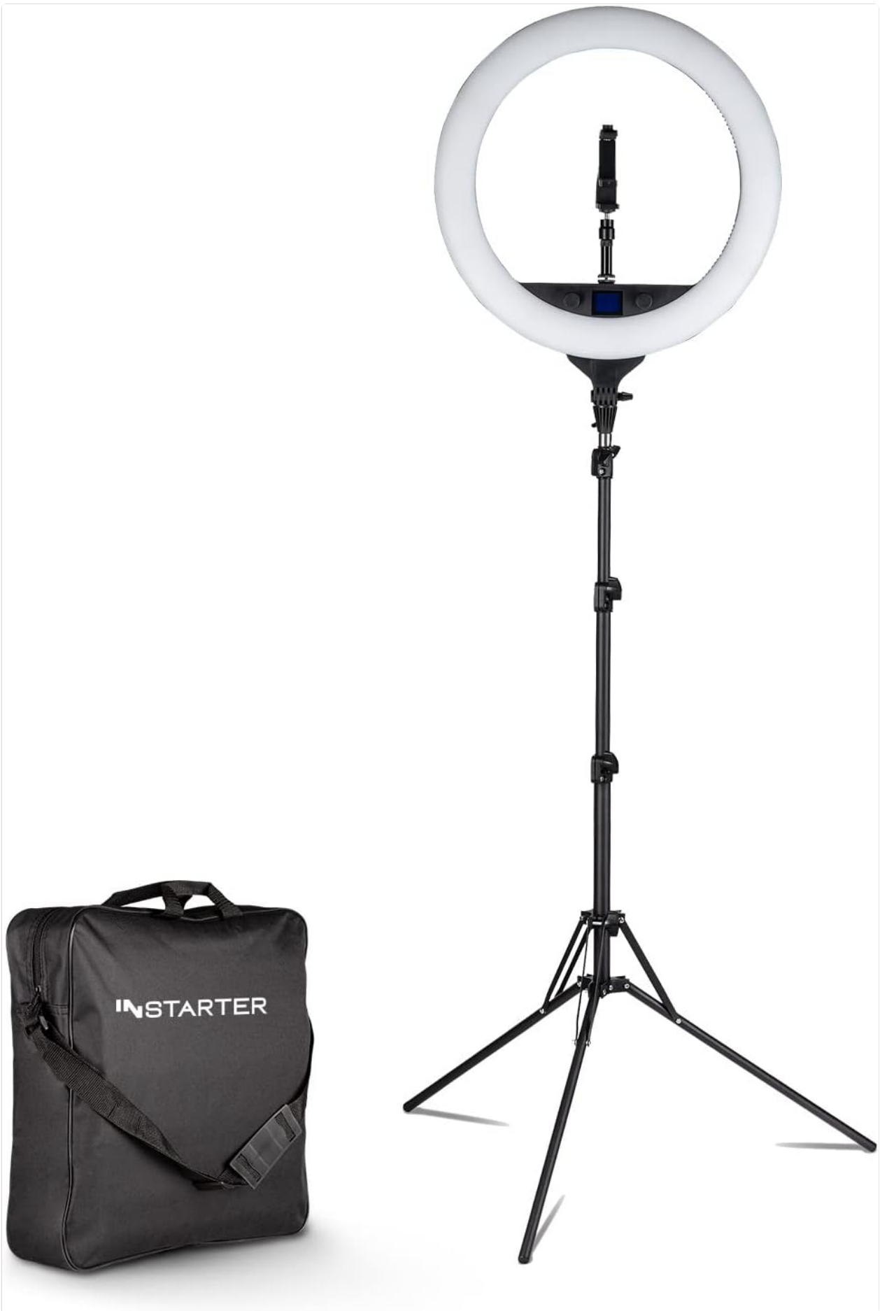
Image: The Instarter RGB Ring Light fully assembled on its tripod, ready for use.