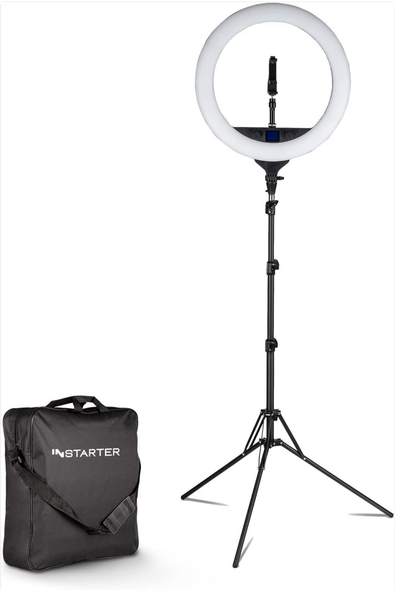
Image: Instarter RGB Ring Light 61W, tripod, and carrying bag.