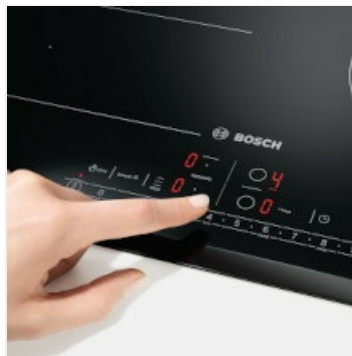
Image: A hand interacting with the TouchSelect control panel, demonstrating the ease of adjusting settings on the hob.

The hob features a TouchSelect control panel, allowing for easy and precise adjustment of cooking zones and power levels. Simply touch the desired cooking zone and then select the power level using the '+' and '-' touch controls.