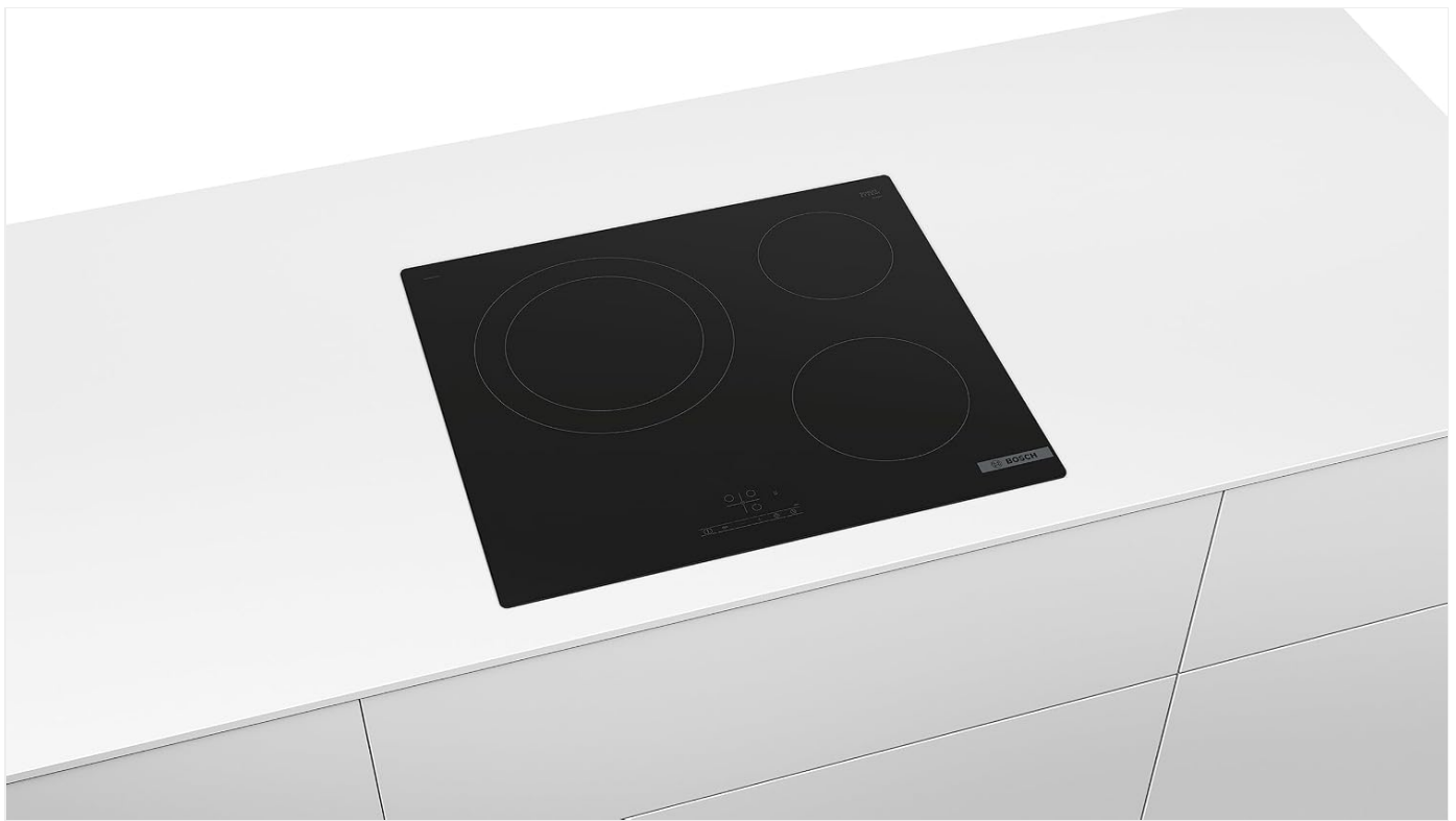
Image: The Bosch PKK611BB8E electric hob seamlessly integrated into a modern white kitchen countertop, showcasing its sleek design.