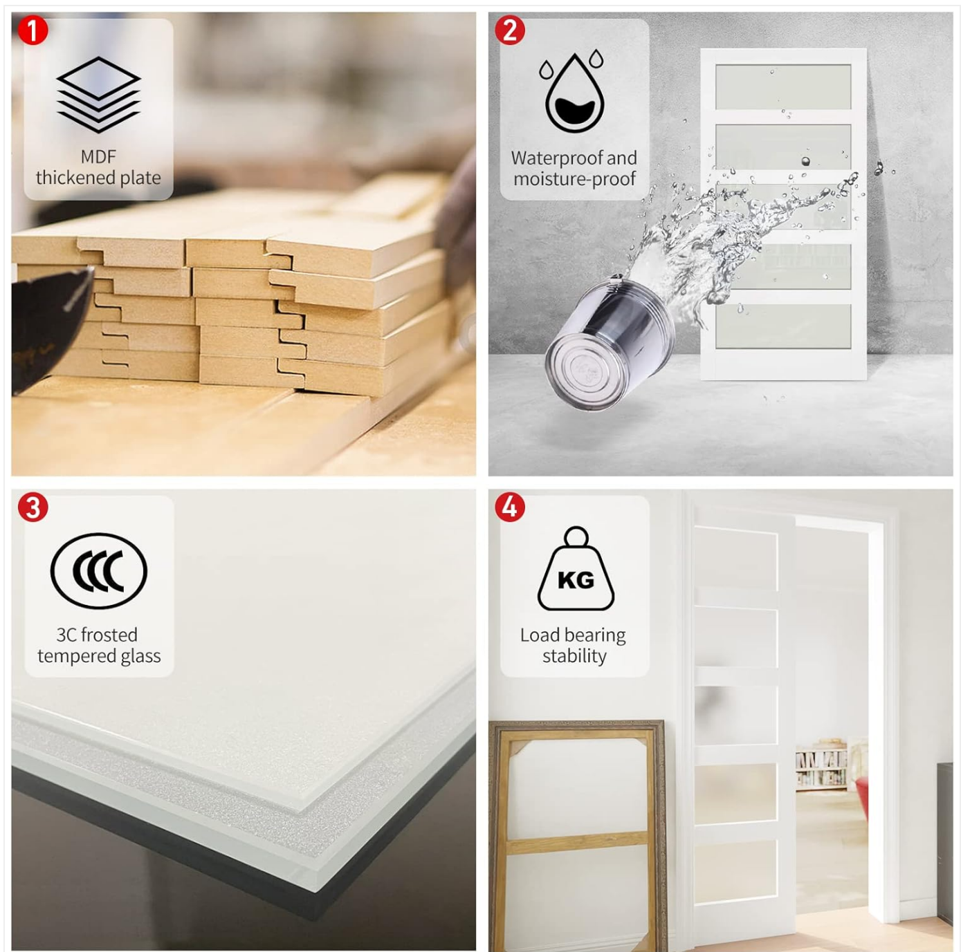
Image: Key features of the door panel, including MDF construction, water resistance, tempered frosted glass, and load-bearing stability.