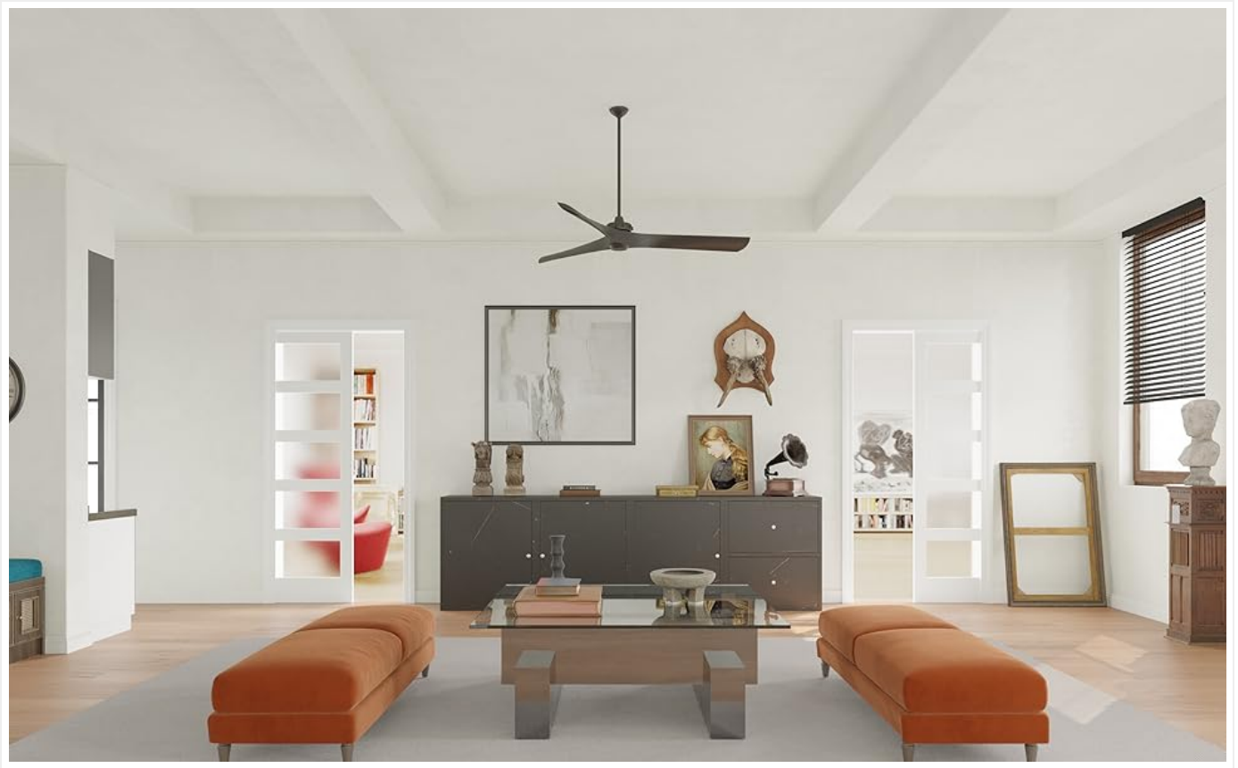
Image: Illustration of the space-saving benefit of a sliding pocket door.

The door panel is constructed from high-quality MDF (Medium-Density Fiberboard), known for its stability, resistance to warping, and smooth finish. The tempered frosted glass is durable and easy to clean.