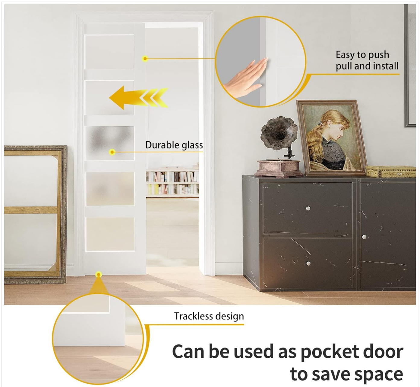
Image: SOLRIG sliding pocket door in a living room, highlighting its space-saving design and frosted glass.