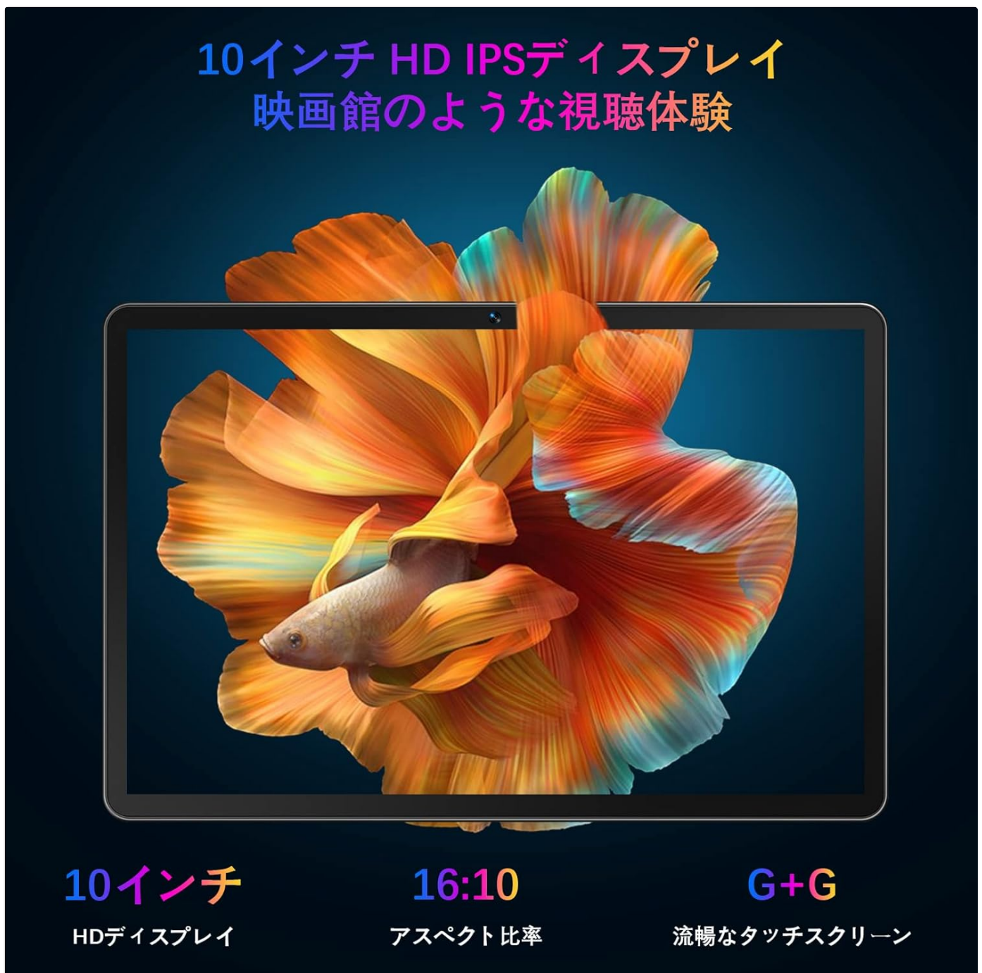
Image: The 10-inch HD IPS display of the MARVUE Pad M22, showcasing its 16:10 aspect ratio and smooth G+G touch screen for an