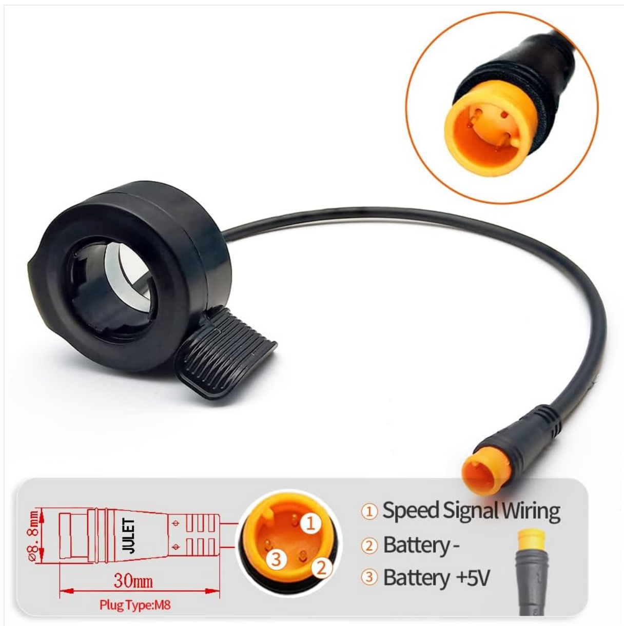
Image: The 130X Thumb Throttle with its waterproof connector and a detailed wiring diagram indicating the Speed Signal, Battery negative, and Battery +5V pins.