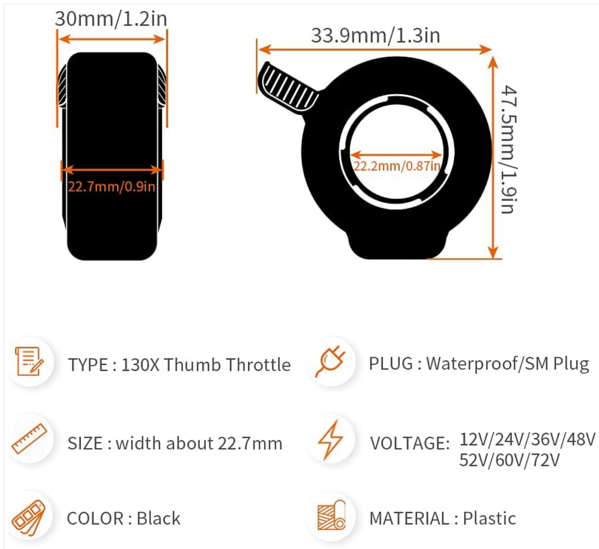
Image: Detailed dimensions of the 130X Thumb Throttle for precise fitment.