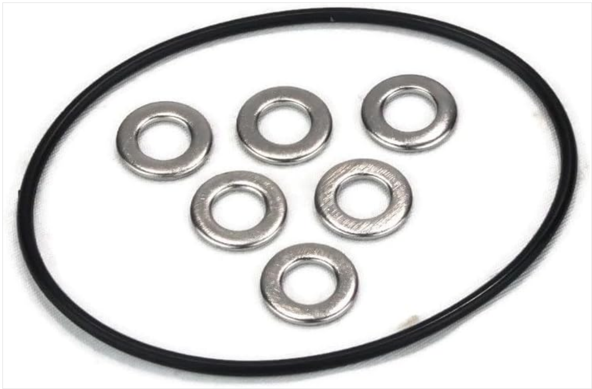
Figure 3.2: Close-up view of the included O-ring and six washers, essential for proper sealing and mounting.