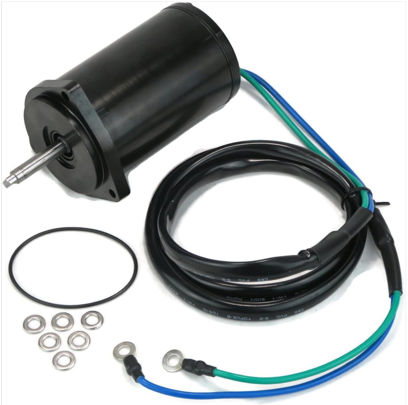
Figure 3.1: Complete Trim Tilt Motor Kit, including the motor, wiring, O-ring, and washers.