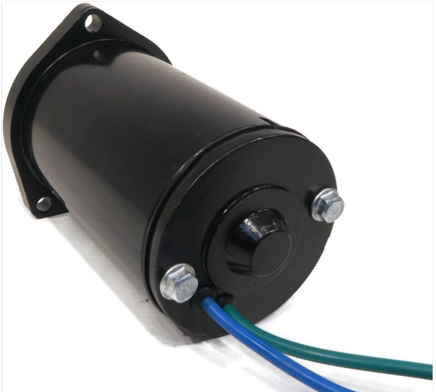
Figure 4.1: Side profile of the motor showing approximate dimensions of 5 \frac{13}{16} inches in length and 3 \frac{13}{16} inches in height.