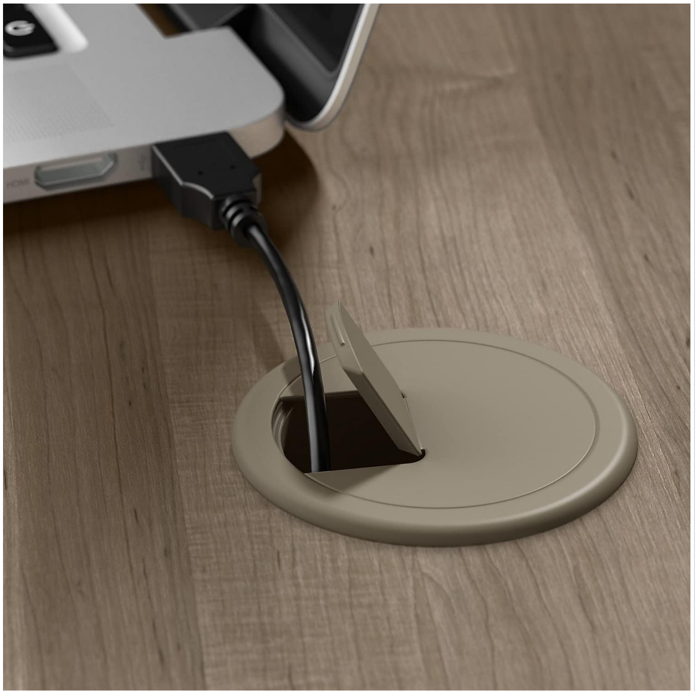
Image 4.2: A close-up view of the wire management grommet, designed to keep cables organized and out of sight.