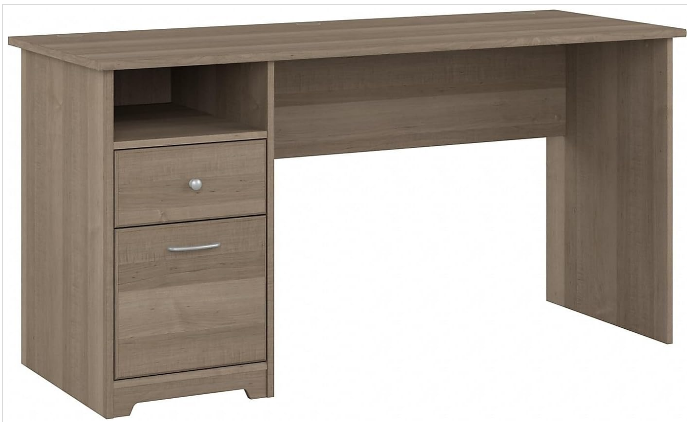
Image 1.1: The Bush Furniture Cabot 60W Computer Desk in Ash Gray, showcasing its design and features.

This manual provides comprehensive instructions for the assembly, operation, and maintenance of your Bush Furniture Cabot 60W Computer Desk with Drawers in Ash Gray. This desk is designed to offer a functional and stylish workstation for your home office, featuring a spacious desktop, integrated storage, and wire management solutions. Please read this manual thoroughly before beginning assembly or use to ensure proper setup and longevity of your product.