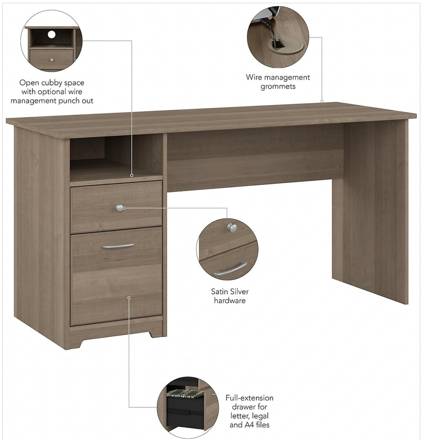
Image 4.1: Key features of the desk, including the open cubby space, wire management grommets, satin silver hardware, and the full-extension file drawer.