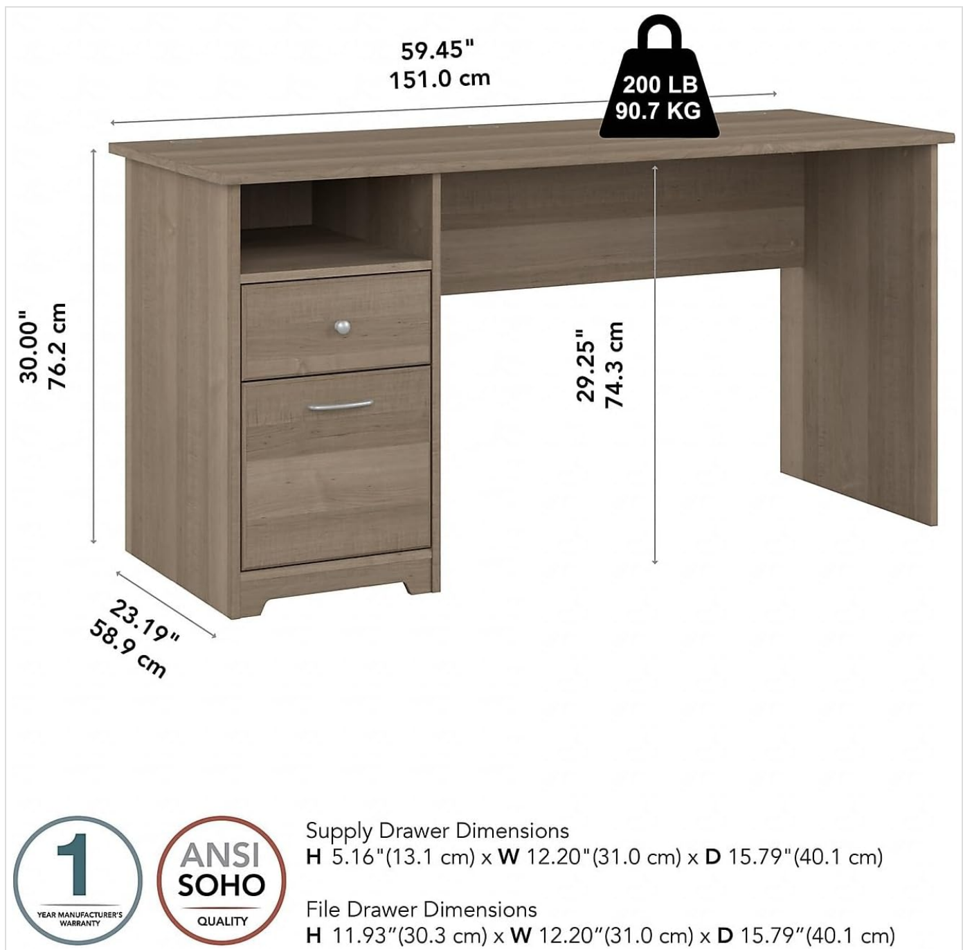
Image 8.1: Diagram illustrating the key dimensions and maximum weight capacity of the desk.