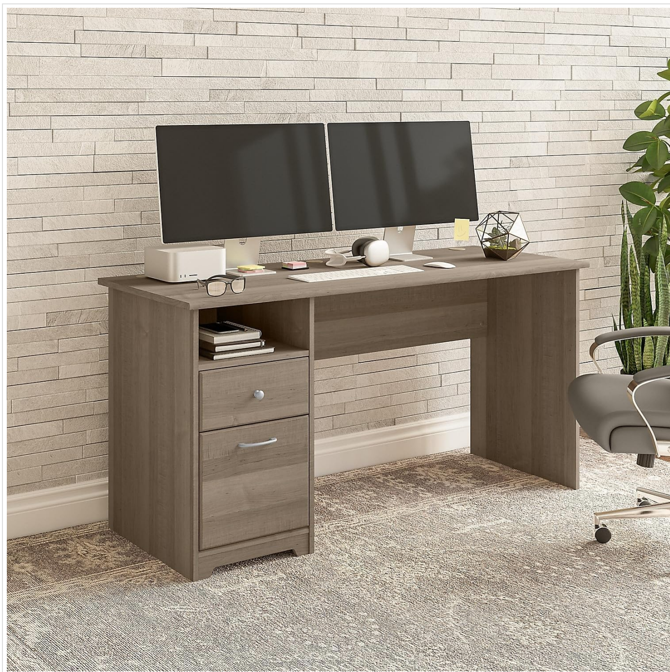
Image 5.1: The desk configured in a home office, demonstrating its capacity for multiple monitors and organized workspace.