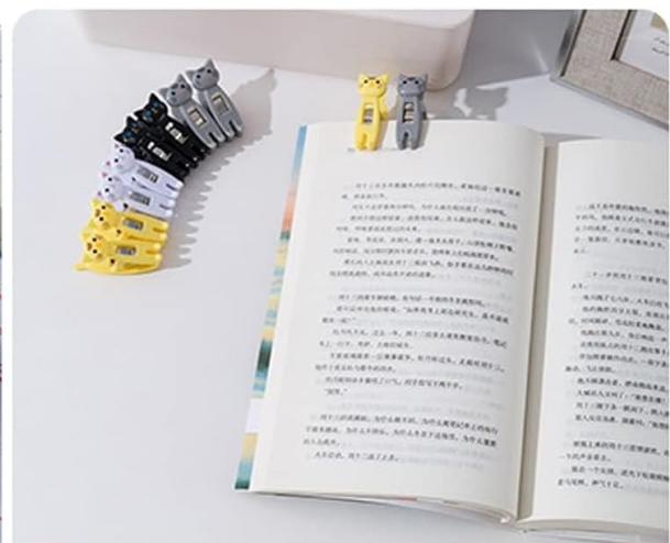
Use as bookmark

Image: A visual guide demonstrating the multi-functional uses of the clips, including securing food bags, organizing papers, and serving as bookmarks or clothesline clips.