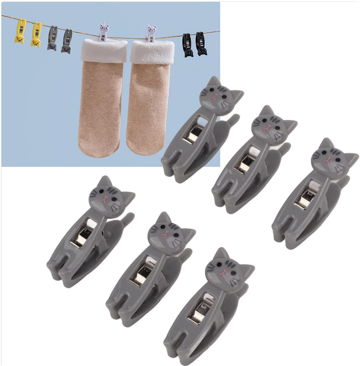
Image: Six grey cat-shaped clips shown in use, holding socks on a clothesline, demonstrating their readiness for various applications.