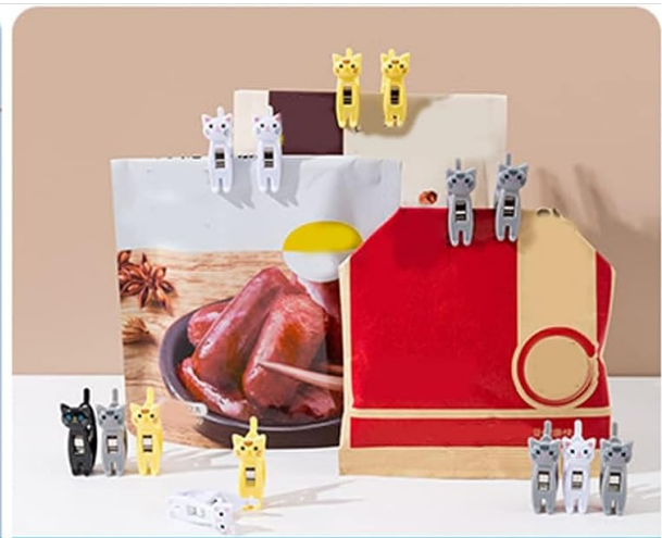
Used as food bag sealing clip