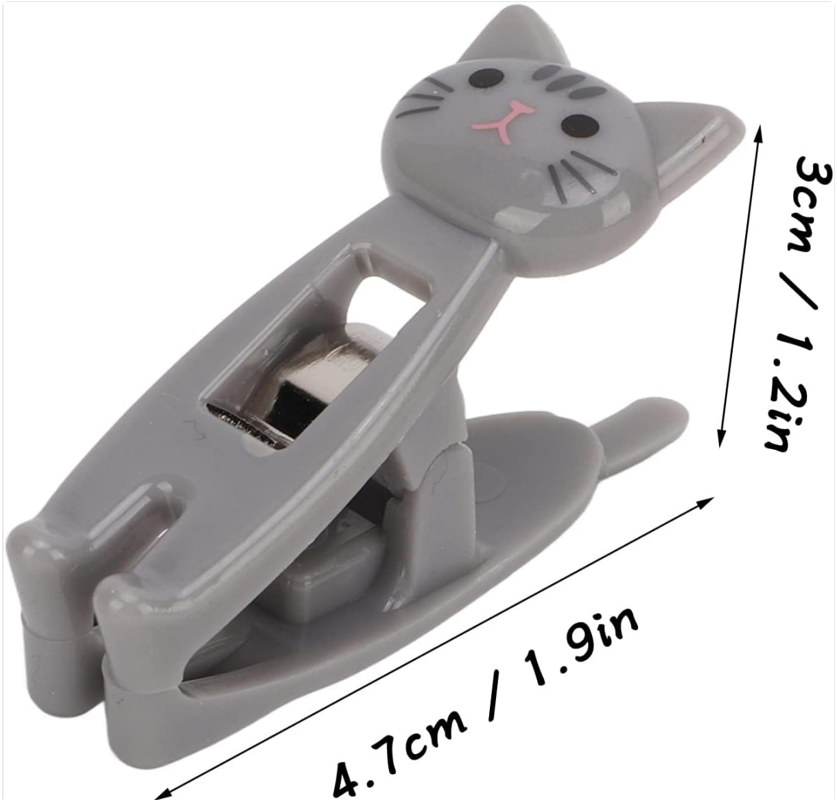
Image: A detailed view of a single cat clip, illustrating its approximate dimensions for reference.