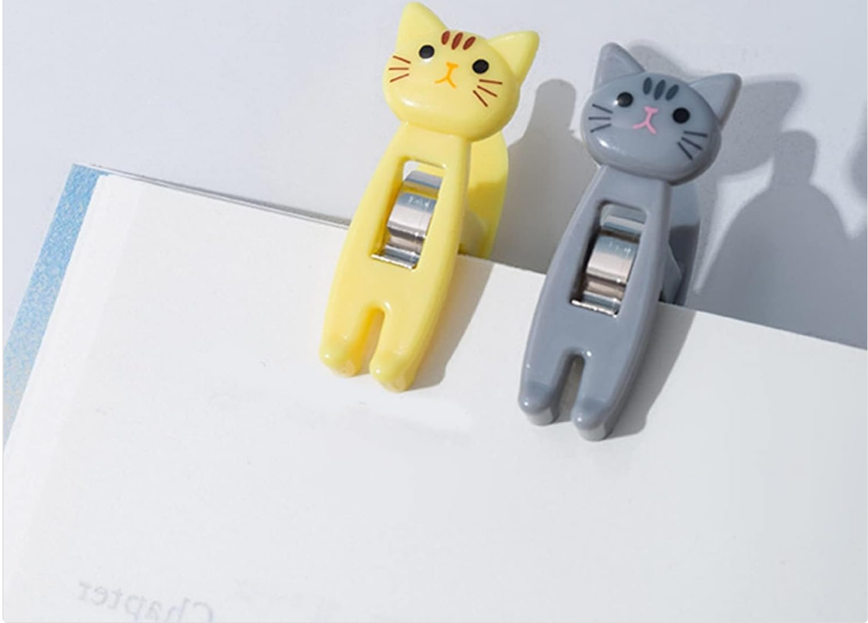
Image: Two cat clips, one yellow and one grey, highlighting the smooth, burr-free finish from the one-piece molding process, which contributes to easy cleaning and maintenance.