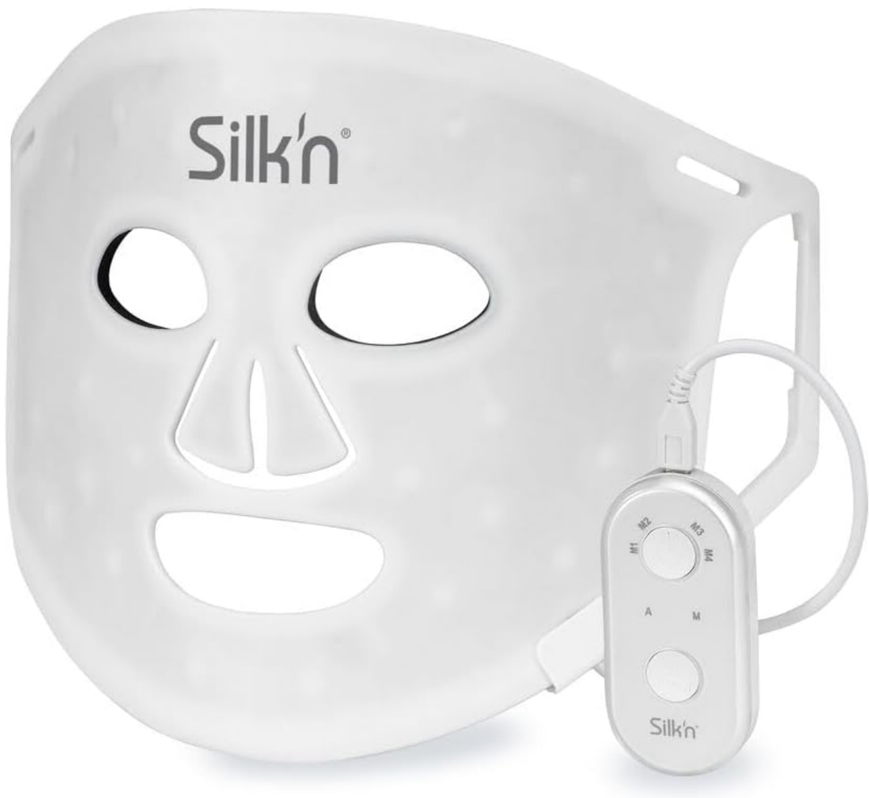
Image 1.1: The Silk'n LED Face Mask 100, showing its flexible design and attached wired controller.