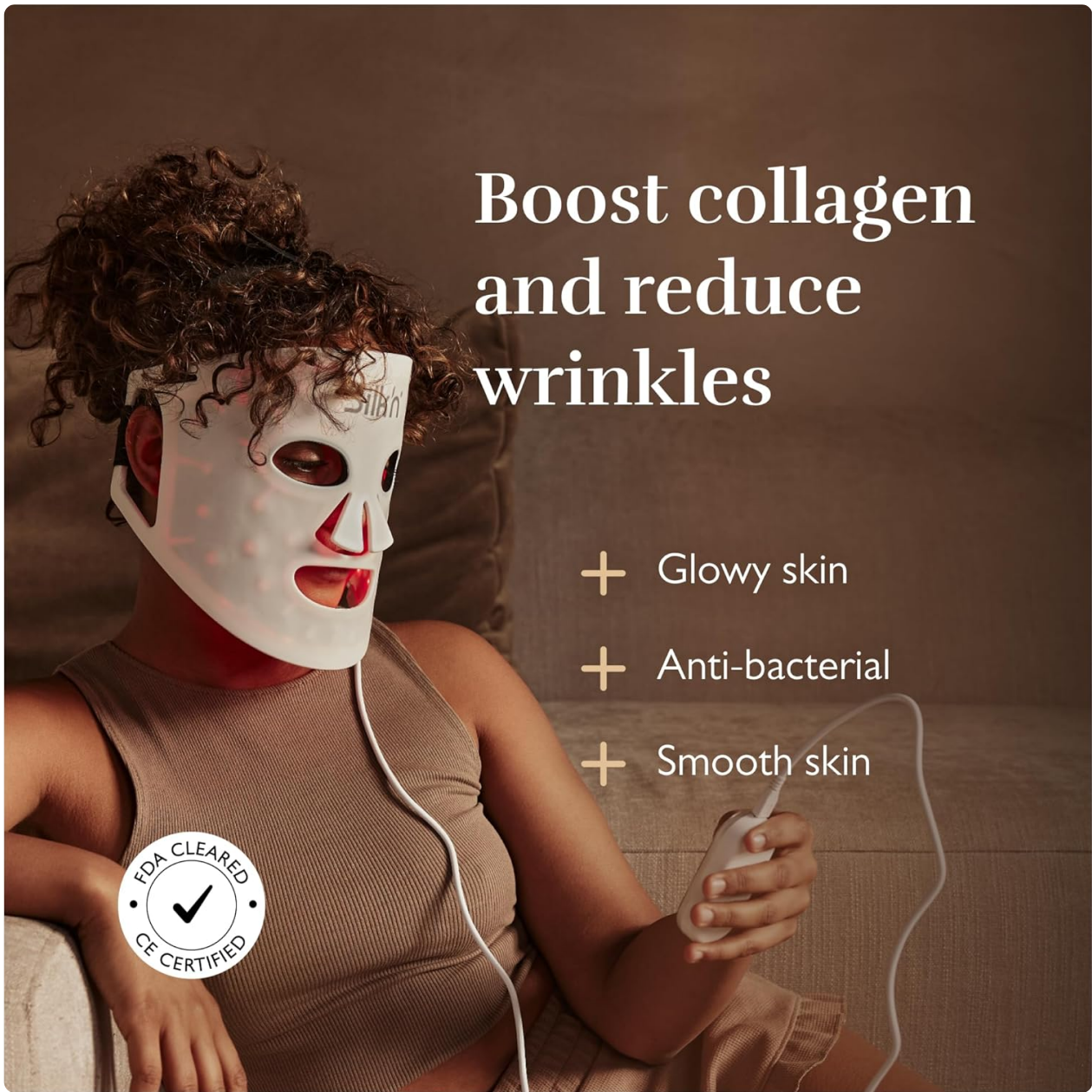
Image 4.2: User demonstrating the red light therapy mode for collagen boosting and wrinkle reduction.