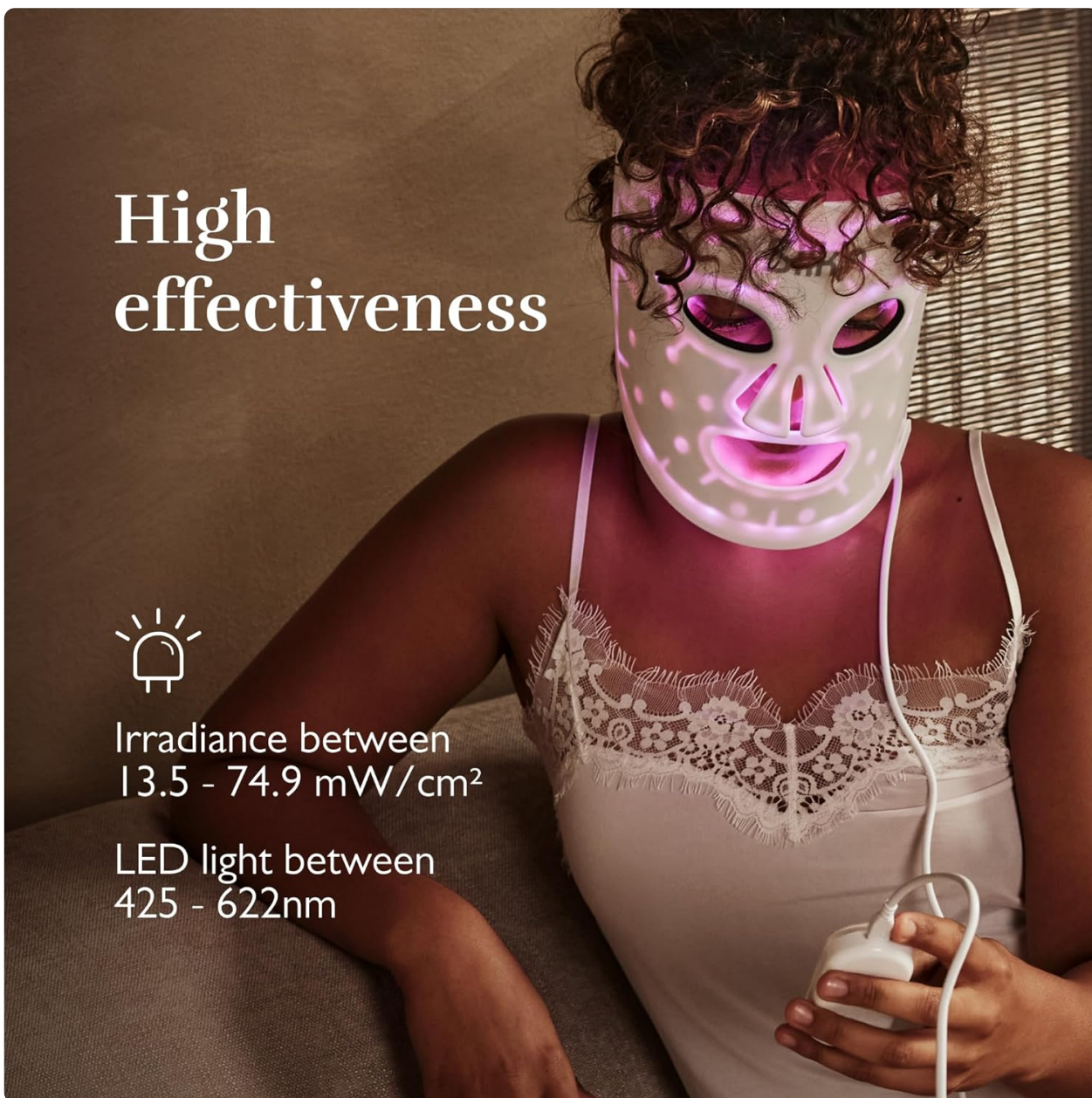
Image 4.4: User demonstrating the purple light therapy mode, emphasizing the mask's high effectiveness.