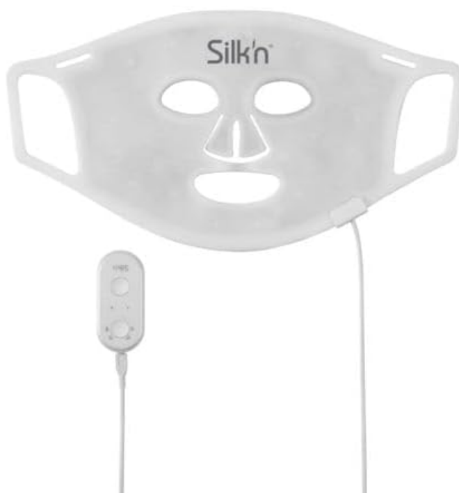
Image 3.1: The Silk'n LED Face Mask laid flat, showing the connection point for the controller.