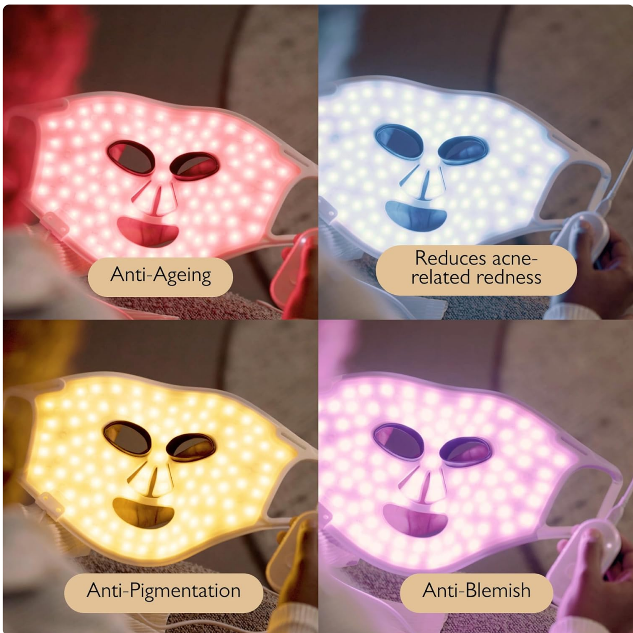
Image 4.1: Visual representation of the different LED light colors and their targeted skin benefits.