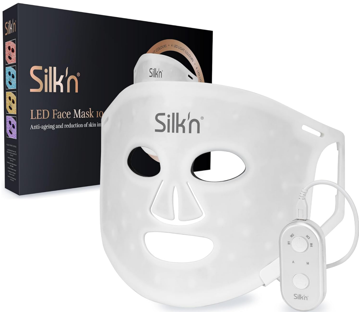
Image 1.2: The Silk'n LED Face Mask 100 displayed alongside its product packaging.