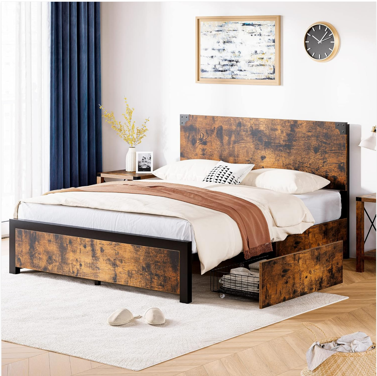
Image 1.1: Fully assembled IDEALHOUSE Queen Size Bed Frame with headboard and storage drawers.