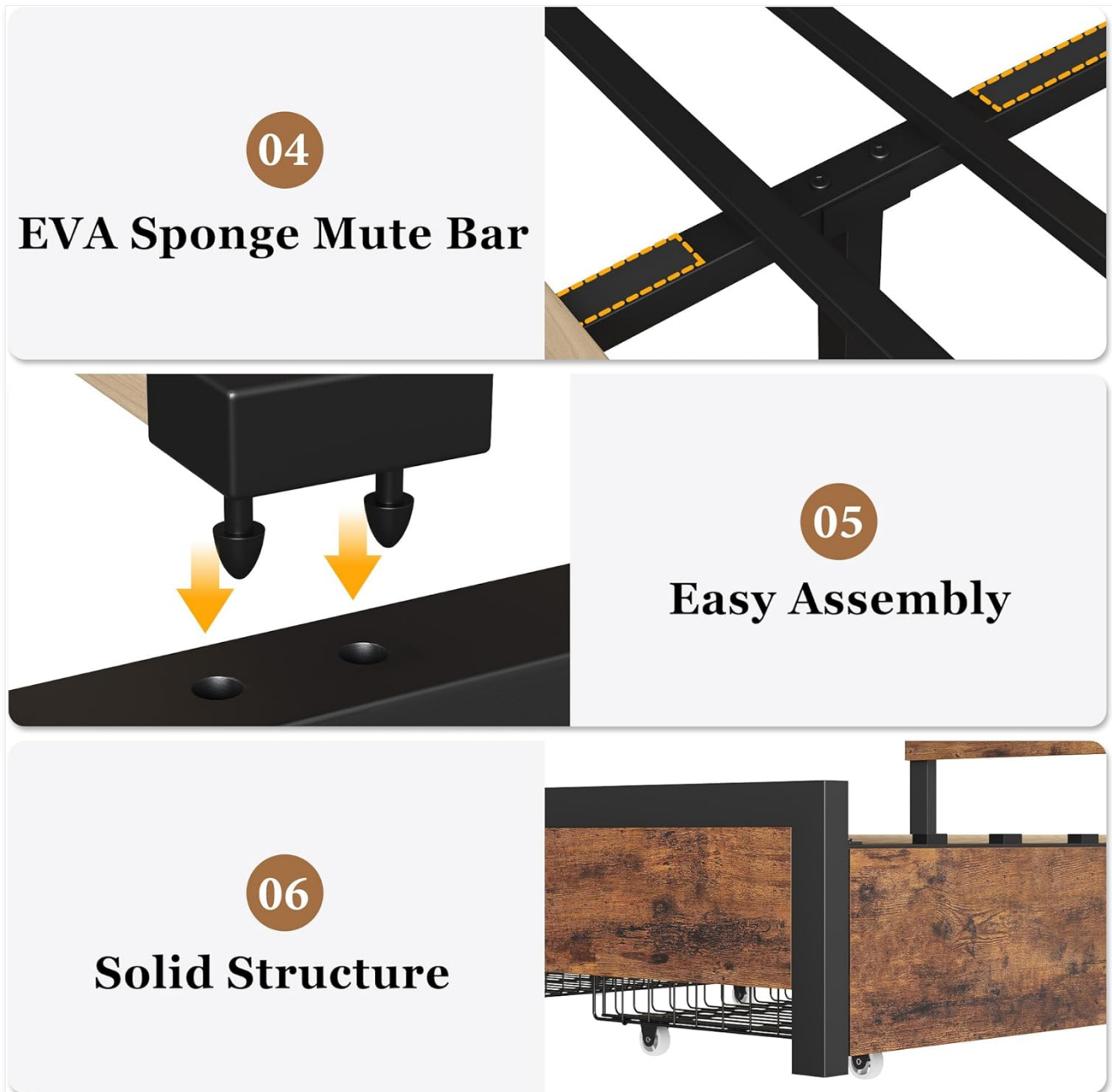
Image 4.1: Key assembly features including the EVA sponge mute bar for noise reduction and the solid structure design.

Note: This bed frame does not require a box spring. Your mattress can be placed directly on the wooden slats.