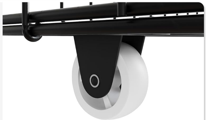
Image 3.1: Detailed view of storage drawer components, including the basket, front panel, and wheels.