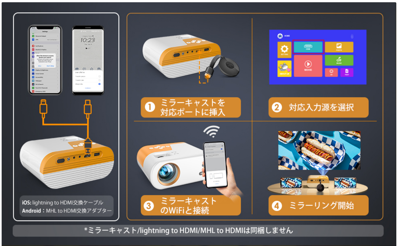
Image: Diagram illustrating various connection methods for the YOWHICK DP02 projector, including HDMI, USB, and smartphone mirroring.