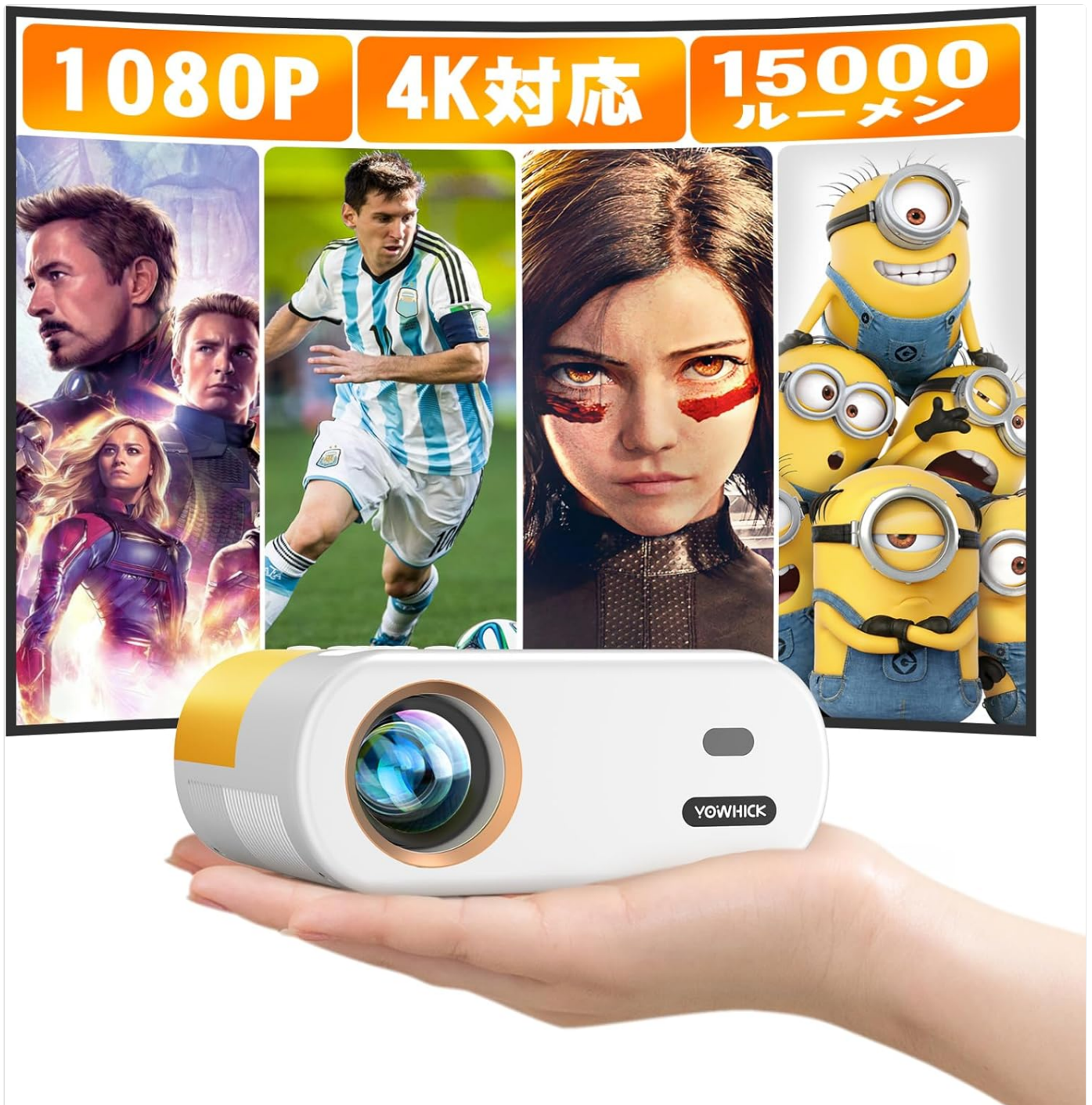
Image: Front view of the YOWHICK DP02 Mini Projector, showcasing its compact design and lens.

The YOWHICK DP02 is a compact and lightweight mini projector designed for home entertainment and portable use. It features native 1080P resolution with 4K support, 15000 lumens brightness, and a built-in HiFi speaker.