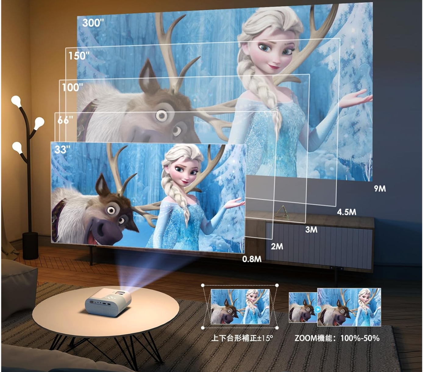
Image: Visual representation of projection distances and corresponding screen sizes for the YOWHICK DP02, showing short-throw capability.