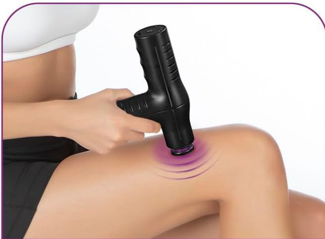
FLACH-AUFSATZ für den gesamten Körper