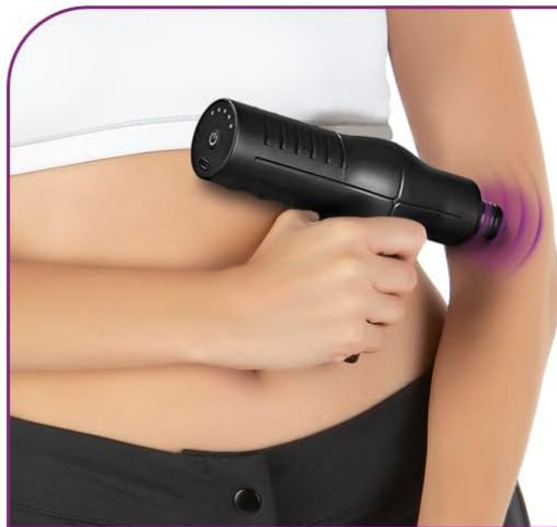
PATRONEN-AUFSATZ für Füße, Arme, Hände und Co.