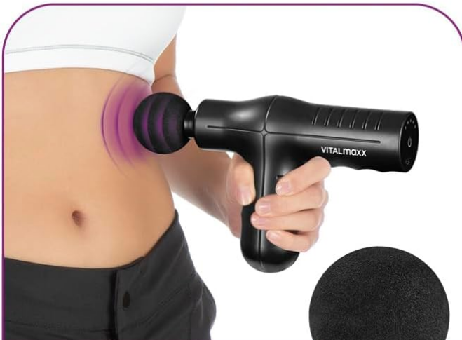
KUGEL-AUFSATZ für große Partien, wie z.B. Bauchmuskeln