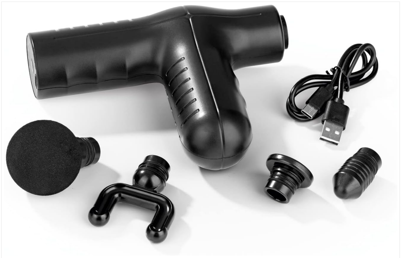
Image: The VITALmaxx Electric Mini Massage Gun, four massage heads, and a USB charging cable laid out.