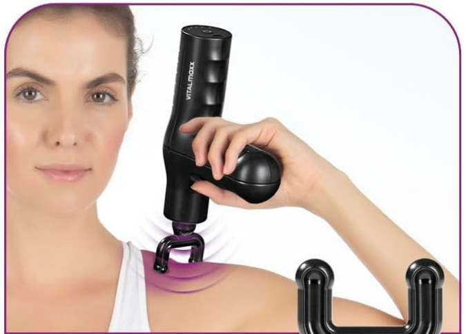
GABEL-AUFSATZ für den Nacken, Rücken- strecker, Waden u.v.m