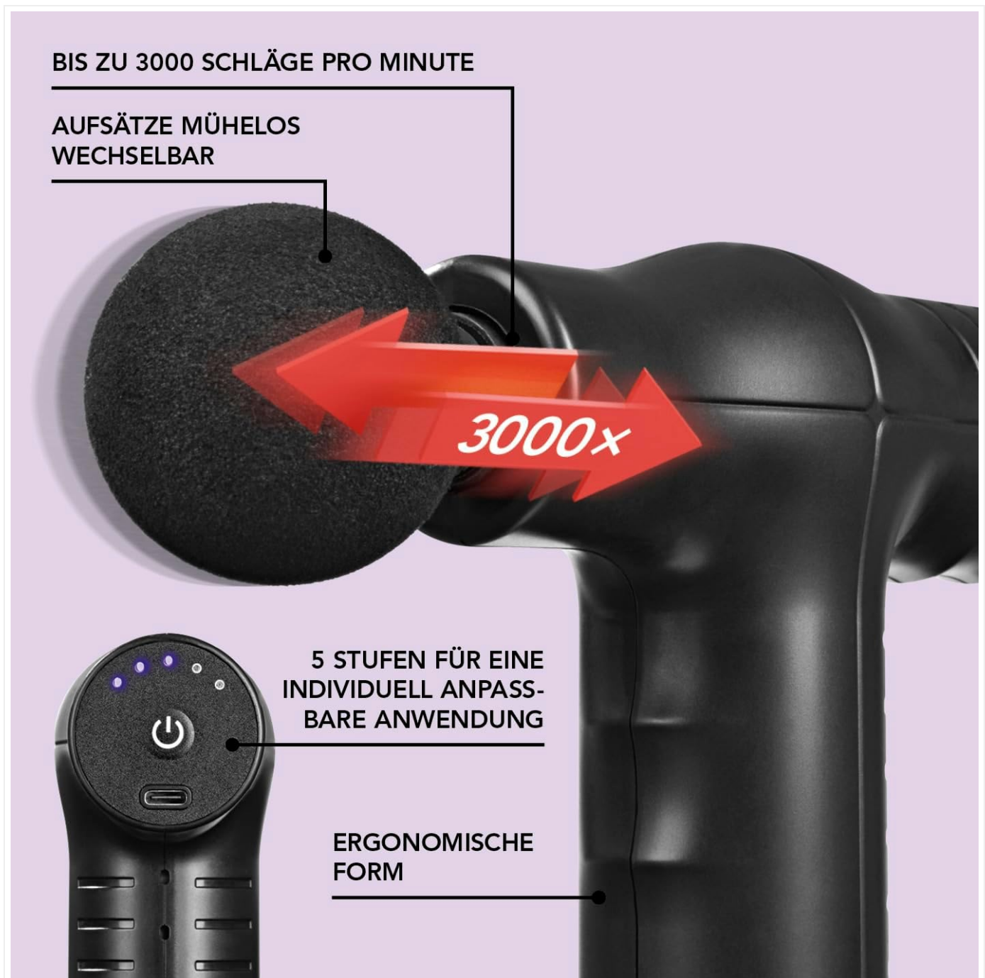
Image: A diagram illustrating the VITALmaxx Electric Mini Massage Gun's features, including up to 3000 strokes per minute, interchangeable attachments, 5 intensity levels, and ergonomic form.