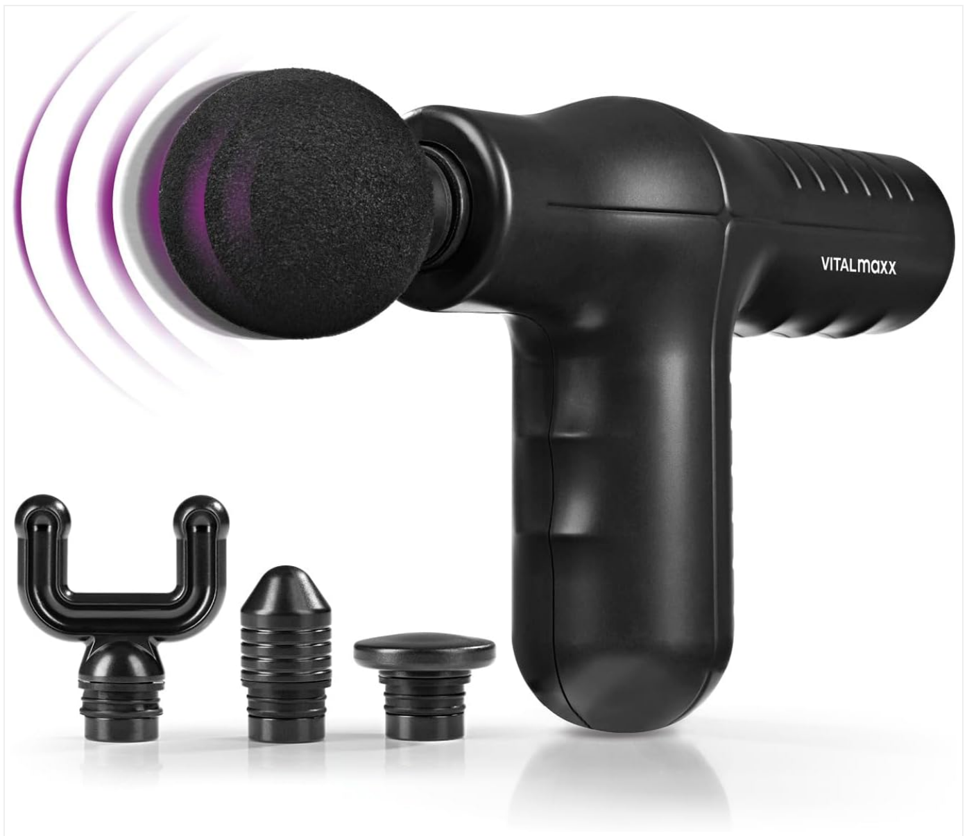
Image: The VITALmaxx Electric Mini Massage Gun shown with its main unit and four interchangeable massage heads.