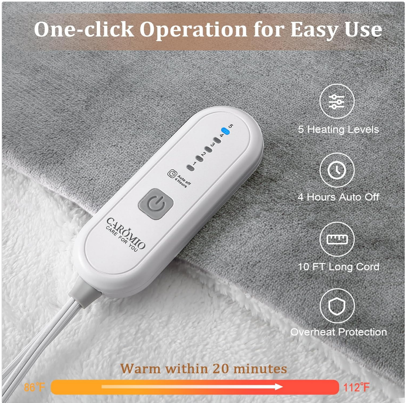
Image: Close-up of the CAROMIO heated blanket controller, showing buttons for High, Med, Low, Warm heat settings, and a 4-hour auto-off timer. This controller allows for easy adjustment of the blanket's temperature and timer settings.