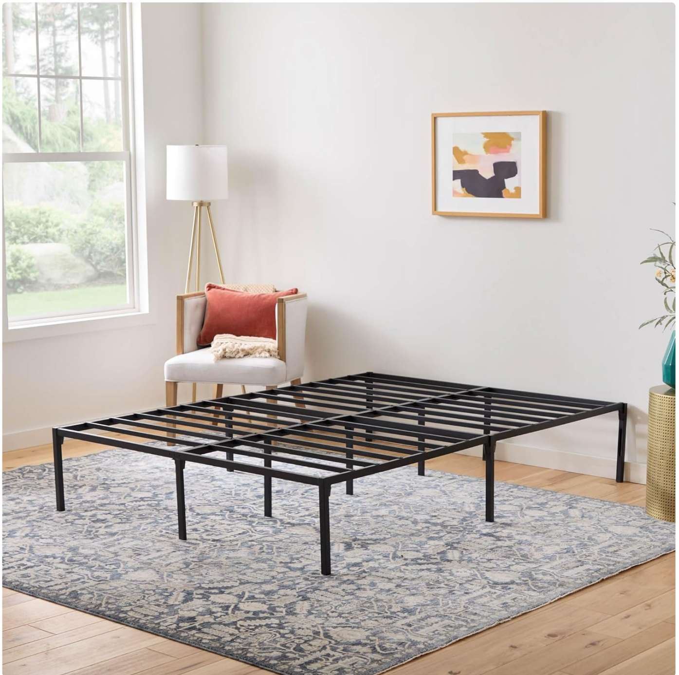
Image: Linenspa Heavy Duty Metal Platform Bed Frame, King Size. This image shows the assembled bed frame without a mattress, highlighting its minimalist design and sturdy construction in a bedroom setting.