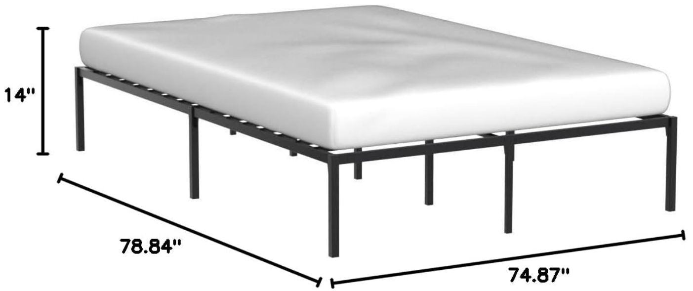
Image: Dimensions of Linenspa Bed Frame. This image provides a visual representation of the bed frame's length, width, and height measurements.