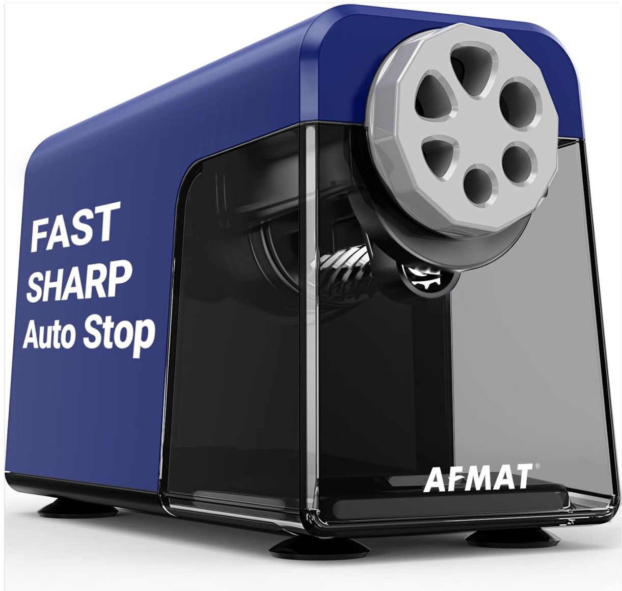
Image: The AFMAT PSX1 Electric Pencil Sharpener, highlighting its fast sharpening and auto-stop capabilities.