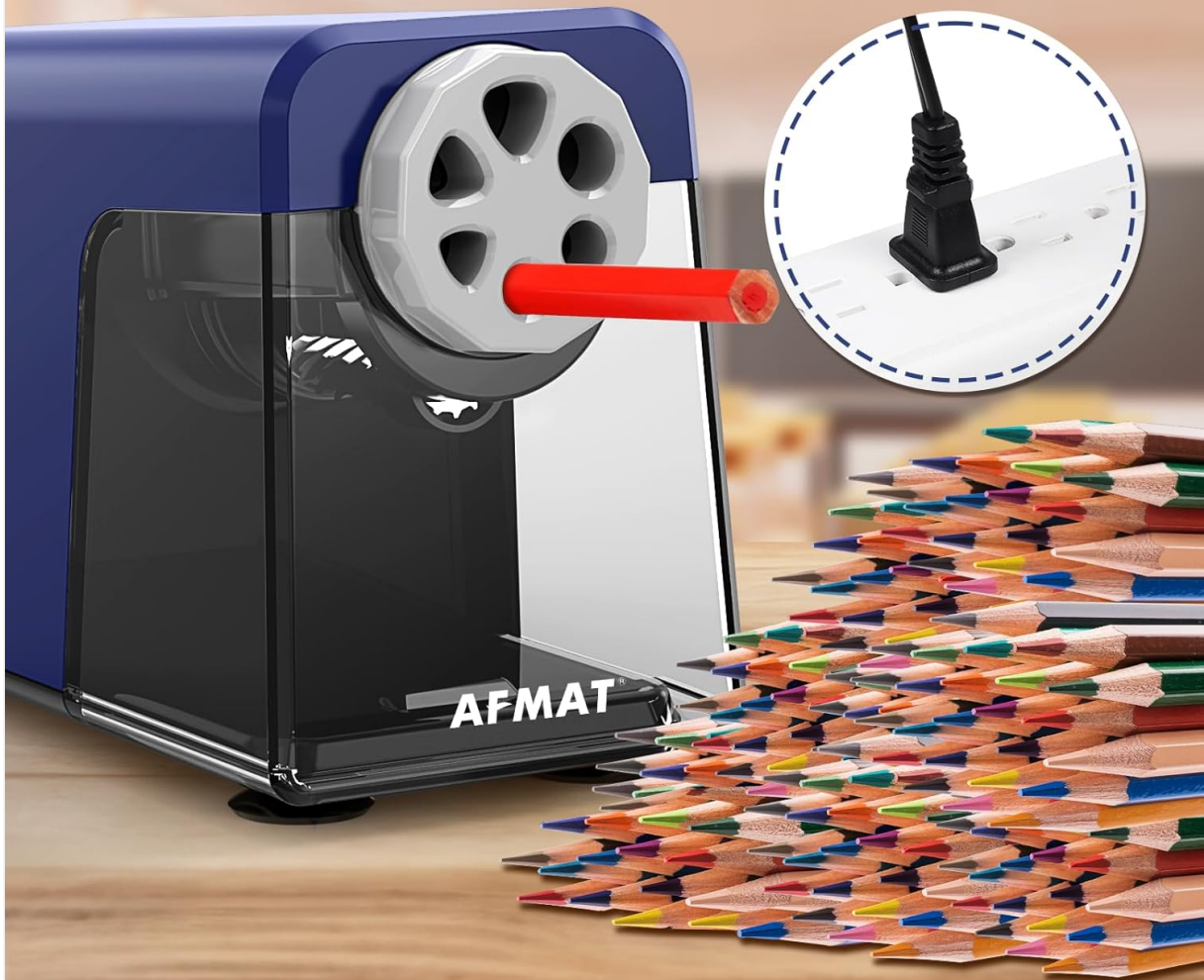
Image: The sharpener in action, demonstrating its powerful motor and ability to handle multiple pencils.