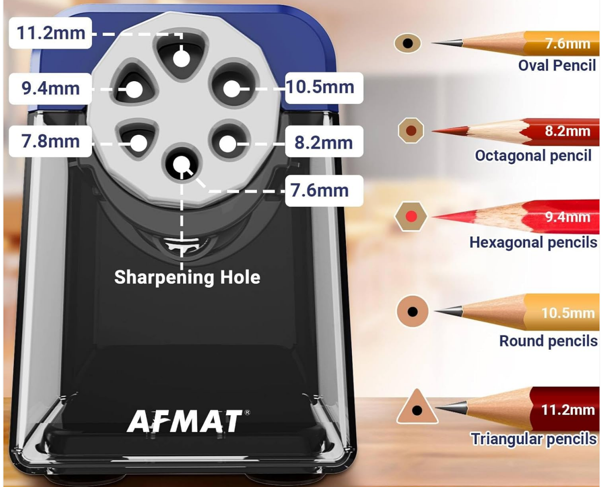
Image: Diagram detailing the six sharpening holes and their compatibility with various pencil diameters and shapes.