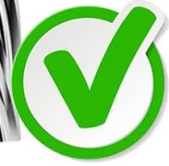
Image: Comparison of blade durability, emphasizing the PSX1's extended blade life.