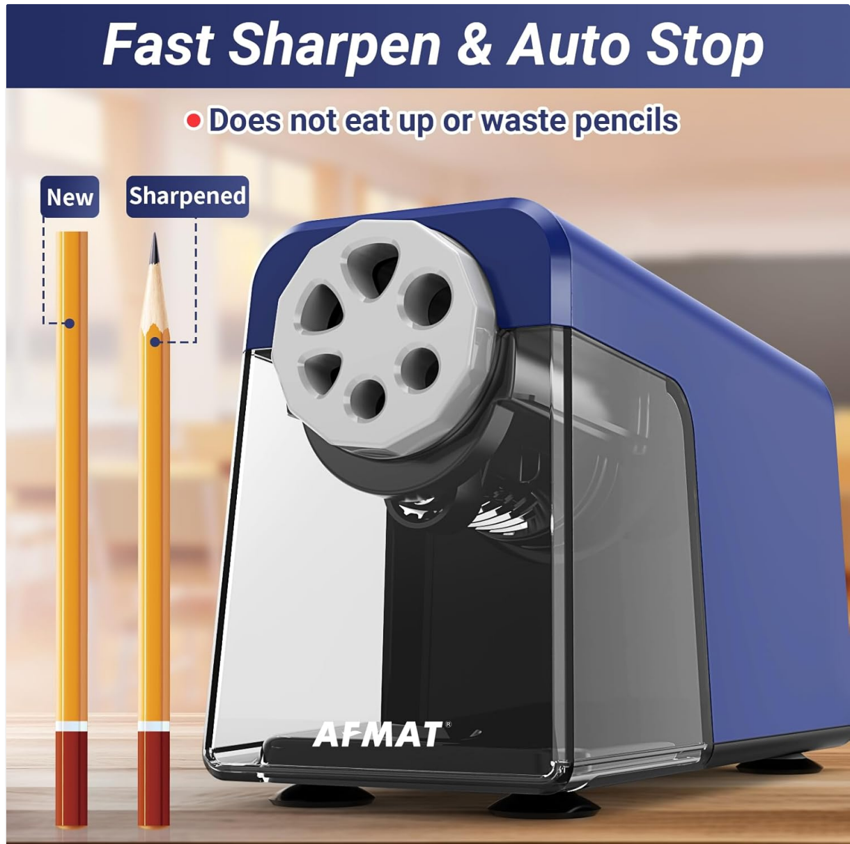
Image: Visual representation of the sharpener's fast sharpening and auto-stop function, showing a pencil before and after sharpening.