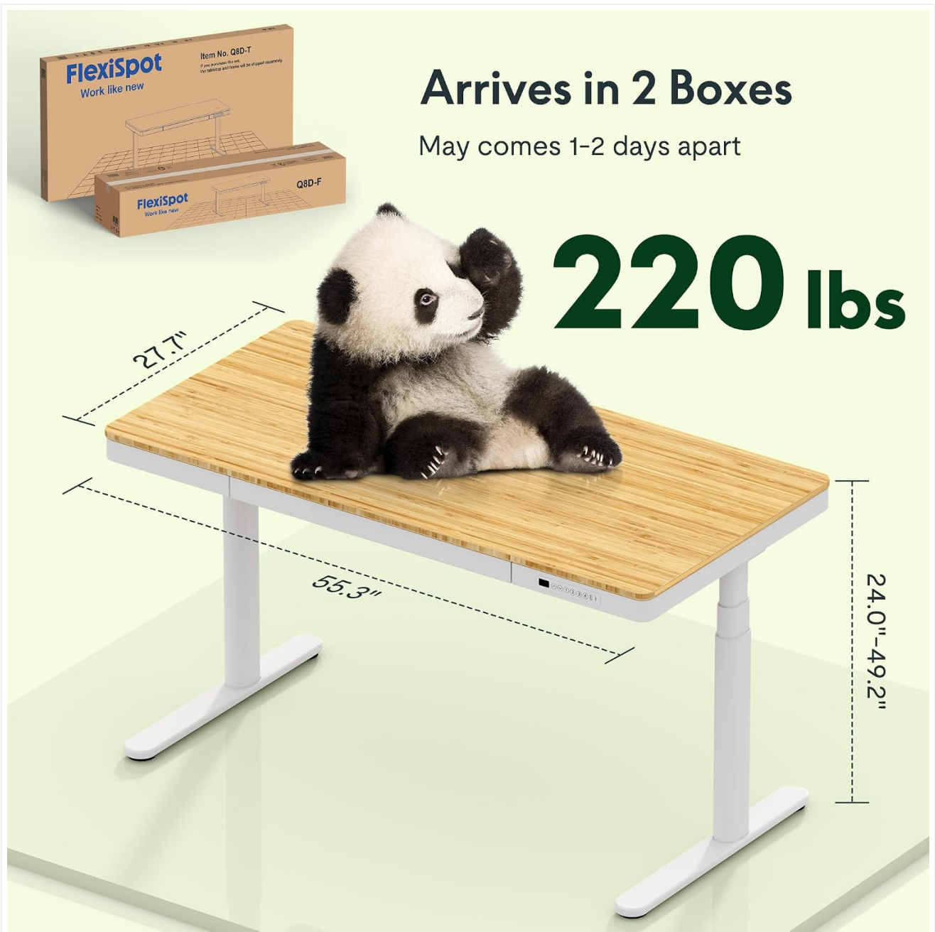
Image: The desk components are shipped in two separate boxes.

Assembly can be completed in approximately 15 minutes with the included tools and instructions. It is recommended to have two people for assembly due to the weight of the tabletop.