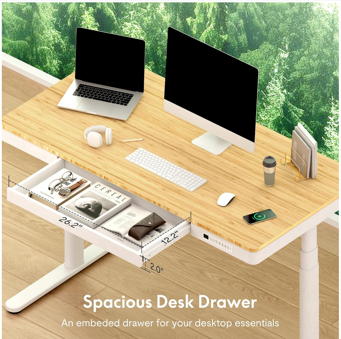
Image: Spacious desk drawer for organizing essentials.