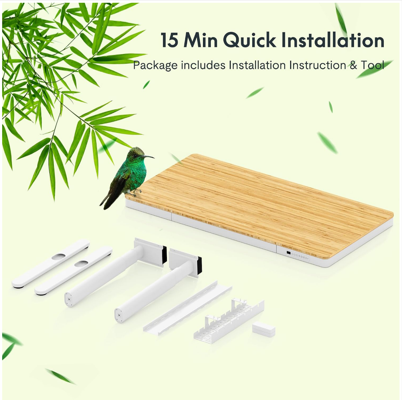
Image: All components for the 15-minute quick installation, including the bamboo top, legs, and control unit.

Package includes Installation Instruction & Tool