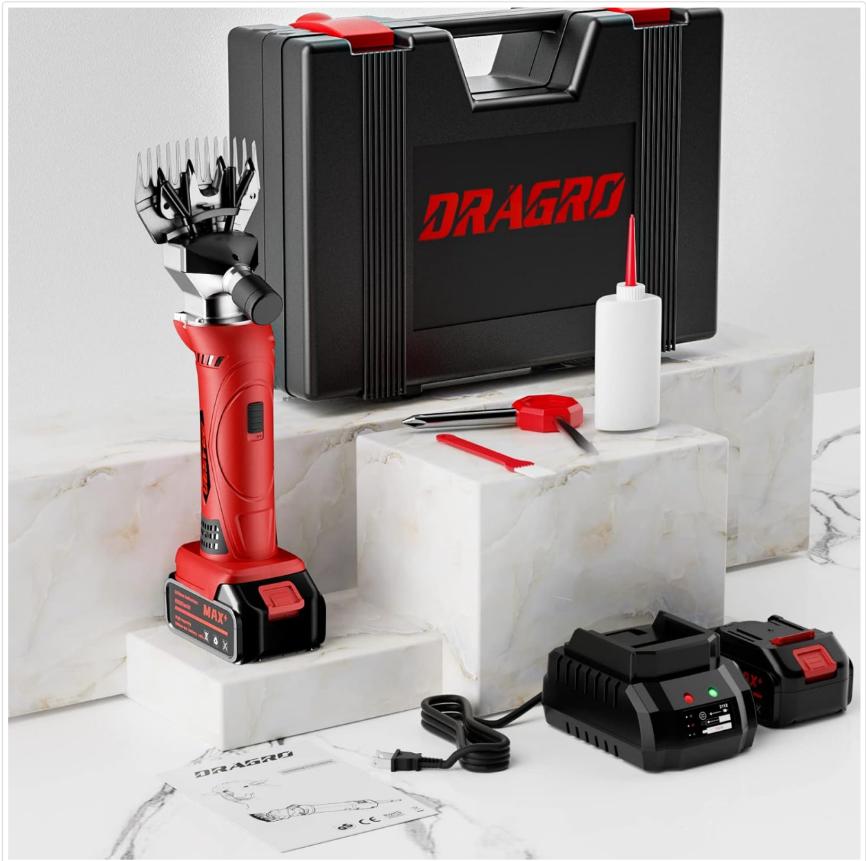
The complete Dragro Cordless Electric Sheep Shears kit, including the main unit, batteries, charger, and accessories, neatly organized in its storage case.