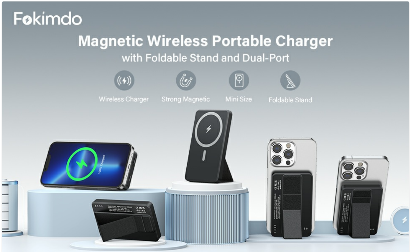
Image: The power bank magnetically attaching to an iPhone, initiating wireless charging.