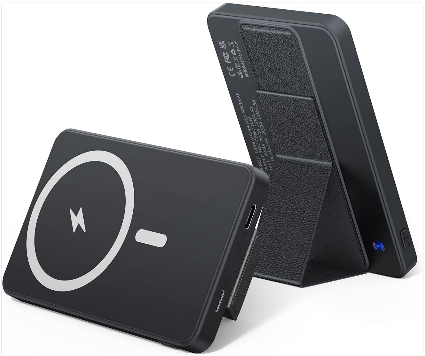
Image: A diagram showing the various ports and indicators on the power bank, including the magnetic wireless charging area, USB-C port, Lightning port, power button, and LED battery status lights.