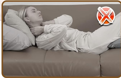
Image: Illustration of the non-skid bottom feature and the benefit of using a wedge set over loose pillows.