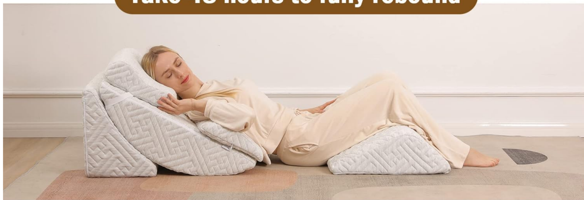
Image: Pillow dimensions and a note indicating 48 hours for full rebound.