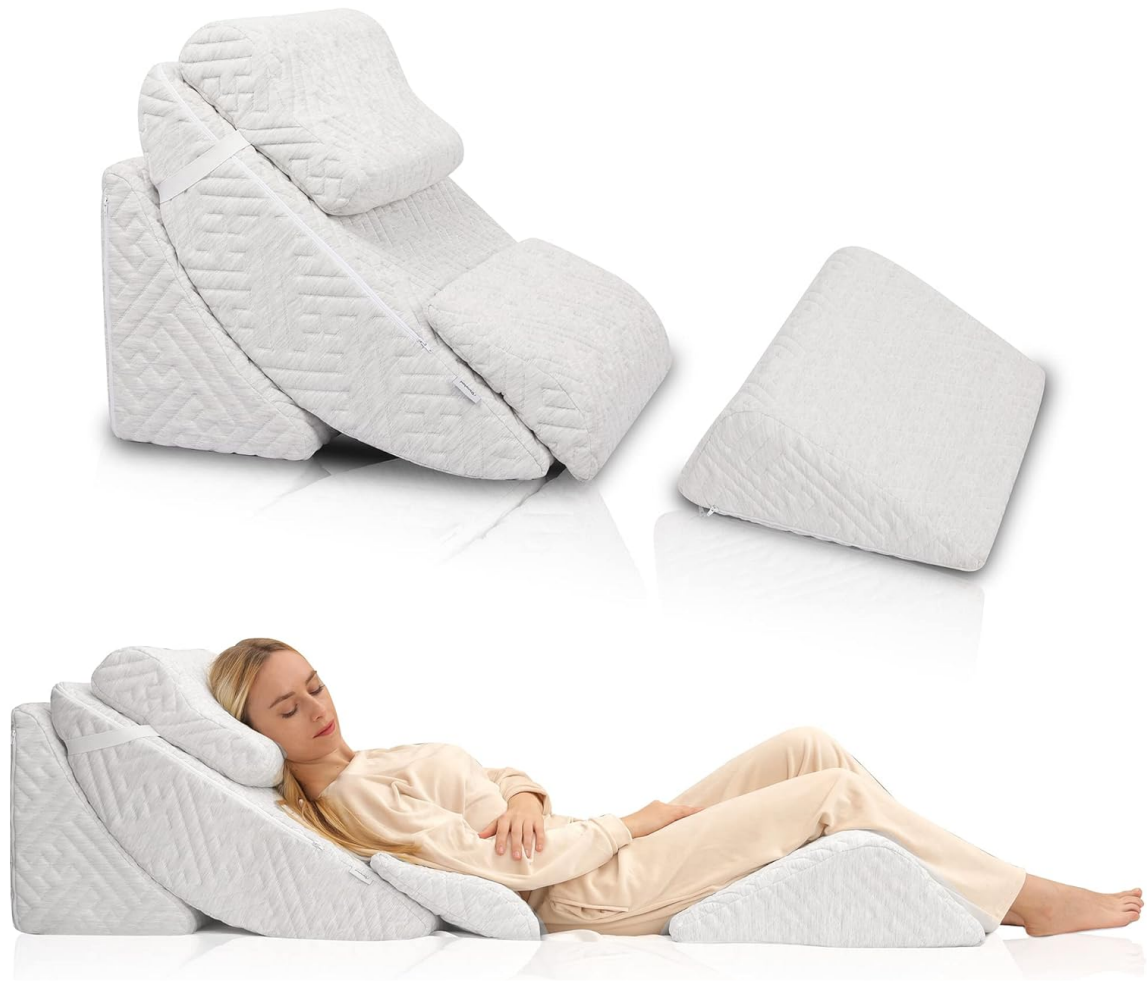
Image: The 5-piece set configured for elevated sleeping, demonstrating full body support.