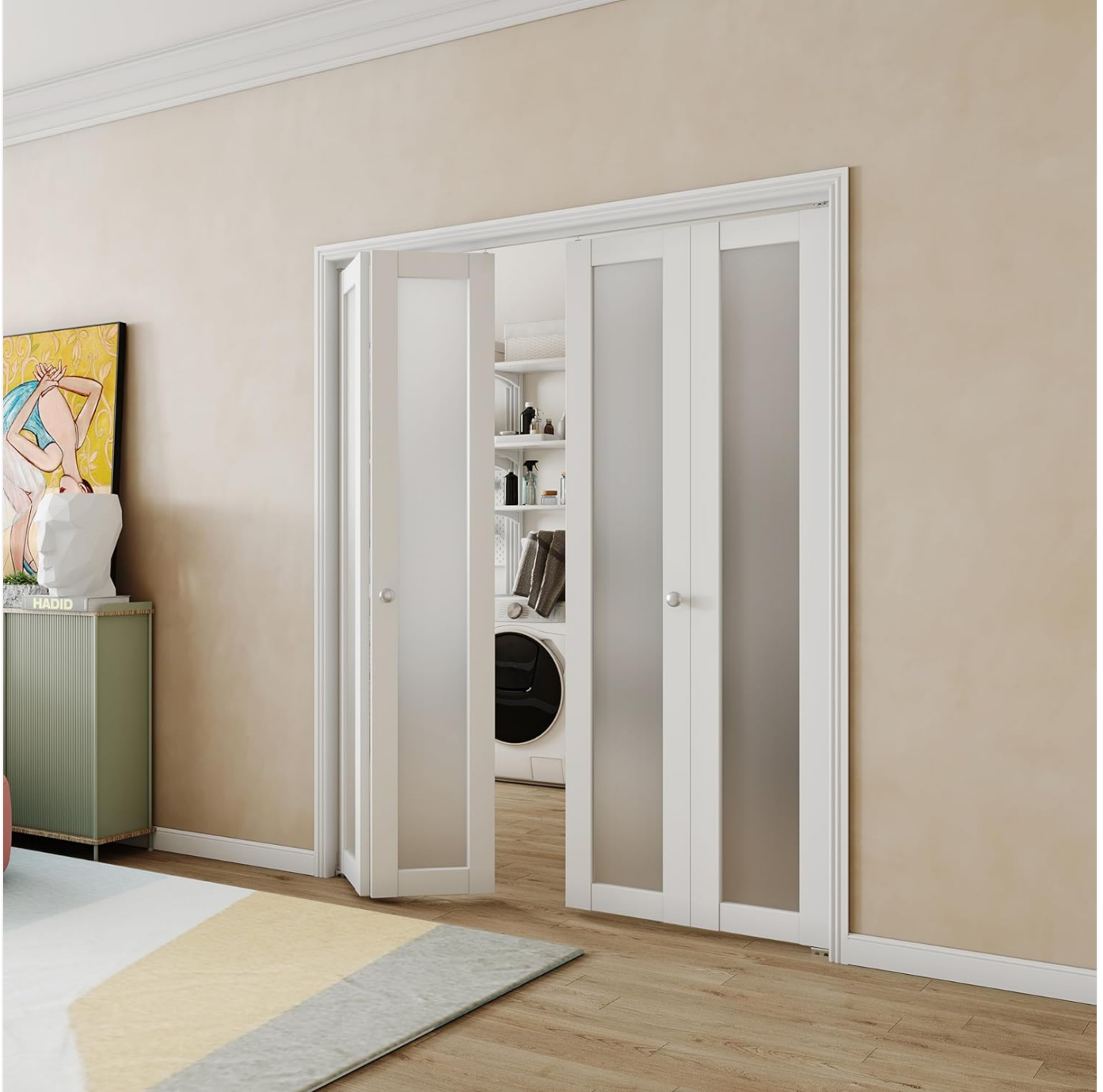
Image: A double bi-fold door configuration with frosted glass panels, installed in a wider doorway, showcasing the doors partially open.

Important Note: Some users have reported that the door height may require minor adjustments or aftermarket pivot points for a perfect fit in an 80-inch opening. Proceed slowly and carefully during installation, making small adjustments as needed. If you encounter difficulties, contact BARNER HOME customer support.