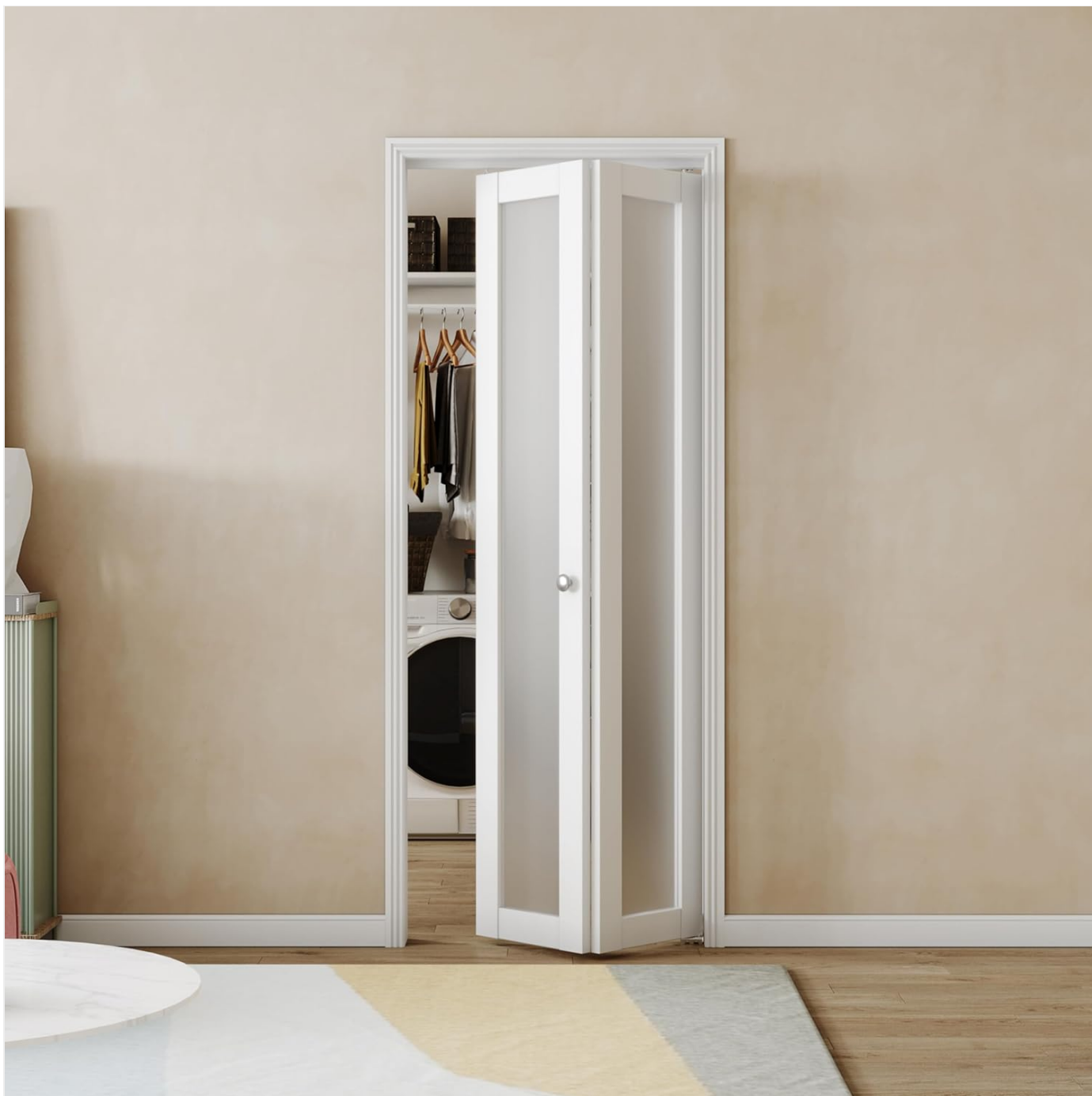
Image: A BARNER HOME single bi-fold door with frosted glass panels, installed in a doorway, partially open to show a closet interior with a washing machine.