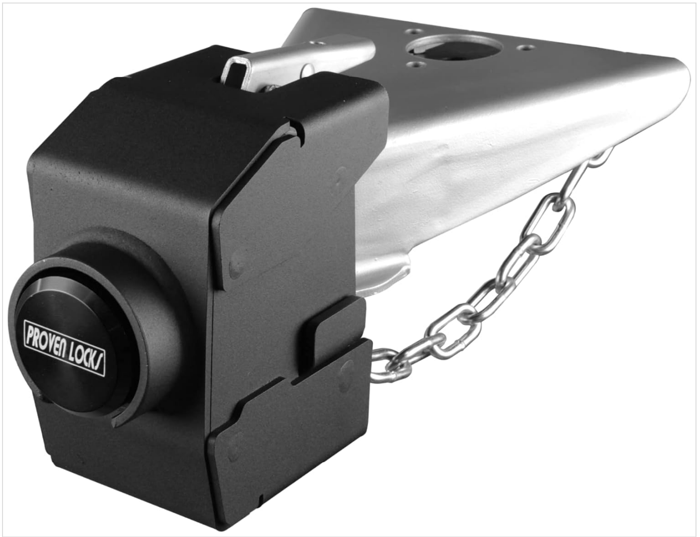
Image: The Proven Industries Model 2517-D Trailer Lock, shown in black, attached to a trailer coupler with a chain.