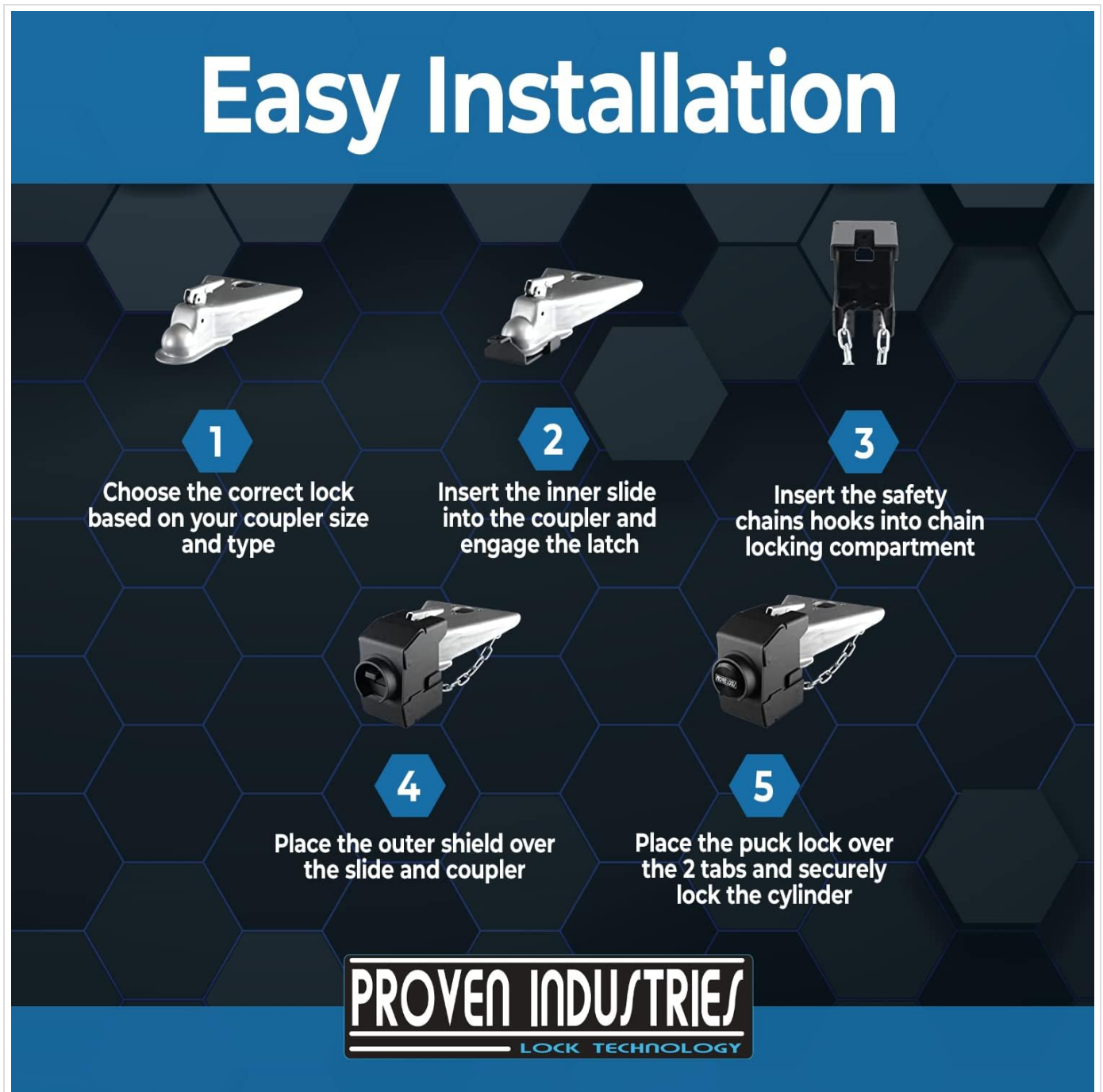
Image: A visual guide showing five steps for the easy installation of the trailer lock, from selecting the correct lock to securing it with the puck lock.