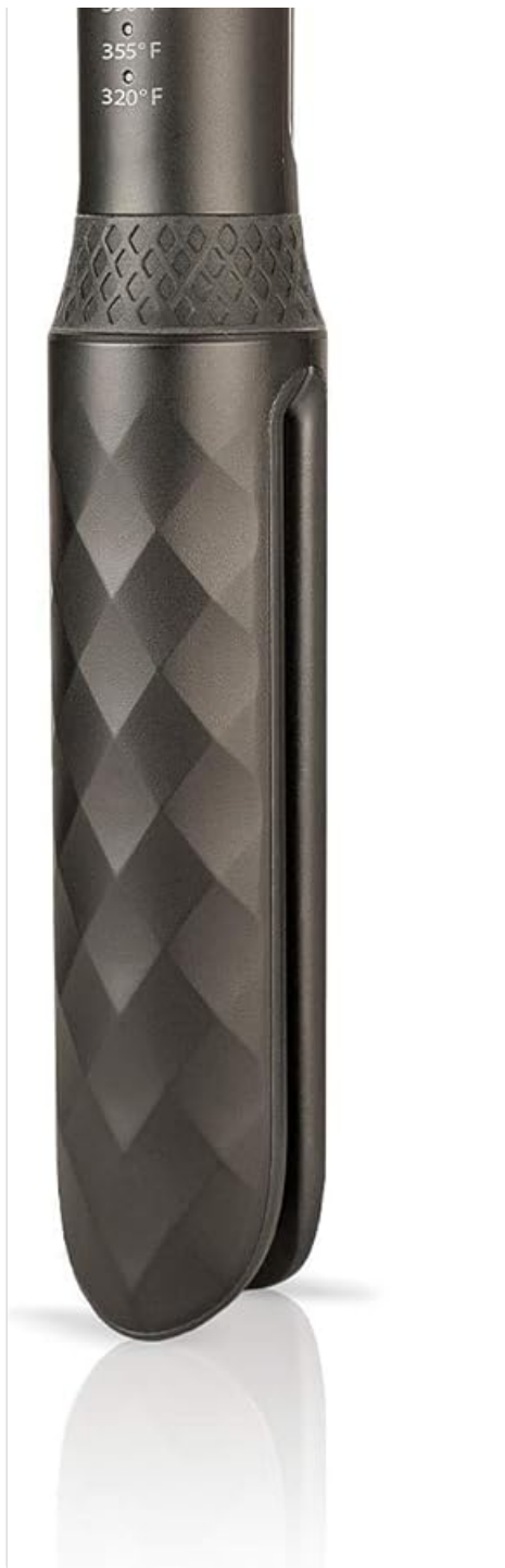
Image: The Usmooth Infinite Professional Styling Iron, showcasing its sleek design and ergonomic form.