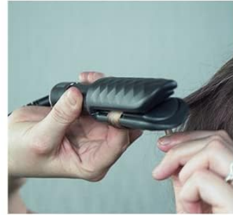
Image: Step 3 of curling, showing the final twirl of the hair section to define the curl.

Repeat for each additional section. For best results, allow hair to cool before manipulating the curls.