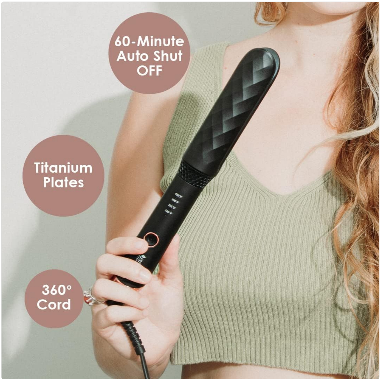
Image: The styling iron held in a hand, highlighting features like the 60-minute auto shut-off, titanium plates, and 360° swivel cord.