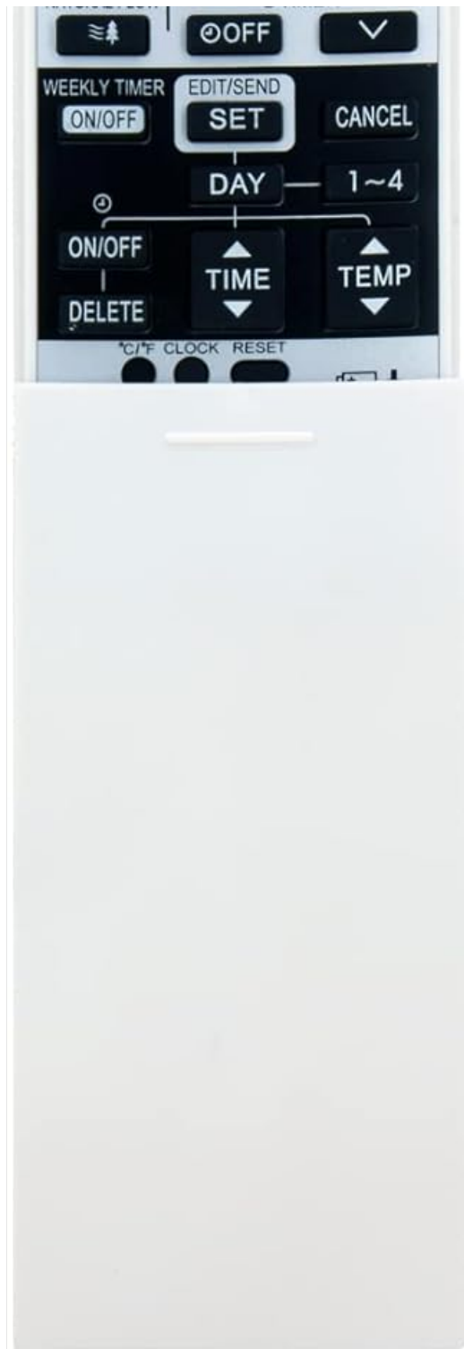
Figure 1: Front view of the remote control, highlighting the backlit display and primary buttons.