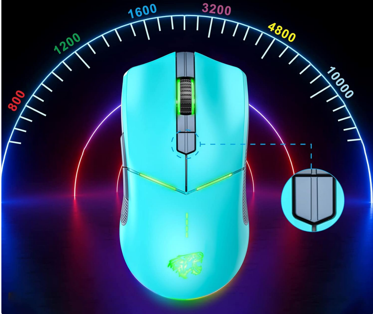
Image: Diagram illustrating the 6 adjustable DPI levels of the Uciefy U26 mouse.