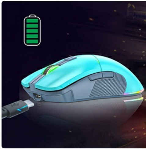
Image: The Uciefy U26 mouse being charged via its USB Type-C port.