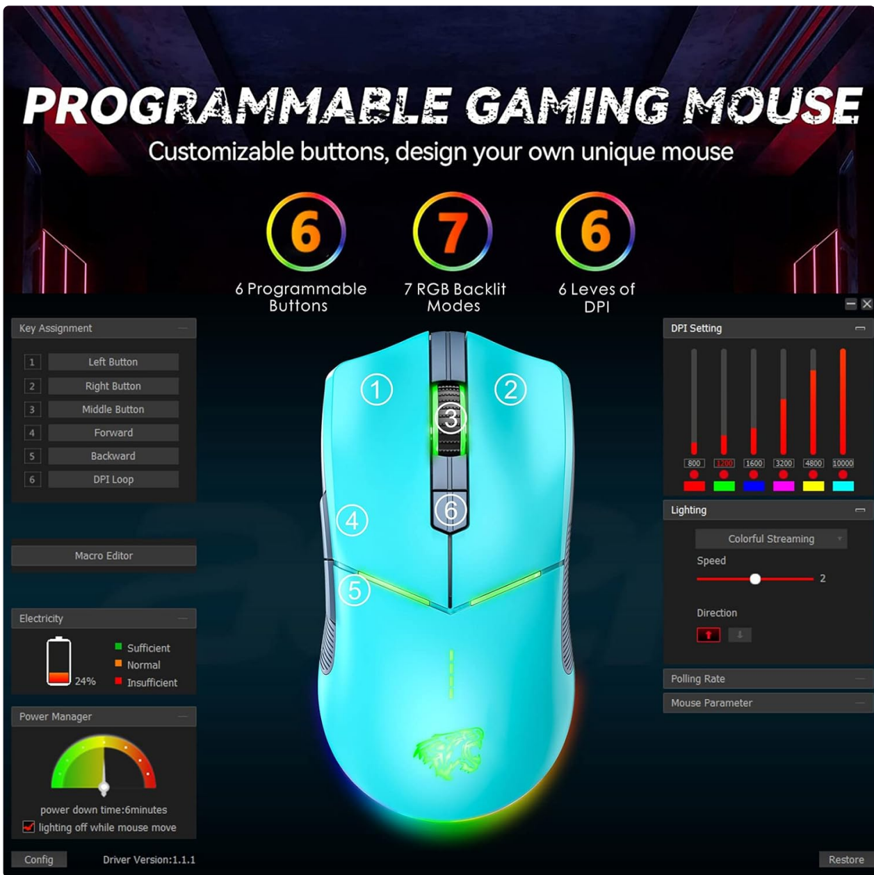
Image: Diagram of the Uciefy U26 mouse showing the location of its 6 programmable buttons.