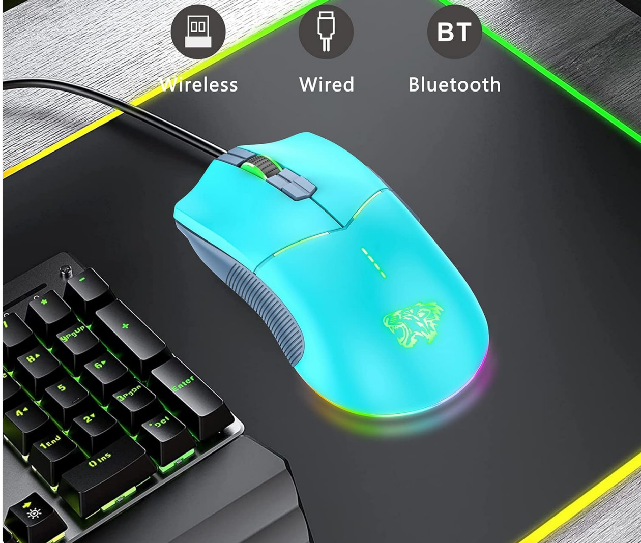
Image: Uciety U26 mouse highlighting its triple connectivity modes: Wireless, Wired, and Bluetooth.