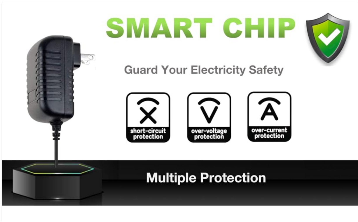
Figure 3.3: Illustration of the adapter's built-in safety features, including short-circuit, over-voltage, and over-current protection.