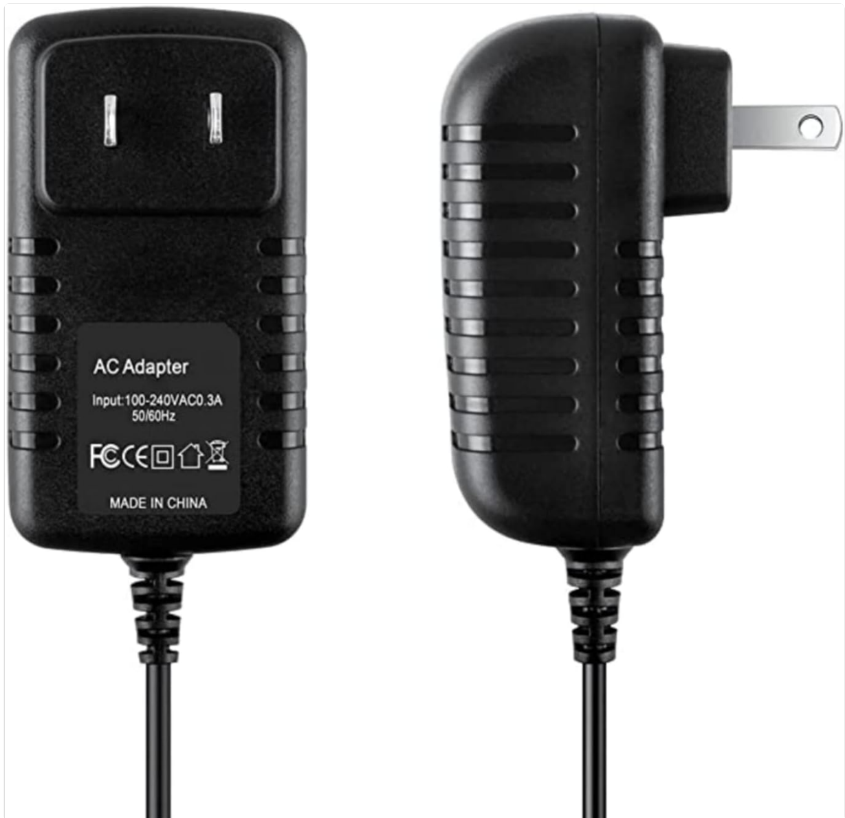
Figure 3.1: Front and side view of the Onerbl 2A AC Adapter, showing the two-prong plug and the DC output cable.