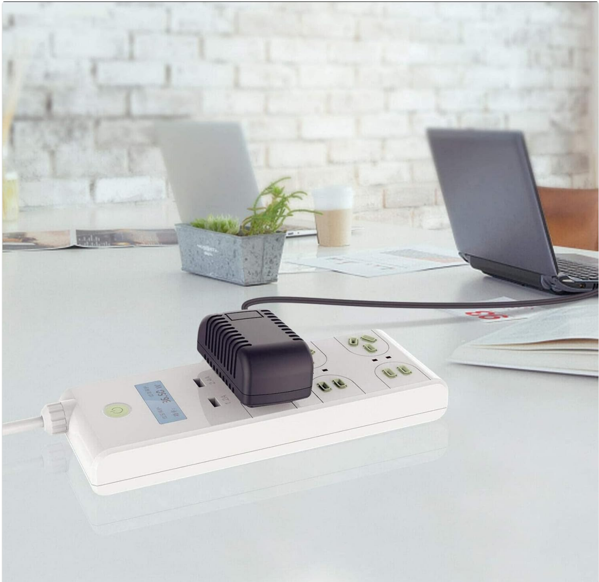
Figure 4.1: The AC adapter properly plugged into a power strip, ready for device connection.