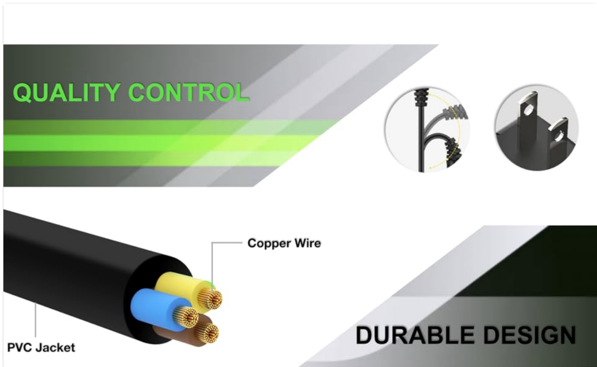
Figure 3.4: Diagram illustrating the durable design of the cable, featuring copper wire conductors and a protective PVC jacket.