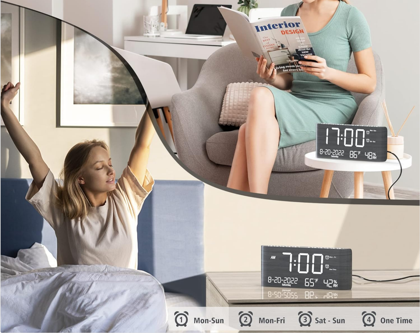
Figure 5: Dual alarm settings and modes.