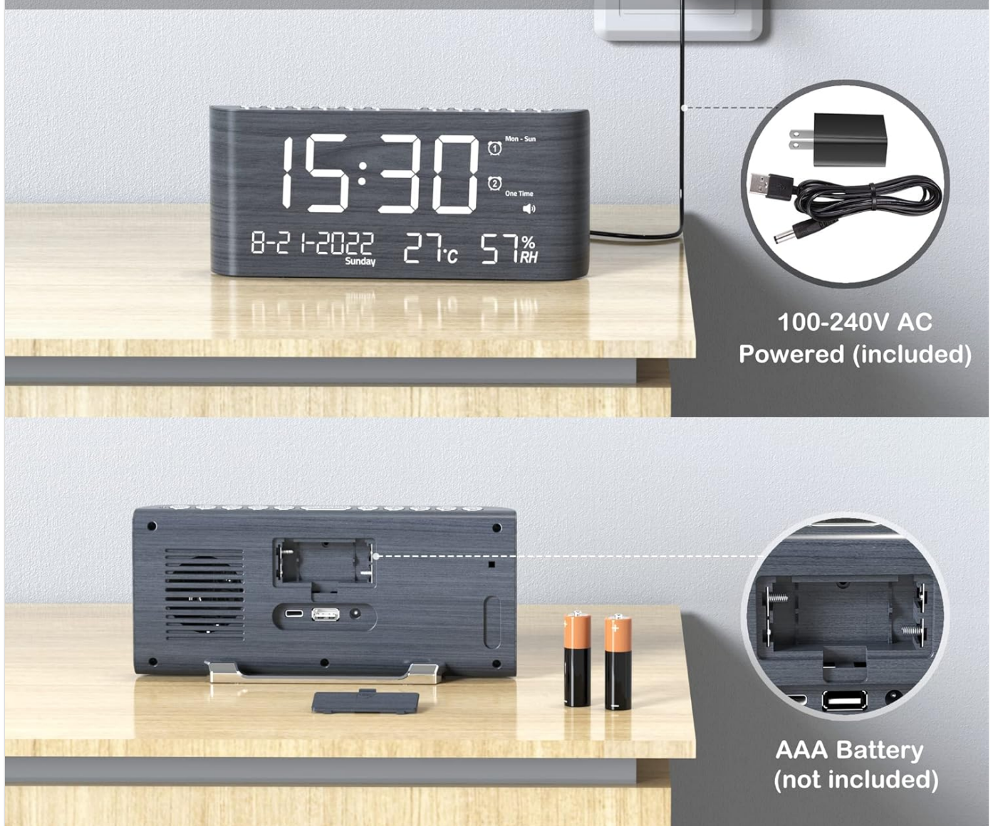
Figure 3: Power connection and battery backup.