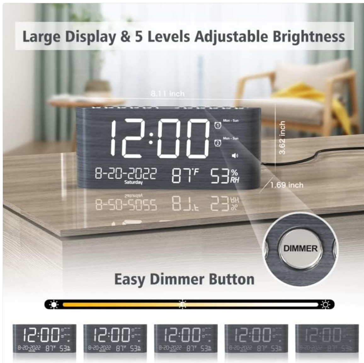
Figure 6: Display brightness adjustment.