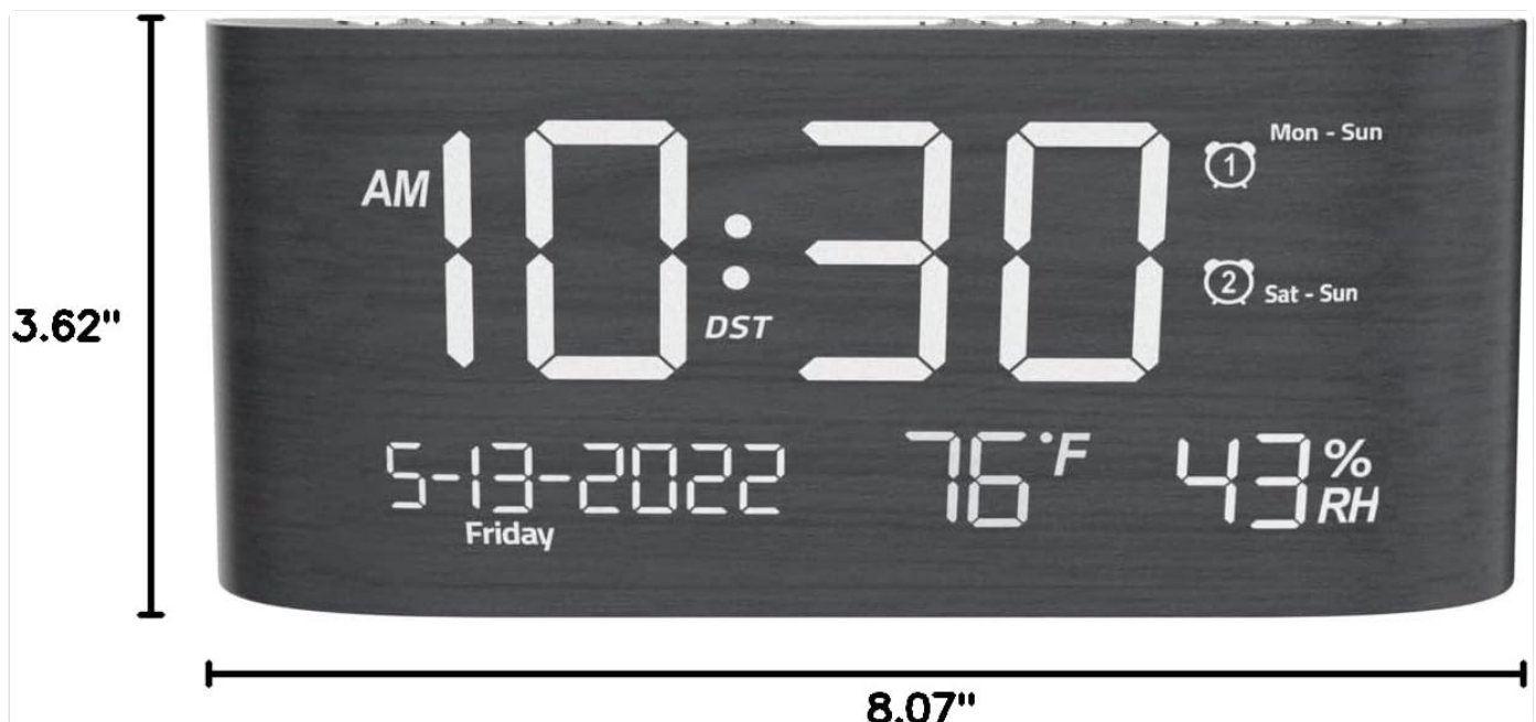
Figure 9: Product Dimensions.