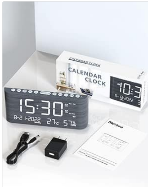
Figure 2: Package Contents.