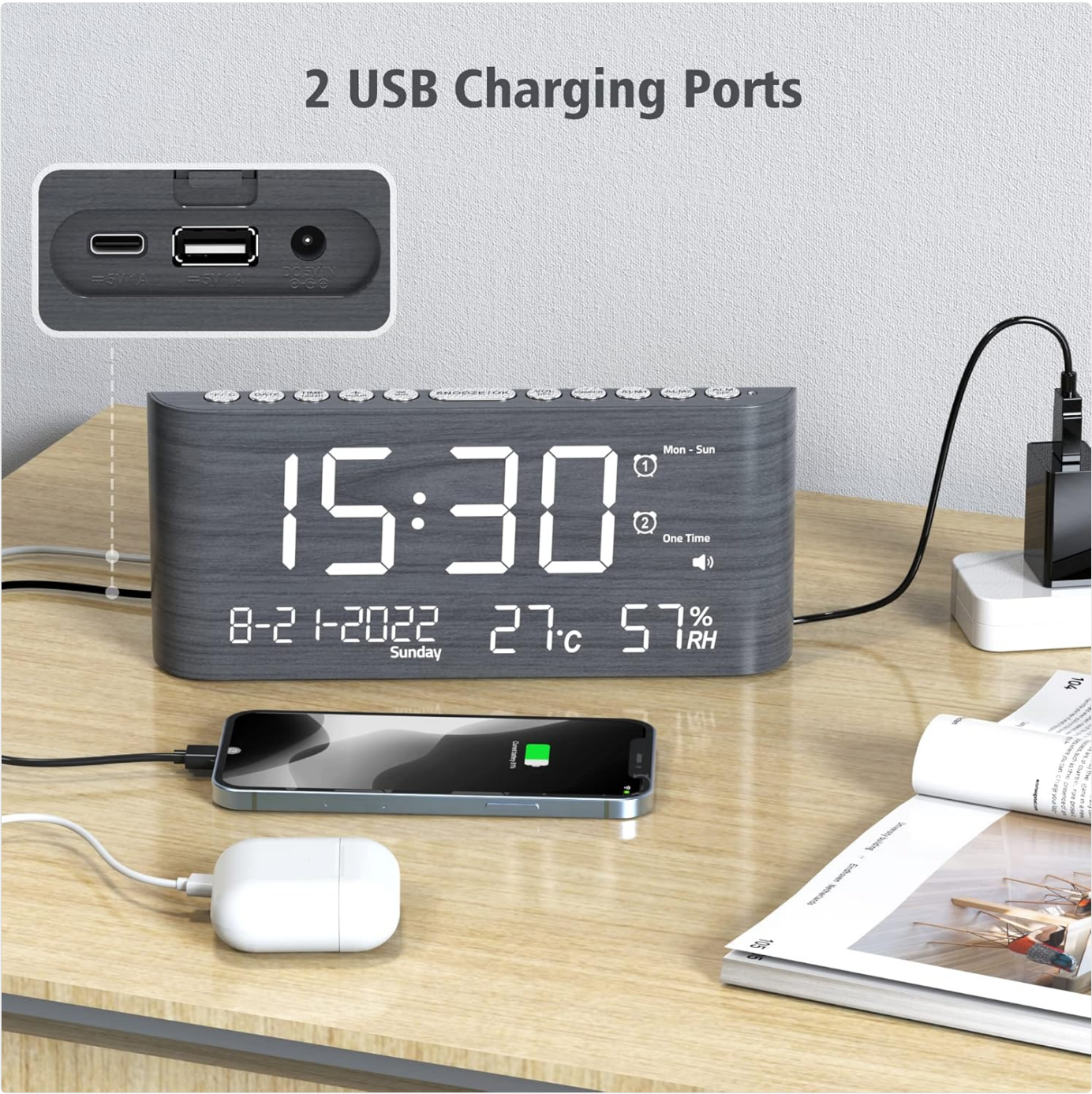
Figure 8: USB and Type-C charging ports in use.