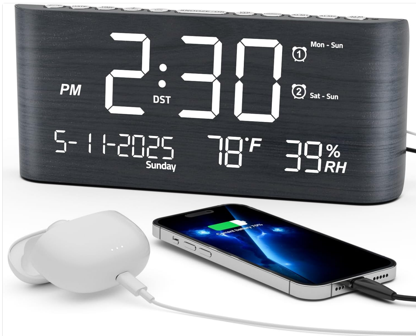
Figure 1: Mesqool Digital Alarm Clock with charging capabilities.

The Mesqool Digital Alarm Clock is a versatile device designed to enhance your living space with its multi-functional display and convenient features. It provides accurate time, date, temperature, and humidity readings, along with dual alarm capabilities and charging ports for your electronic devices.