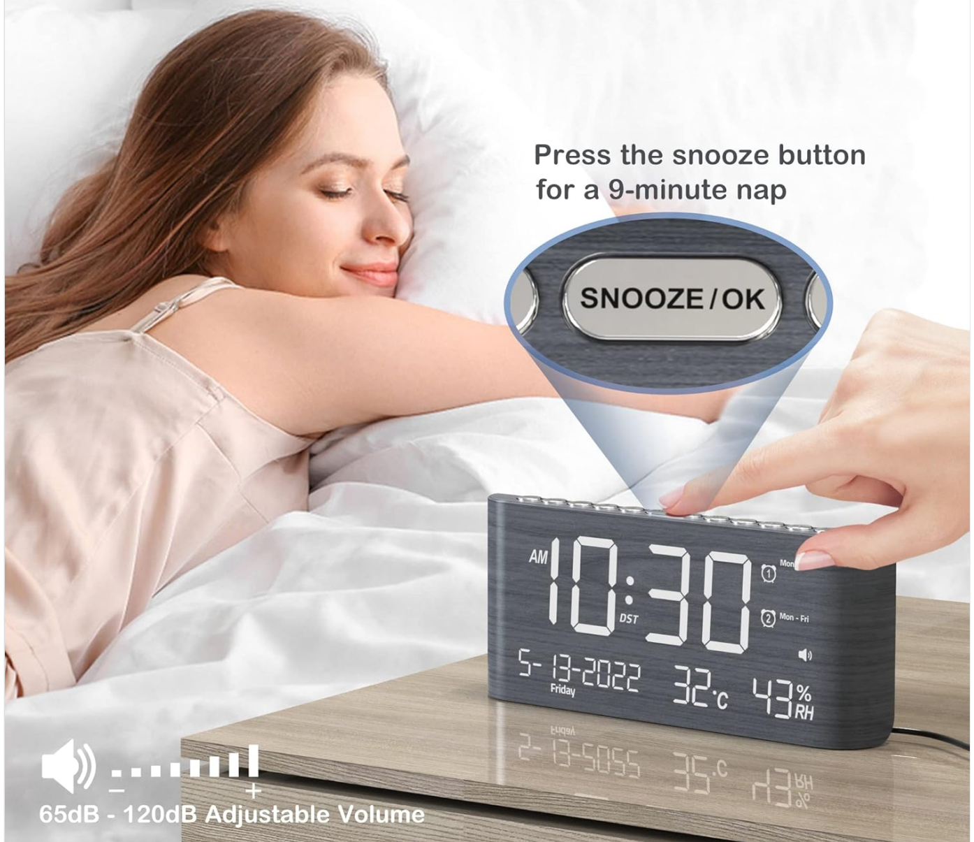
Figure 7: Alarm volume adjustment and snooze button.