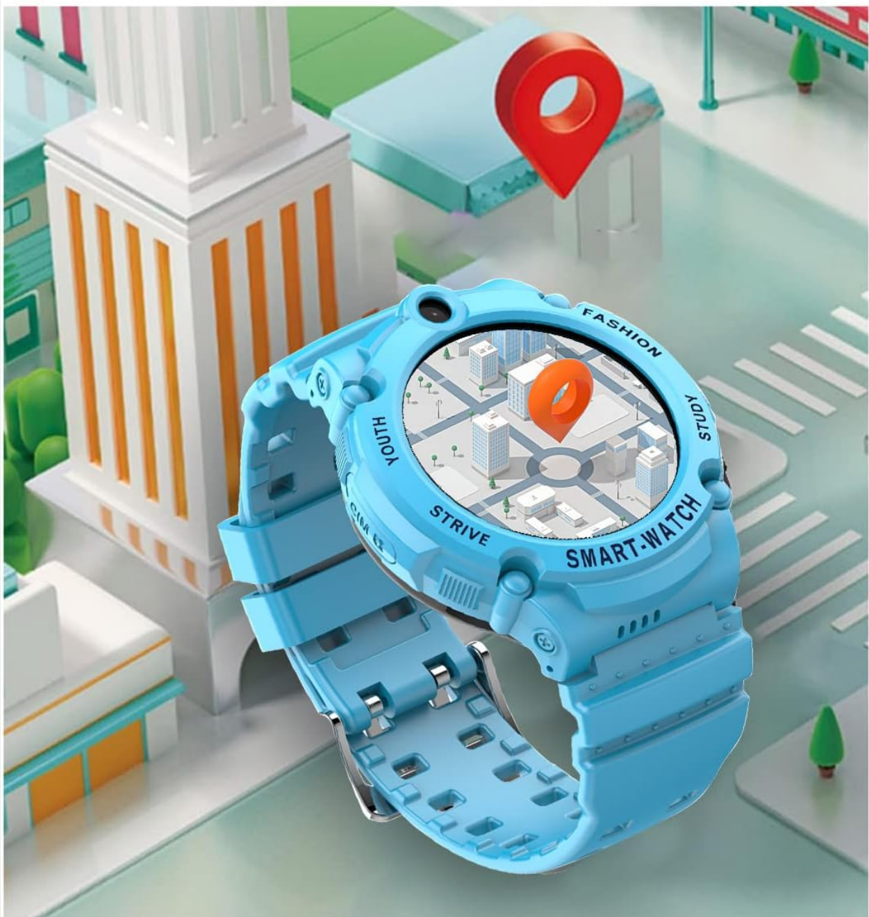
Image: The smartwatch showing a map interface, highlighting its ability to accurately track a child's location using multiple positioning systems.

BABY, GO OUT AND PLAY, HAVEN'T YOU COME HOME YET? OPEN THE MOBILE APP FOR ONE CLICK QUERY, ACCURATE POSITIONING AND MORE REASSURING FOR THE BABY.