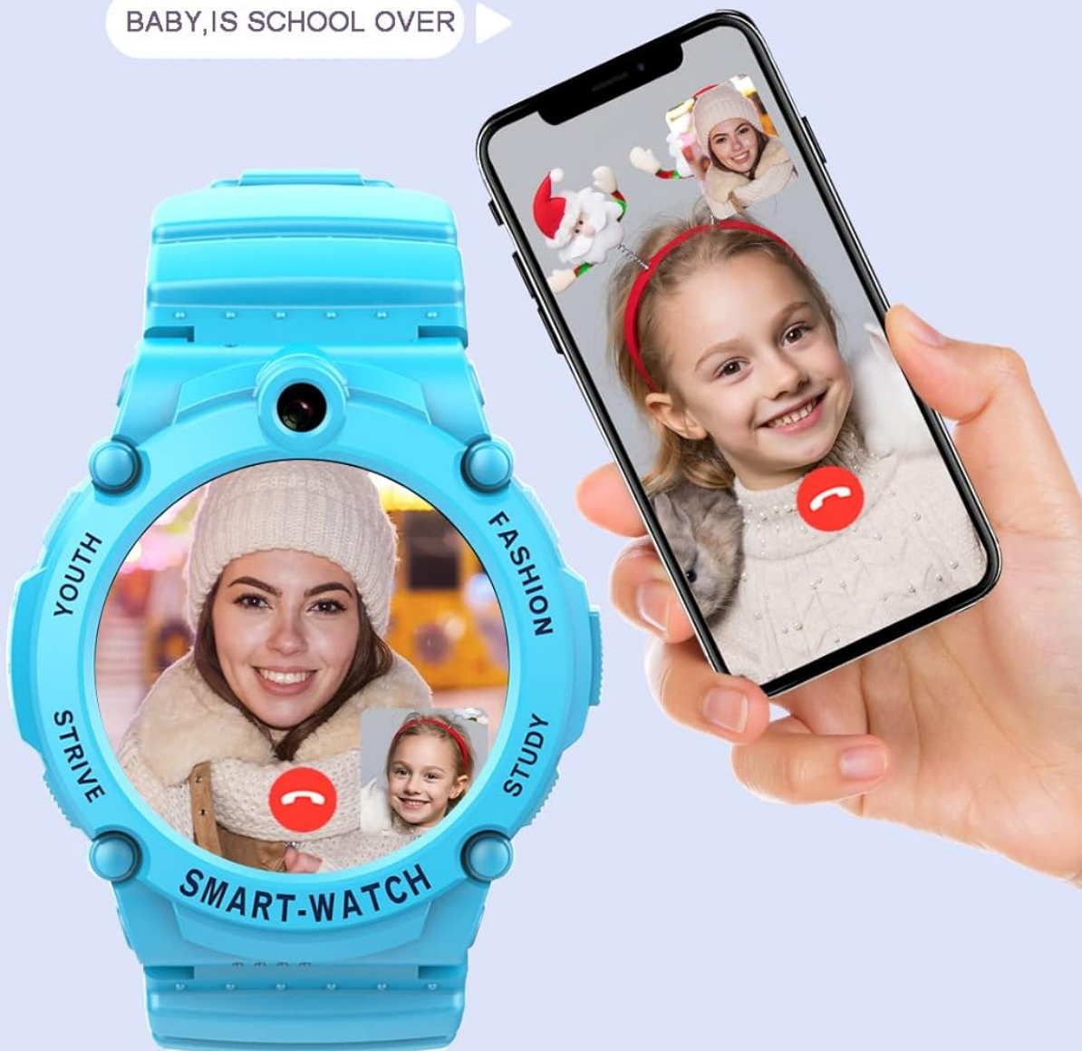
Image: The smartwatch and a smartphone demonstrating the 4G video call feature, allowing parents to connect with their children.