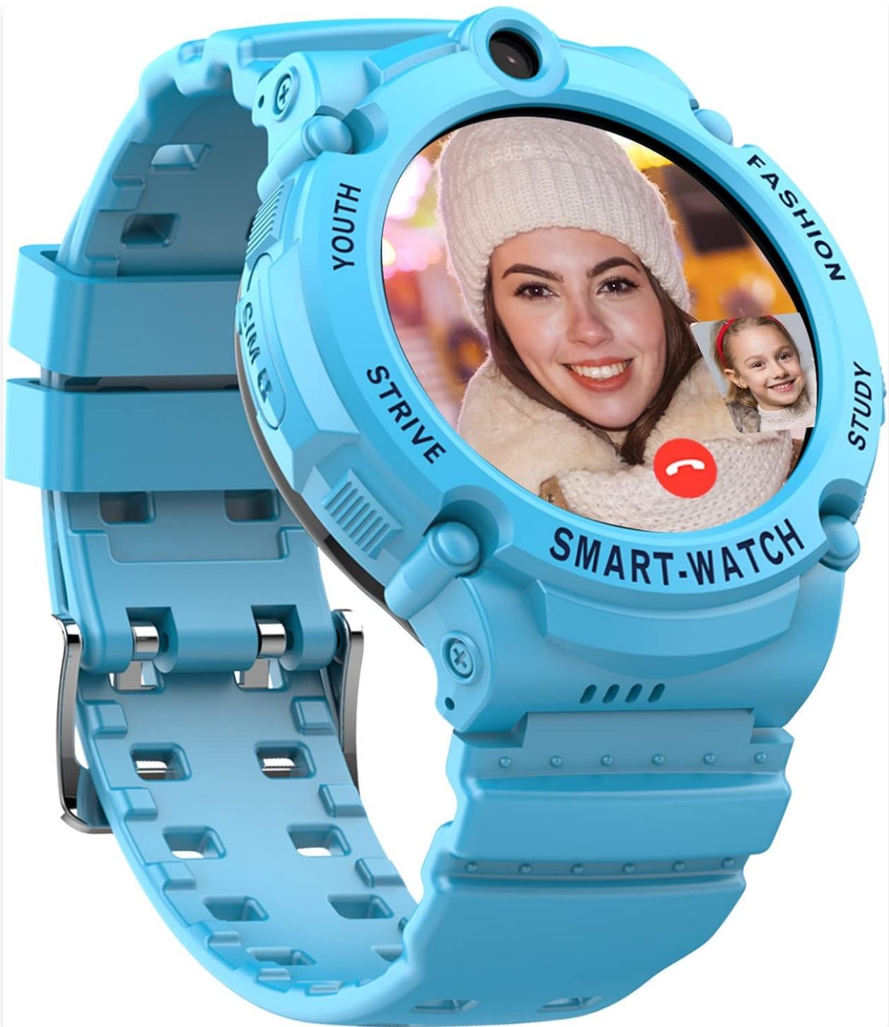
Image: The PTHTECHUS 4G Smart Watch Phone in blue, displaying an active video call on its screen.