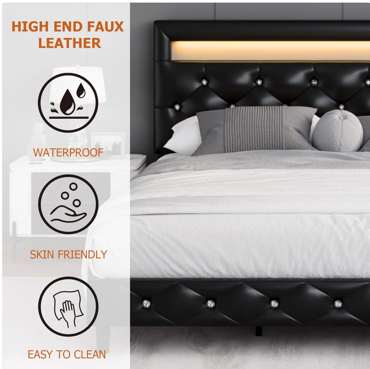
Figure 7.1: Key features of the faux leather upholstery, including ease of cleaning.