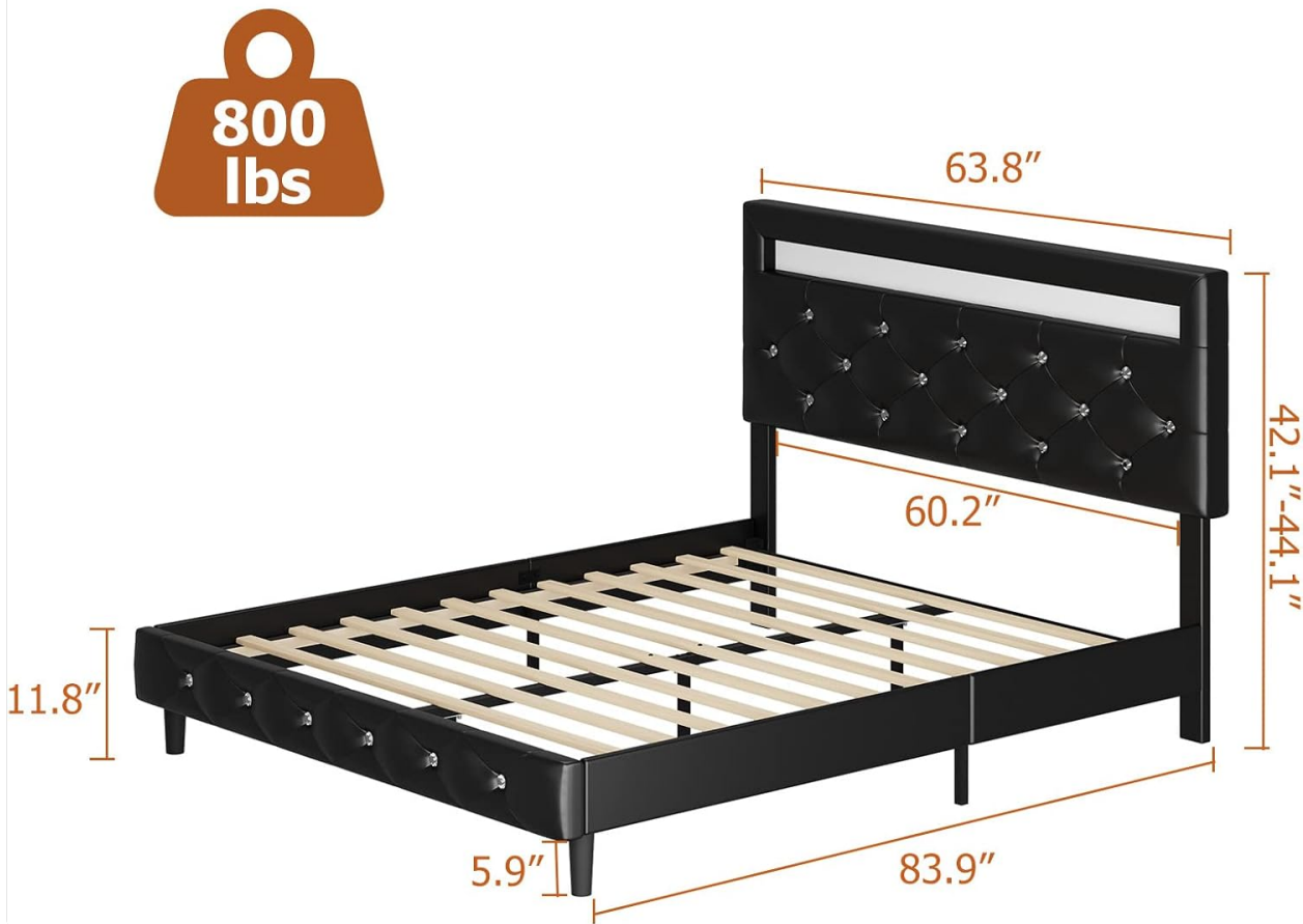
Figure 4.1: Dimensional diagram of the Keyluv Queen Bed Frame.