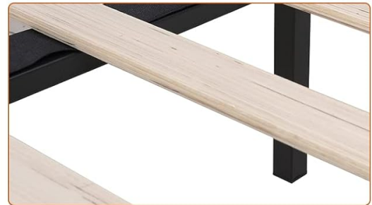
▲ Resilient Wooden Slat Support