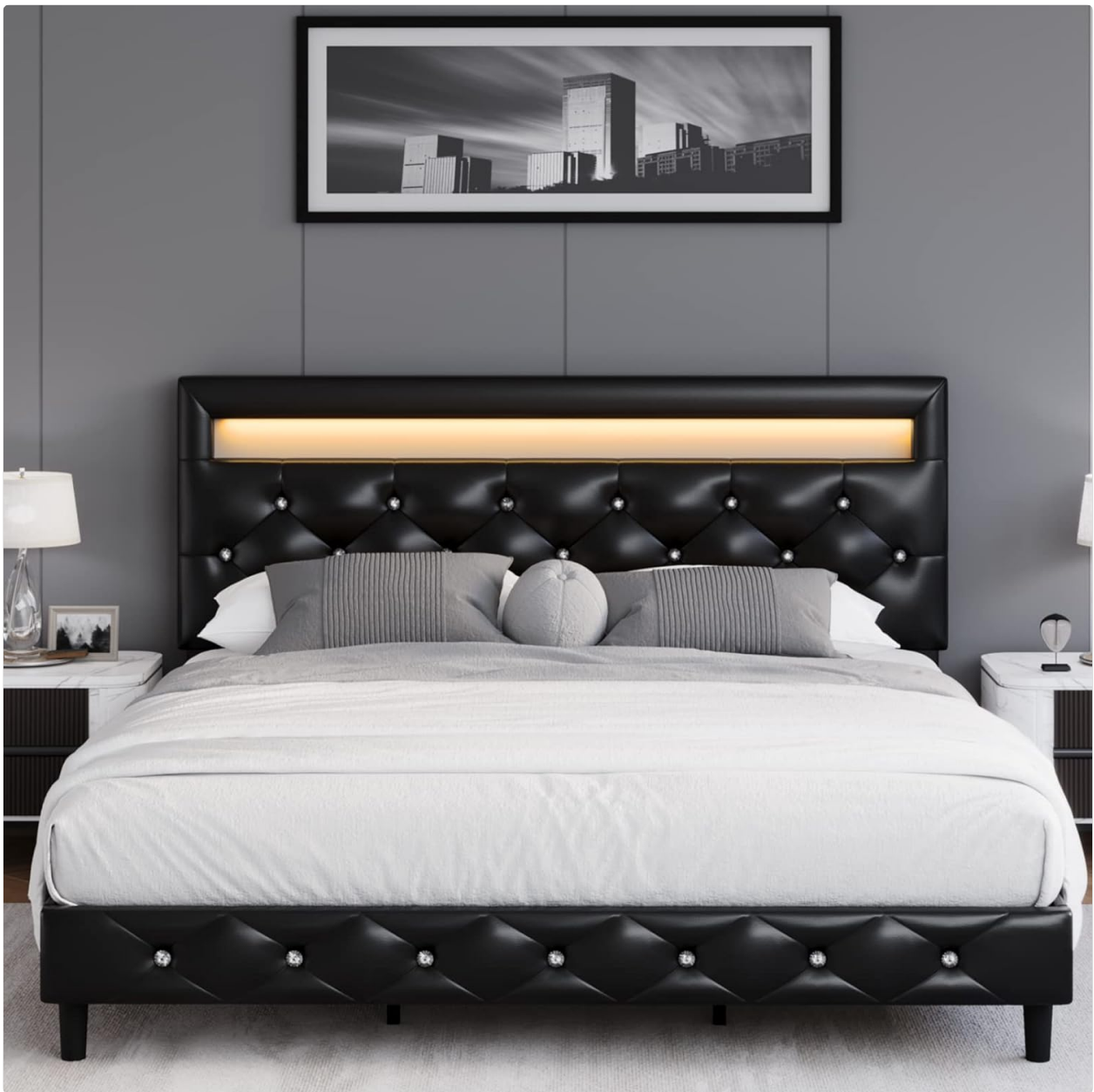
Figure 1.1: The Keyluv Modern Upholstered Queen Bed Frame, showcasing its design with integrated LED lighting.