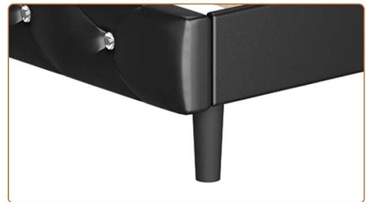
▲ Sturdy Support Feet