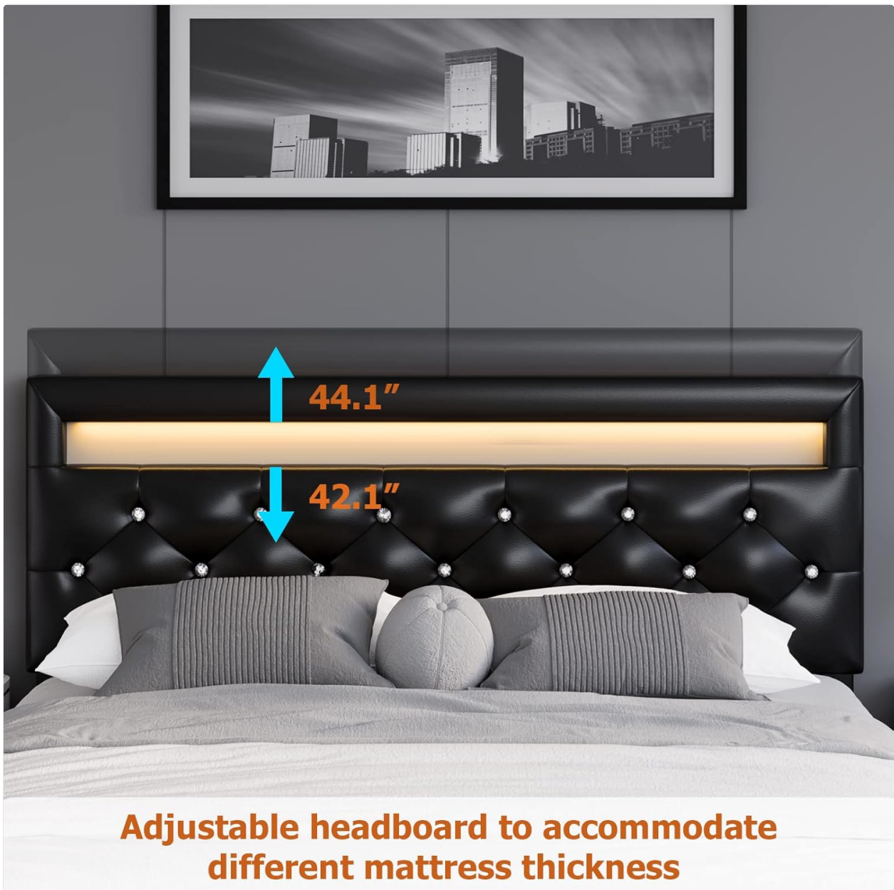
Figure 6.3: Headboard height adjustment range.

height, and then re-tightening the bolts securely.