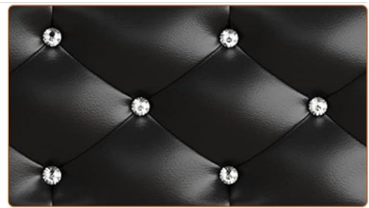
▲ Crystal Tufted Button