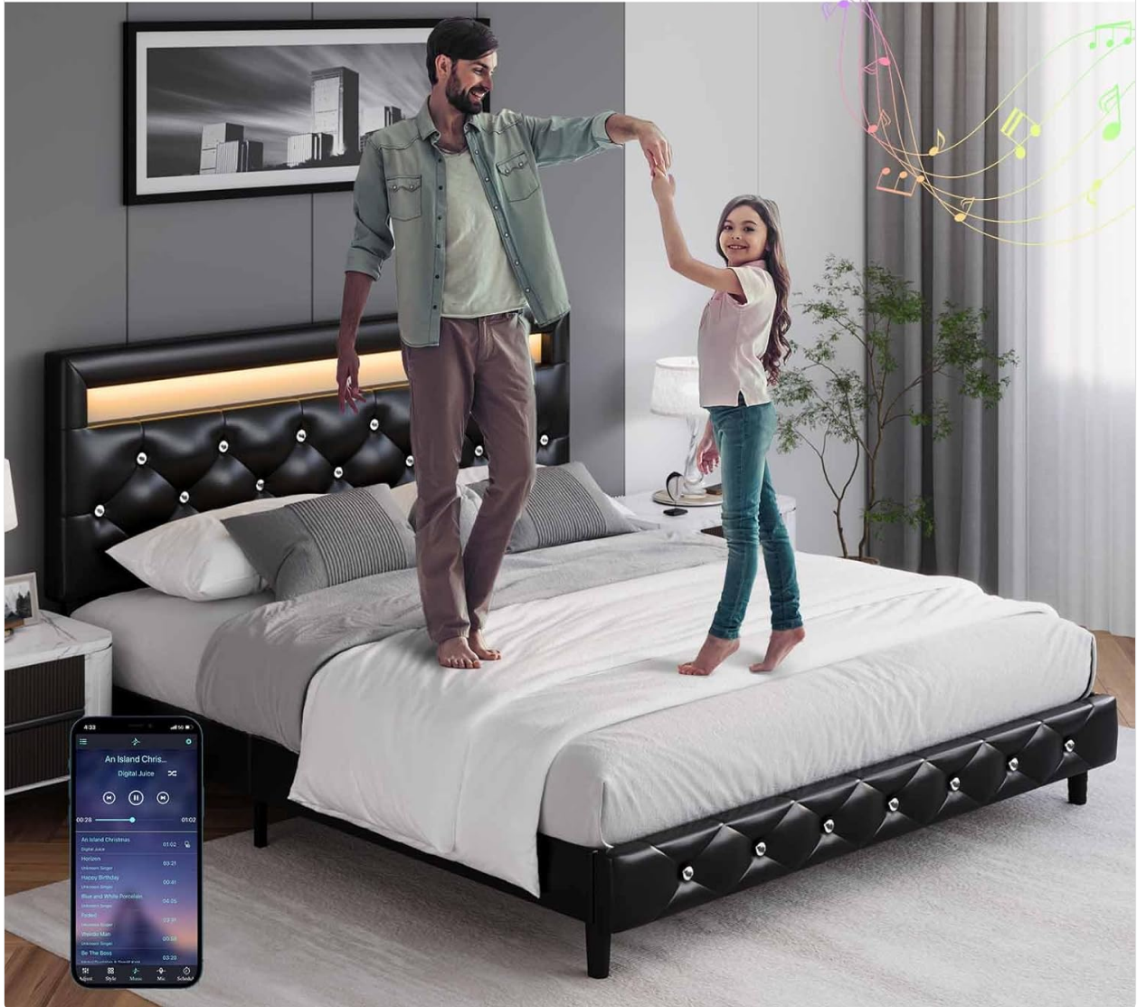
Figure 6.1: LED lights syncing to music, enhancing the room's atmosphere.

Led light strip will flash with the beats of music