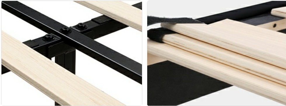
Figure 5.1: Details of the resilient wooden slat support and sturdy bed frame feet.