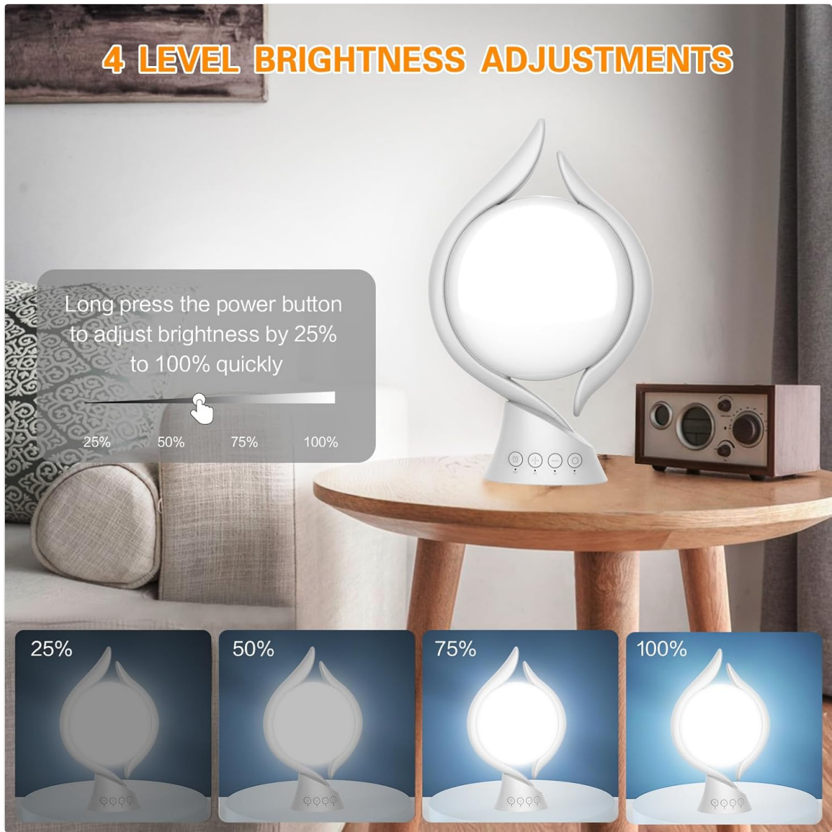
Image: The Voraiya Light Therapy Lamp demonstrating its four adjustable brightness levels, from 25% to 100% intensity.