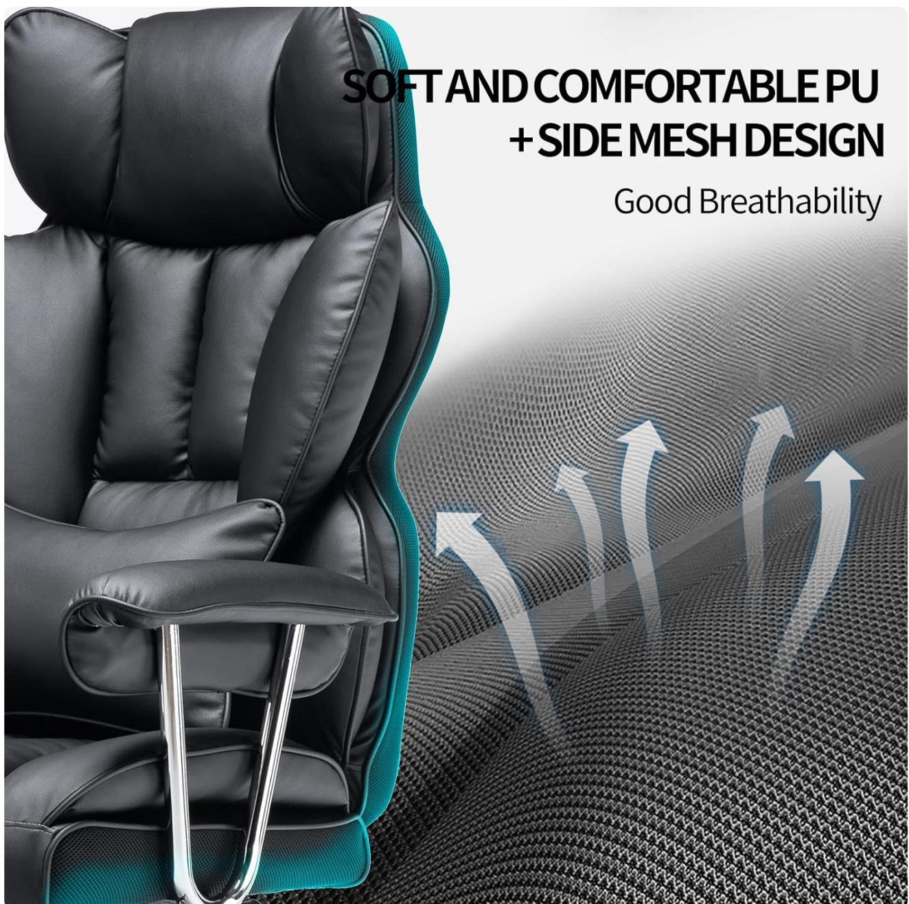
Detailed view of the comfortable dual-layered sponge seat cushion.