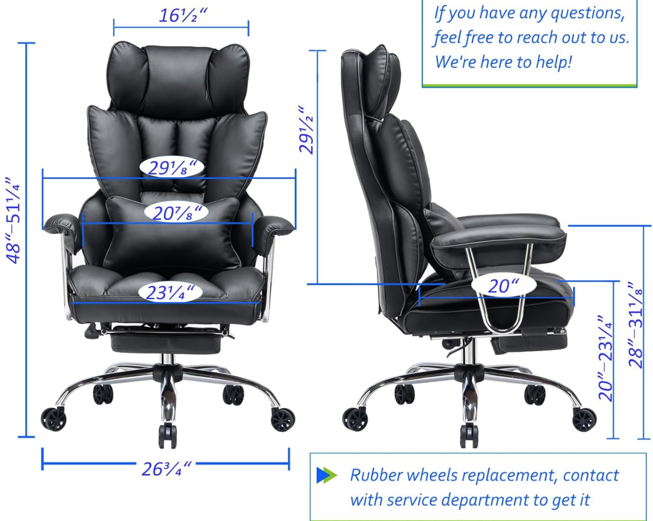
Detailed dimensions of the Efomao Desk Office Chair.