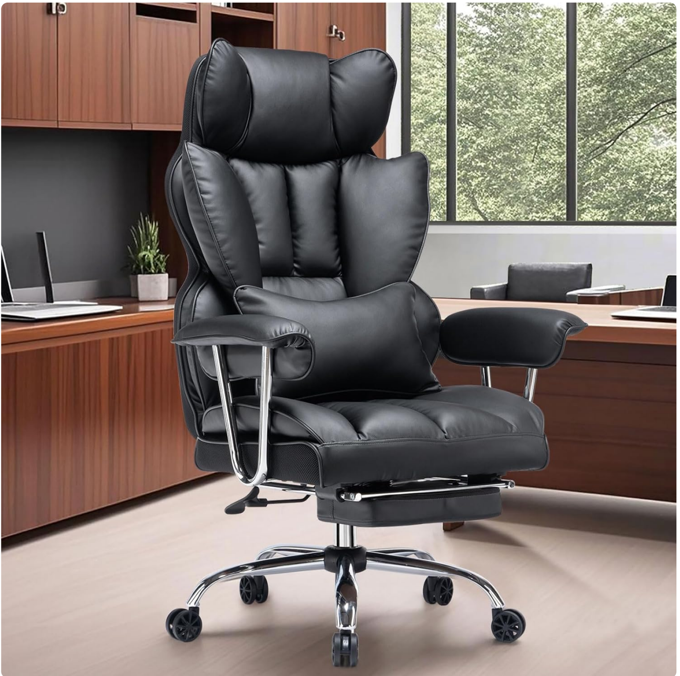
The Efomao Desk Office Chair seamlessly integrates into a modern office setting.