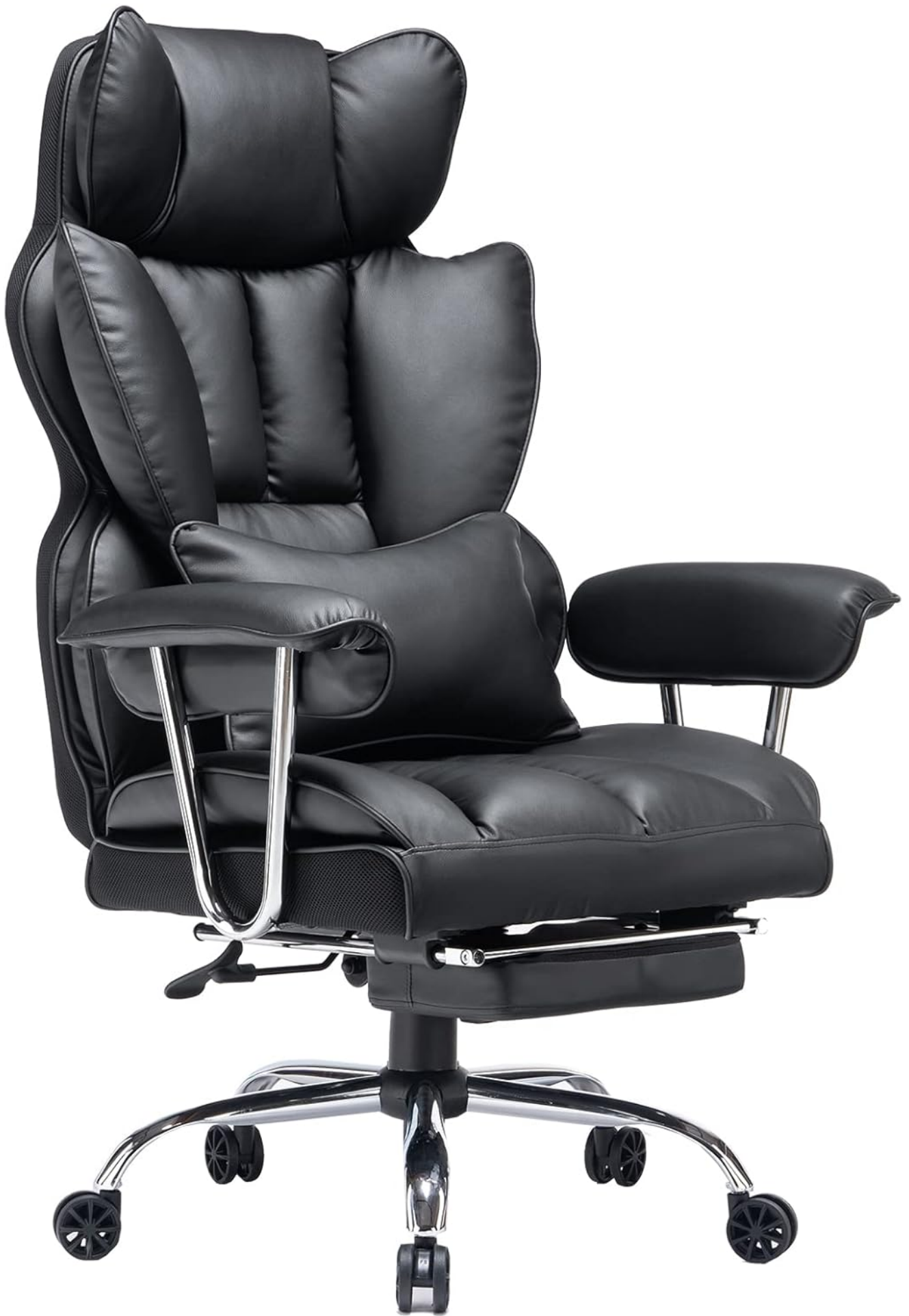
The Efomao Desk Office Chair, featuring a sleek black PU leather finish, integrated leg rest, and adjustable lumbar support.