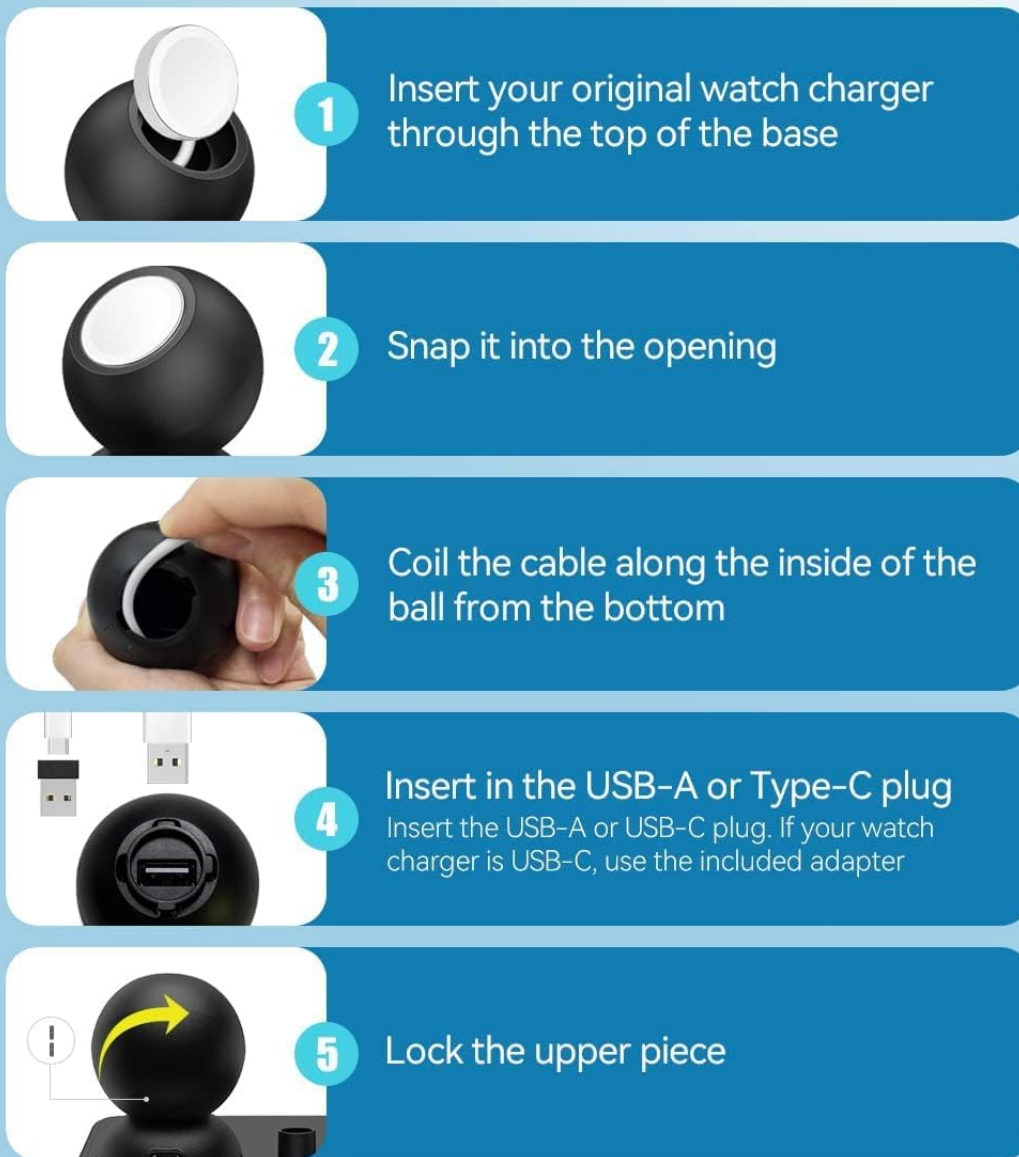
Image: A visual guide illustrating the five steps to integrate your Apple Watch charger into the dedicated spherical stand on the W58 unit.

Note: Works with original watch chargers ONLY! A magnetic watch charger is NOT INCLUDED.