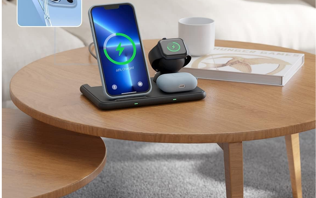
Image: A smartphone charging on the stand, illustrating compatible case thicknesses and types of cases (metal, magnetic, grips, credit cards) that should be avoided for effective wireless charging.